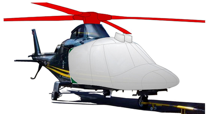
Agusta 109 Bubble, Rotor Hub & Blade Covers (illustration)