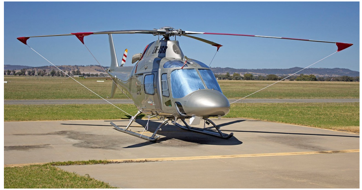
Agusta 119 Cockpit/Cabin HeatShields