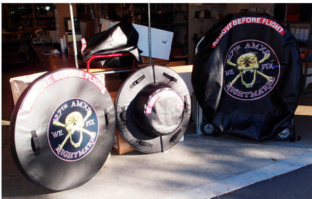
A-10 Engine Intake Plug, Exhaust Plug/Cover, Intake Cover (from left to right)

The Engine Inlet Plugs are custom fit for your Fairchild A10 Thunderbolt intakes, made with heavy-duty vinyl material, and stuffed with a single block of sculpted urethane foam. Each plug has a zipper that allows the foam to be removed and dried if necessary. Engine plugs have 'remove before flight' streamers sewn onto the face of the plugs. Most plugs are imprinted with the aircraft registration number in black for an extra charge. Storage bag NOT included. Engine plugs may be inserted after flight when the engine is still warm. Engine Inlet Plugs are commonly referred to as Cowl Plugs, Intake Plugs, Cowl Blocks, Engine Blocks, and Engine Bungs.