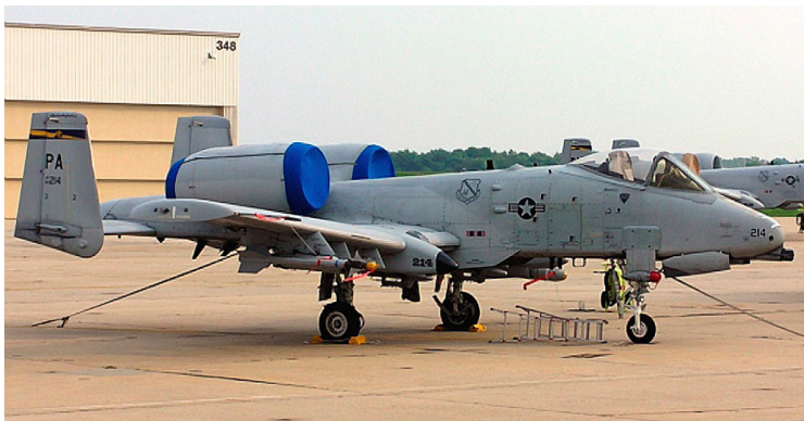
A-10 Engine Covers

ALL-YEAR USE MATERIAL - Made with Solution dyed Polyester fabric, the all-year use material is the best option for sun protection and cover longevity. This heavier more durable material is intended for all weather conditions, such as rain and snow or lots of sun.