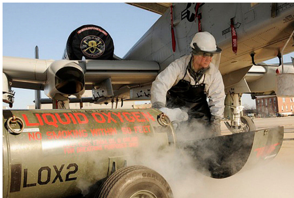
A-10 Engine Intake Cover

ALL-YEAR USE MATERIAL - Made with Solution dyed Polyester fabric, the all-year use material is the best option for sun protection and cover longevity. This heavier more durable material is intended for all weather conditions, such as rain and snow or lots of sun.