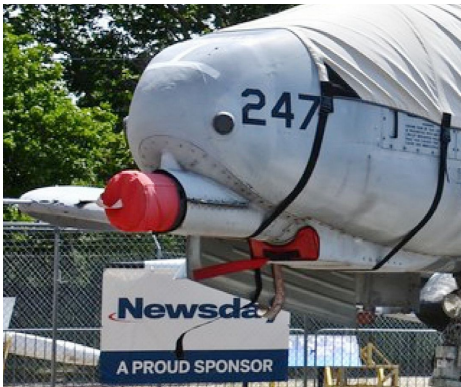
Fairchild A10 Thunderbolt Nose Gun Cover, Gun Scoop Inlet Plug