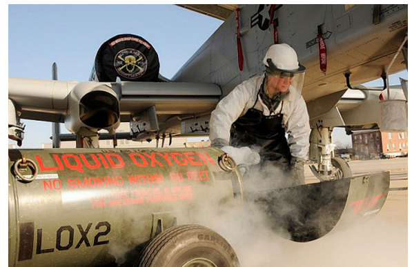
A-10 Engine Intake Cover