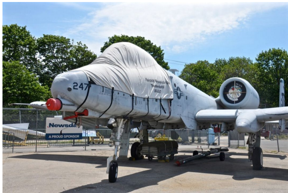
Fairchild A10 Thunderbolt Canopy Cover, Nose Gun Cover, Gun Scoop Inlet Plug

The Engine Inlet Plugs are custom fit for your Fairchild A10 Thunderbolt intakes, made with heavy-duty vinyl material, and stuffed with a single block of sculpted urethane foam. Each plug has a zipper that allows the foam to be removed and dried if necessary. Engine plugs have 'remove before flight' streamers sewn onto the face of the plugs. Most plugs are imprinted with the aircraft registration number in black for an extra charge. Storage bag NOT included. Engine plugs may be inserted after flight when the engine is still warm. Engine Inlet Plugs are commonly referred to as Cowl Plugs, Intake Plugs, Cowl Blocks, Engine Blocks, and Engine Bungs.