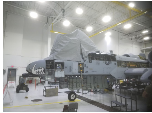
Fairchild A-10 Canopy Cover, open position