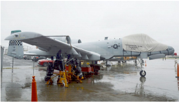
Fairchild A10 Thunderbolt Canopy Cover