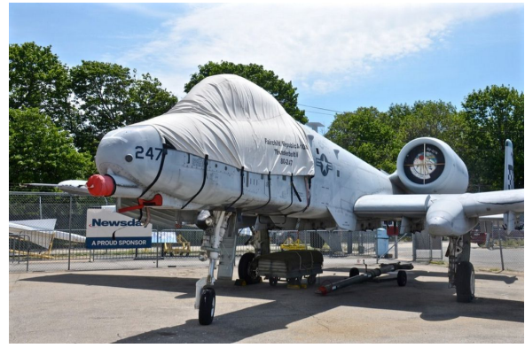
Fairchild A10 Thunderbolt Canopy Cover, Nose Gun Cover, Gun Scoop Inlet Plug