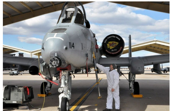
Fairchild A10 Intake Covers & Nose Gun Scoop Plug