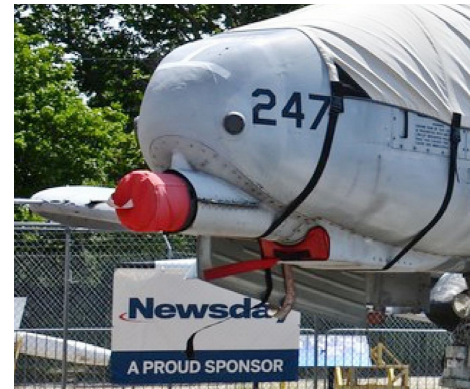
Fairchild A10 Thunderbolt Nose Gun Cover, Gun Scoop Inlet Plug