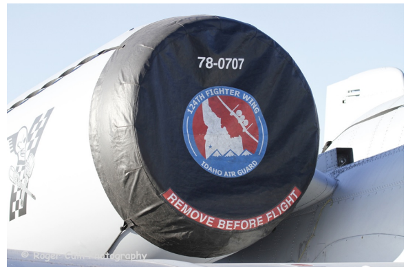
Fairchild A-10 Engine Covers