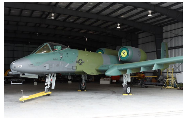
Fairchild A10 Intake Plugs, non-folding type