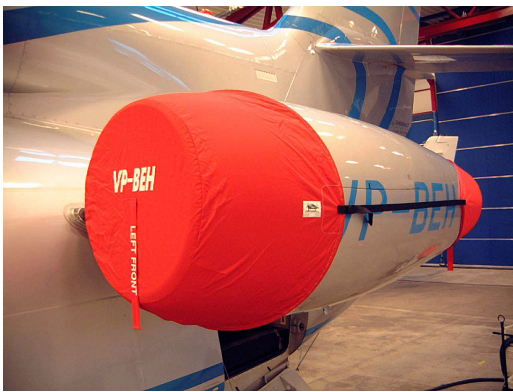
Falcon 900 Engine Covers, outboard & inboard strap detail