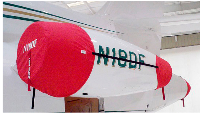
Falcon 900 Engine Cover Set