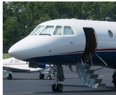
Dassault Falcon 50 Cockpit HeatShields