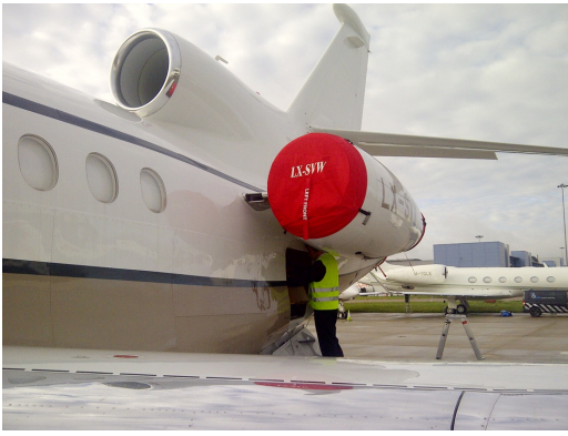
Falcon 900EX Engine Covers