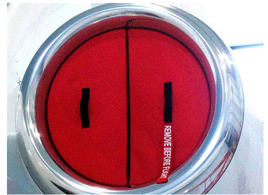
Falcon 2000EX Intake Plug