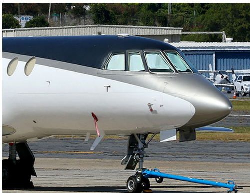
Dassault Falcon 50 Cockpit HeatShields

Cockpit Heatshields are interior sunshades for the aircraft's cockpit. The product is a unique composite of closed-cell foam with a silver mylar finish. The semi-rigid design is stiff enough to stand inside the window framing. The set folds up flat and is easily stored in the included storage sleeve. Some designs may require velcro and suction cups. Our Heatshields for jets are offered white side out because some aircraft manufacturers have issued advisories against reflective window inserts due to potential heat damage. A Heatshield is an excellent short-term remedy for cockpit overheating, but an external fabric cover is more effective for long-term protection.