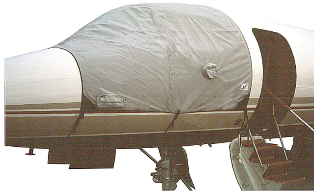
Falcon 50 Windshield Cover

This cover type is made from Silver Acrylic Sunbrella canvas and is 100% lined with a soft and smooth microfiber. Bruce's Custom Covers developed this material combination especially for aircraft protection. The outer material is medium weight and treated for water resistance, UV resistance and anti-static buildup. The inner lining is a very soft and smooth microfiber to prevent scratching. The material is very reflective, and tests show that the cabin interior temperature can be reduced to near-ambient temperature on the hottest of days. It is water, ice and snow repellent, yet breathable to allow moisture to escape from between the cover and the aircraft surface.