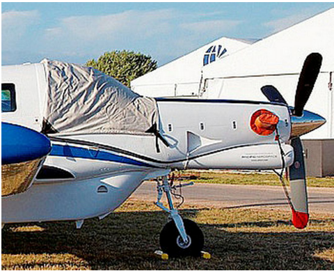
750XL Cockpit Cover & Prop Tie/Exhaust Covers

This cover type is made from Silver Acrylic Sunbrella canvas and is 100% lined with a soft and smooth microfiber. Bruce's Custom Covers developed this material combination especially for aircraft protection. The outer material is medium weight and treated for water resistance, UV resistance and anti-static buildup. The inner lining is a very soft and smooth microfiber to prevent scratching. The material is very reflective, and tests show that the cabin interior temperature can be reduced to near-ambient temperature on the hottest of days. It is water, ice and snow repellent, yet breathable to allow moisture to escape from between the cover and the aircraft surface.