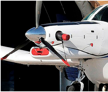
750XL Engine Inlet Plugs & Prop Tie/Exhaust Covers