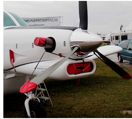
750XL Engine Inlet Plugs & Prop Tie/Exhaust Covers