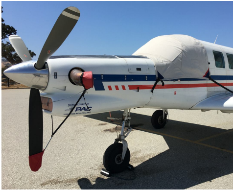
Pacific Aerospace 750XL Cockpit Cover, Prop Tie/Exhaust Covers