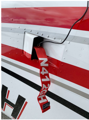
Beech Baron G58 Cabin Air Outlet Plug

Engine Inlet Plugs are custom fit for your Beech Baron 58TC intakes, made with heavy-duty vinyl material, and stuffed with a single block of sculpted urethane foam. Each plug has a zipper that allows the foam to be removed and dried if necessary. Engine plugs have warning flags that are visible from the cockpit or 'remove before flight' streamers sewn onto the face of the plugs. Most plugs are imprinted with the aircraft registration number in black for an extra charge. Storage bag NOT included. Engine plugs may be inserted after flight when the engine is still warm. Engine Inlet Plugs are commonly referred to as Cowl Plugs, Intake Plugs, Cowl Blocks, Engine Blocks, and Engine Bungs.