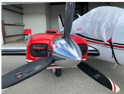
Beech Baron G58 Engine Inlet Plugs

Engine Inlet Plugs are custom fit for your Beech Baron 58TC intakes, made with heavy-duty vinyl material, and stuffed with a single block of sculpted urethane foam. Each plug has a zipper that allows the foam to be removed and dried if necessary. Engine plugs have warning flags that are visible from the cockpit or 'remove before flight' streamers sewn onto the face of the plugs. Most plugs are imprinted with the aircraft registration number in black for an extra charge. Storage bag NOT included. Engine plugs may be inserted after flight when the engine is still warm. Engine Inlet Plugs are commonly referred to as Cowl Plugs, Intake Plugs, Cowl Blocks, Engine Blocks, and Engine Bungs.