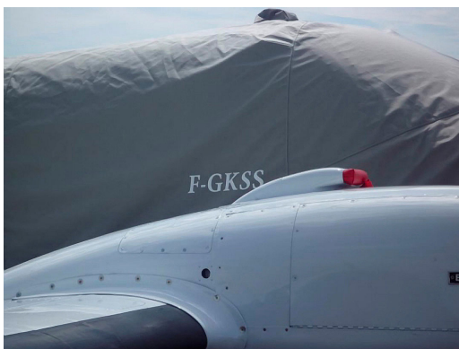
Baron Cowl Top Scoop Plugs

Engine Inlet Plugs are custom fit for your Beech Baron 58TC intakes, made with heavy-duty vinyl material, and stuffed with a single block of sculpted urethane foam. Each plug has a zipper that allows the foam to be removed and dried if necessary. Engine plugs have warning flags that are visible from the cockpit or 'remove before flight' streamers sewn onto the face of the plugs. Most plugs are imprinted with the aircraft registration number in black for an extra charge. Storage bag NOT included. Engine plugs may be inserted after flight when the engine is still warm. Engine Inlet Plugs are commonly referred to as Cowl Plugs, Intake Plugs, Cowl Blocks, Engine Blocks, and Engine Bungs.