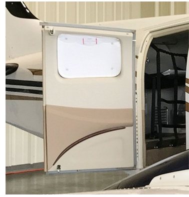
Beech Baron 58 Cabin HeatShield