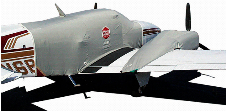
Baron Extended Canopy Cover & Engine Covers

This cover type is made from Silver Acrylic Sunbrella canvas and is 100% lined with a soft and smooth microfiber. Bruce's Custom Covers developed this material combination especially for aircraft protection. The outer material is medium weight and treated for water resistance, UV resistance and anti-static buildup. The inner lining is a very soft and smooth microfiber to prevent scratching. The material is very reflective, and tests show that the cabin interior temperature can be reduced to near-ambient temperature on the hottest of days. It is water, ice and snow repellent, yet breathable to allow moisture to escape from between the cover and the aircraft surface.