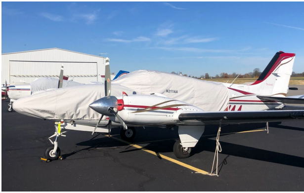
Baron Beech E-55 Extended Canopy/Nose Cover