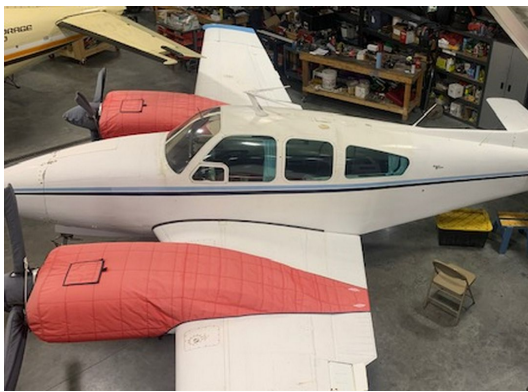
Beech Baron B55 Insulated Engine Covers