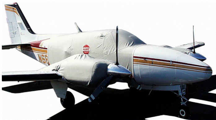
Standard Canopy Cover & Engine Plugs. Extended Canopy Cover & Engine Cover

This cover type is made from Silver Acrylic Sunbrella canvas and is 100% lined with a soft and smooth microfiber. Bruce's Custom Covers developed this material combination especially for aircraft protection. The outer material is medium weight and treated for water resistance, UV resistance and anti-static buildup. The inner lining is a very soft and smooth microfiber to prevent scratching. The material is very reflective, and tests show that the cabin interior temperature can be reduced to near-ambient temperature on the hottest of days. It is water, ice and snow repellent, yet breathable to allow moisture to escape from between the cover and the aircraft surface.