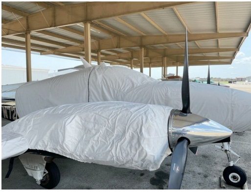
Beech Baron 58P Extended Canopy/Nose Cover, Wing/Engine Covers (test fit)