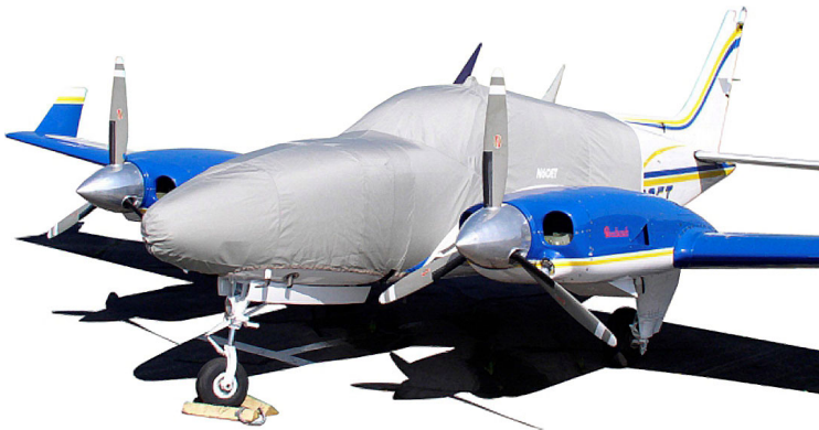
Baron Canopy/Nose Cover

Travel Covers are made with Silver Solution-Dyed Polyester fabric and only lined over the windshield to save weight. The material is lightweight and more compact for easy stowage in the aircraft. The polyester material is water resistant, but only intended for occasional use outside. We also have an ultra lightweight material available for fitted hangar dust covers. For daily outdoor use, the non-travel Sunbrella Cover is the best choice.