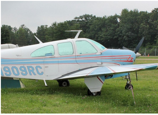
Beech Bonanza/Debonair HeatShield Set