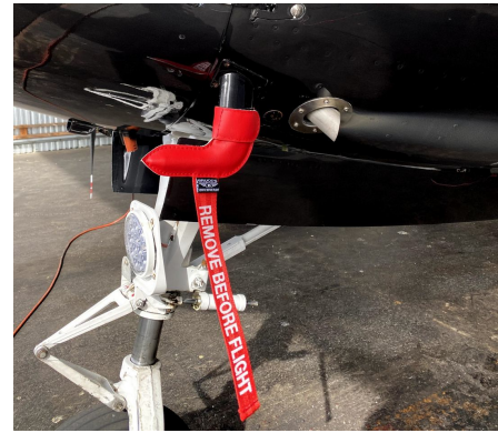
Baron 58 Pitot Cover