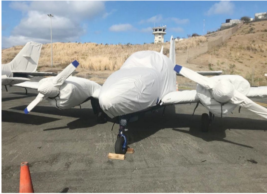
Beech Travel Air Full Cover Set

WINTER USE MATERIAL - Made with Solution-Dyed Polyester fabric, this option is intended for seasonal use to aid in deicing, rain mitigation, or for occasional travel. The material is lighter and more compact, but more susceptible to UV damage and may have a shorter useful life if used continuously outside than the all-year use material.