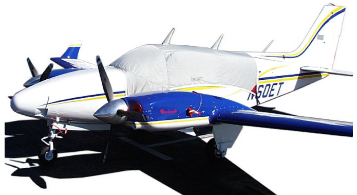
Standard Canopy Cover & Engine Plugs