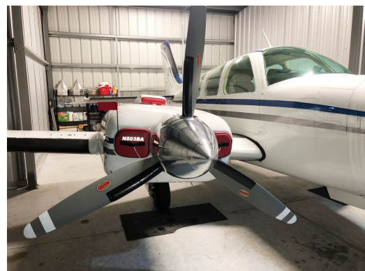
Beech Baron Engine Plugs