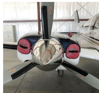
Beech Baron 58P Engine Inlet Plugs