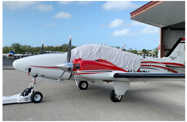
Beech Baron G58 Canopy Cover