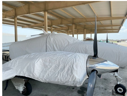
Beech Baron 58P Extended Canopy/Nose Cover, Wing/Engine Covers (test fit)