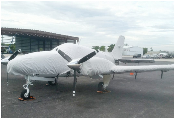
Full Cover Set (58P-020, 58P-225, 58P-405)

WINTER USE MATERIAL - Made with Solution-Dyed Polyester fabric, this option is intended for seasonal use to aid in deicing, rain mitigation, or for occasional travel. The material is lighter and more compact, but more susceptible to UV damage and may have a shorter useful life if used continuously outside than the all-year use material.