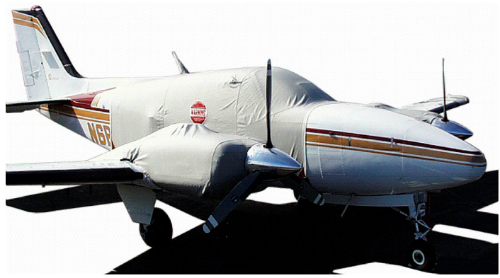
Standard Canopy Cover & Engine Plugs. Extended Canopy Cover & Engine Cover