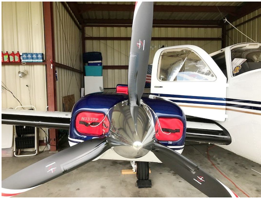
Beech Baron 58 Engine Inlet Plugs & Cowl Top Plugs