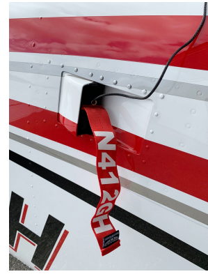
Beech Baron G58 Cabin Air Outlet Plug