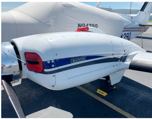
Beech Baron 58 Engine Plugs