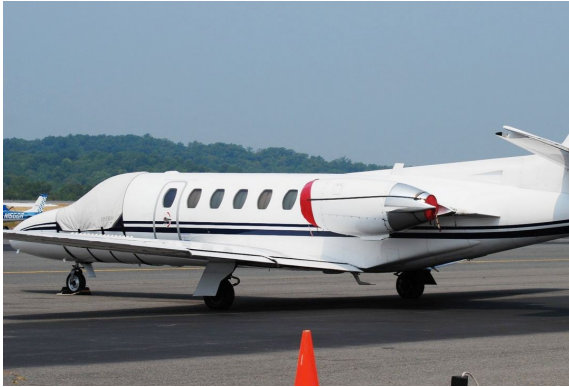
Cessna Citation S2 Cockpit Cover, Intake Covers & Exhaust Plugs

This cover type is made from Silver Acrylic Sunbrella canvas and is 100% lined with a soft and smooth microfiber. Bruce's Custom Covers developed this material combination especially for aircraft protection. The outer material is medium weight and treated for water resistance, UV resistance and anti-static buildup. The inner lining is a very soft and smooth microfiber to prevent scratching. The material is very reflective, and tests show that the cabin interior temperature can be reduced to near-ambient temperature on the hottest of days. It is water, ice and snow repellent, yet breathable to allow moisture to escape from between the cover and the aircraft surface.