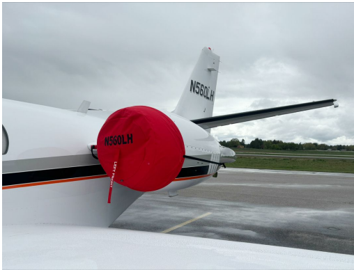
Cessna 560 Intake Covers, includes pylon plugs (set of 4)

The Cessna Citationjet V Encore (560) Intake/Exhaust Plugs are custom fit for the intake and exhaust openings, made with heavy-duty vinyl material, and stuffed with a single block of sculpted urethane foam. Each plug has a zipper that allows the foam to be removed and dried if necessary. Engine plugs have 'remove before flight' streamers sewn onto the face of the plugs. Most plugs are imprinted with the aircraft registration number in black. Engine plugs may be inserted after flight when the engine is still warm. Engine Inlet Plugs are commonly referred to as Cowl Plugs, Intake Plugs, Cowl Blocks, Engine Blocks, and Engine Bungs.