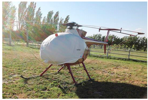
MD500D Bubble Cover with Intake Add-On