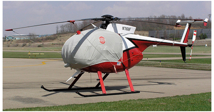
Hughes 500D Bubble Cover with Wire Strike detail and Blade Tie-downs