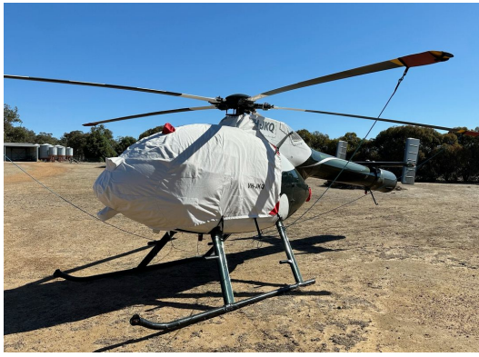
MDD 520 NOTAR Bubble Cover w/Intake Cover Add-On