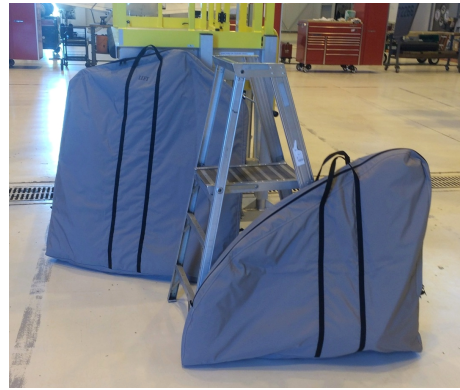
Eurocopter EC-145 Padded Bags for Removable Doors