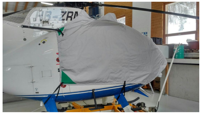
MD520 Bubble Cover with Intake Cover Add-On