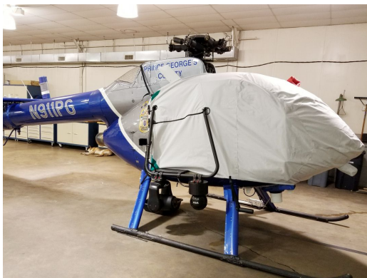
McDonnell Douglas MDD 520 Notar Bubble Cover, with special missions equipment.