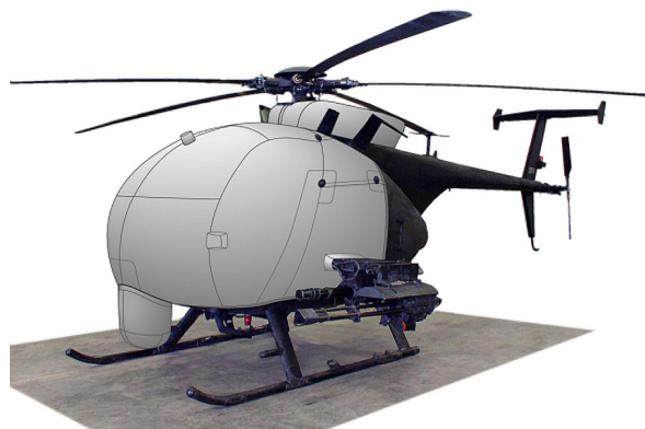
MH-6J Bubble, Flir & Doghouse Covers (illustration)