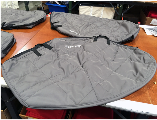
Protective Door Bags

**Padded Door Bags* are designed to provide portable protection of the doors when they are removed from the aircraft. They are padded to moderate thickness, zippered closed, and have sturdy carry handles for easy transport.