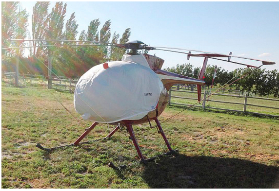
MD500D Bubble Cover with Intake Add-On