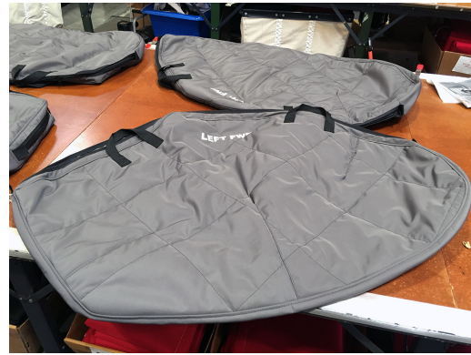
Protective Door Bags