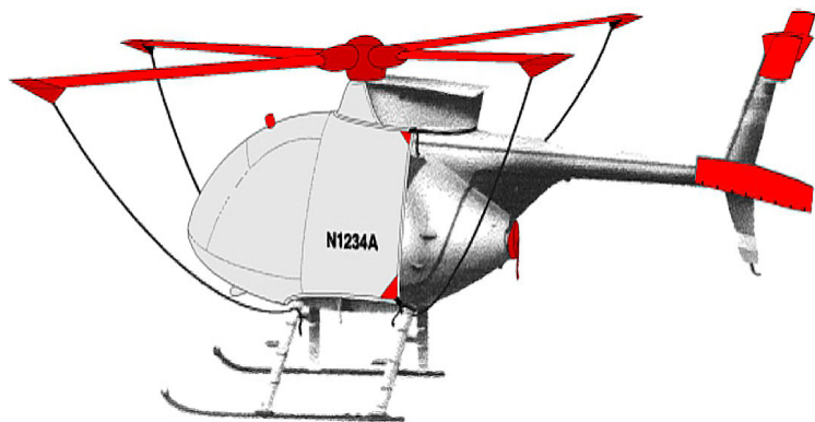
Full Cover Set