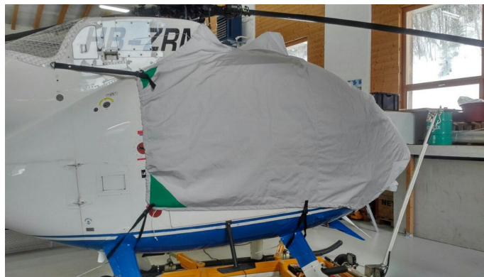
MD520 Bubble Cover with Intake Cover Add-On