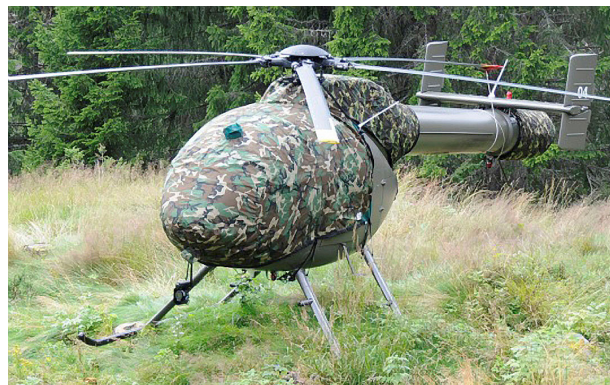
MD520 NOTAR Bubble, Engine, & NOTAR Covers & Blade Tie-downs