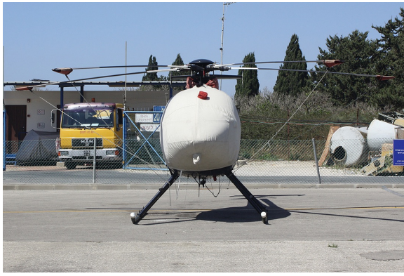
MD-500E Bubble Cover, Blade Tie-Diwns