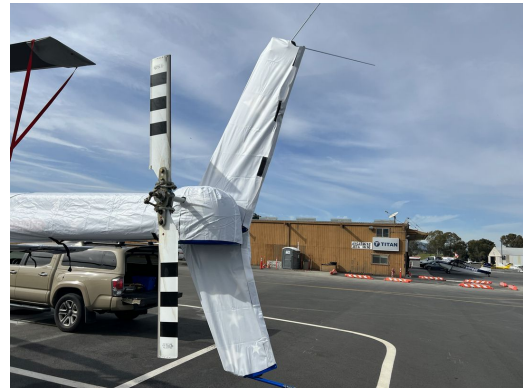
Bell 505 Tailboom & Stabilizer Covers, test fit cover