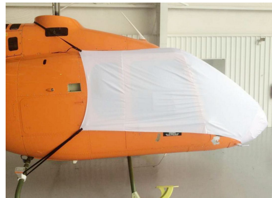
Bell 505 Bubble Cover, test fit cover.