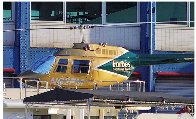
Bell 206B Jetranger Windshield HeatShields