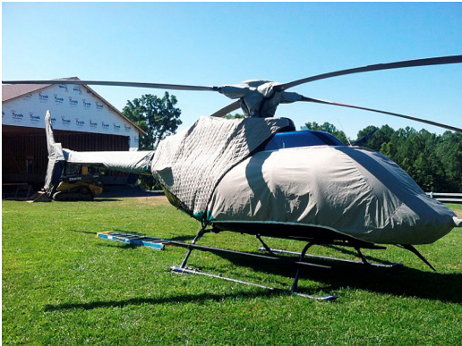
Bell 407 Covers: Bubble, Insulated Engine, Rotor Mast, Blades, Tailboom, Vertical Stabilizer and Tail Rotor

The Engine Inlet Plugs are custom fit for your Bell 505 Jet Ranger X intakes, made with heavy-duty vinyl material, and stuffed with a single block of sculpted urethane foam. Each plug has a zipper that allows the foam to be removed and dried if necessary. Engine plugs have 'Remove Before Flight' streamers sewn onto the face of the plugs. Most plugs are imprinted with the aircraft registration number in black for an extra charge. Storage bag NOT included. Engine plugs may be inserted after flight when the engine is still warm. Engine Inlet Plugs are commonly referred to as Cowl Plugs, Intake Plugs, Cowl Blocks, Engine Blocks, and Engine Bungs.