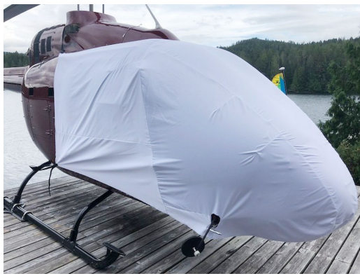
Bell 505 Bubble Cover, test fit cover