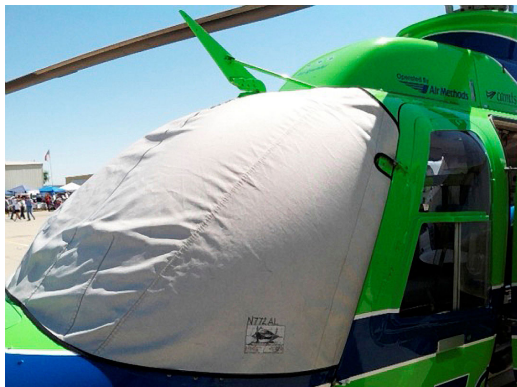
Bell 407 Windshield Cover

Travel Covers are made with Silver Solution-Dyed Polyester fabric and fully lined over the entire cover. The material is lightweight and more compact for easy storage in the aircraft. The polyester material is water resistant, but only intended for occasional use outside. We also have an ultra lightweight material available for fitted hangar dust covers. For daily outdoor use, the non-travel Sunbrella Cover is the best choice.