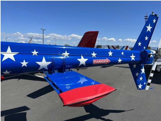
Bell 505 Horizontal Stabilizer Tip Pads

Designed to prevent damage to the aircraft extremities in crowded hangars, these products are made of bright red Naugahyde and thickly padded with a sandwich of closed cell foam.