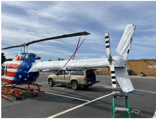
Bell 505 Tailboom & Stabilizer Covers, test fit cover