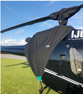
Bell 505 Engine, Rotor Mast & Blade Covers

WINTER USE MATERIAL - Made with Solution-Dyed Polyester fabric, this option is intended for seasonal use to aid in deicing, rain mitigation, or for occasional travel. The material is lighter and more compact, but more susceptible to UV damage and may have a shorter useful life if used continuously outside than the all-year use material.