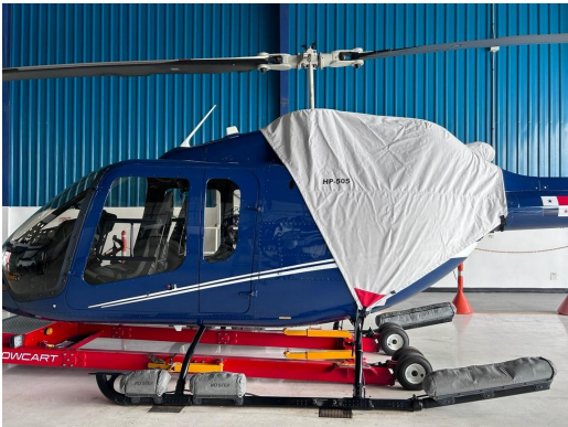
Bell 505 Engine Cover