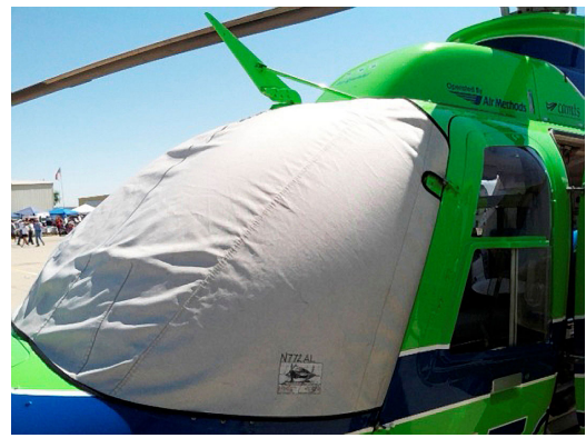
Bell 407 Windshield Cover