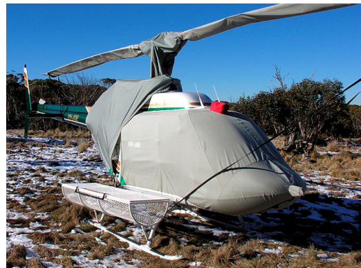
JetRanger Bubble, Engine, Rotor Hub & Blade Covers (& Tie-Downs)