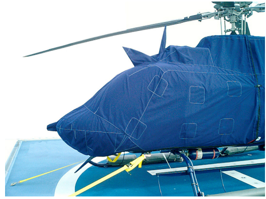
206B/206L/407 Full Body Cover