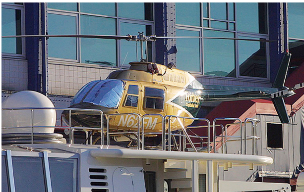
Bell 206B Jetranger Windshield HeatShields

Heatshields are interior sunshades for an aircraft's windows or canopy glass. The product is a unique composite of closed-cell foam with a silver mylar finish. The semi-rigid design is stiff enough to stand along the inside of the windshield using sun visors or window framing. It folds up flat and easily stores in the included storage sleeve. Some designs may require velcro and suction cups. A Heatshield is an excellent short-term remedy for cockpit overheating.