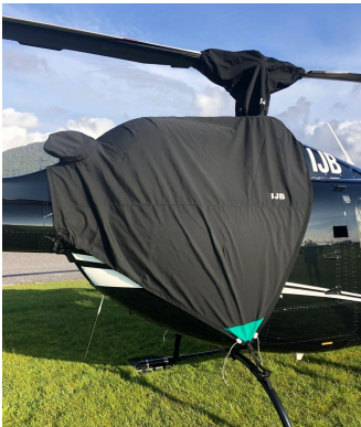
Bell 505 Engine, Rotor Mast & Blade Covers