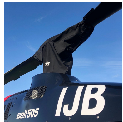
Bell 505 Rotor Mast & Blade Covers