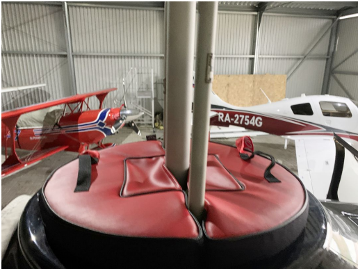
Bell 505 Jet Ranger X Swash Plate Plug