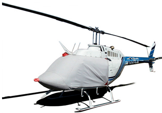
JetRanger Bubble Cover

Travel Covers are made with Silver Solution-Dyed Polyester fabric and fully lined over the entire cover. The material is lightweight and more compact for easy storage in the aircraft. The polyester material is water resistant, but only intended for occasional use outside. We also have an ultra lightweight material available for fitted hangar dust covers. For daily outdoor use, the non-travel Sunbrella Cover is the best choice.