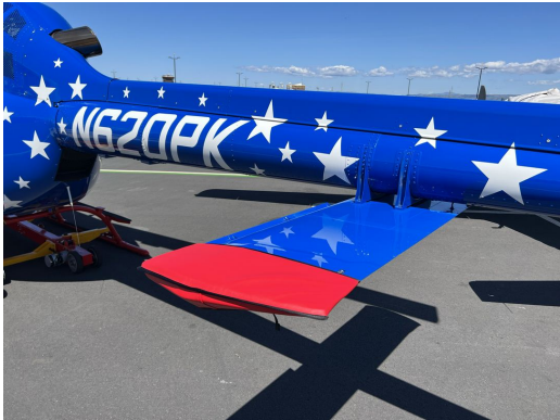
Bell 505 Horizontal Stabilizer Tip Pads