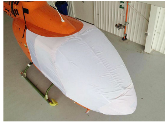
Bell 505 Bubble Cover, test fit cover.