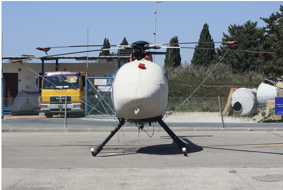
MD-500E Bubble Cover, Blade Tie-Downs