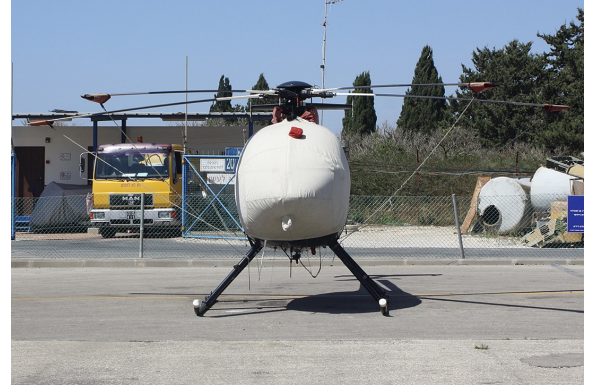
MD-500E Bubble Cover, Blade Tie-Downs