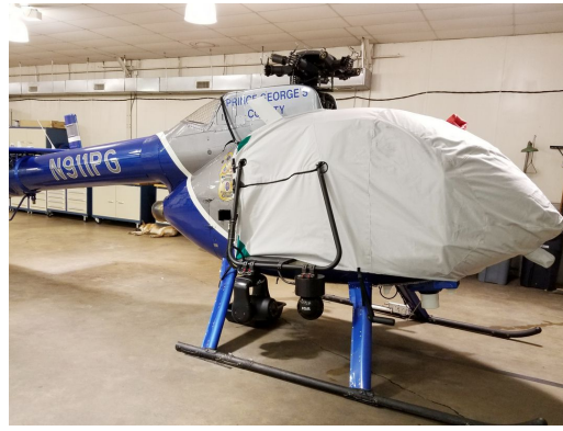
McDonnell Douglas MDD 520 Notar Bubble Cover, with special missions equipment.