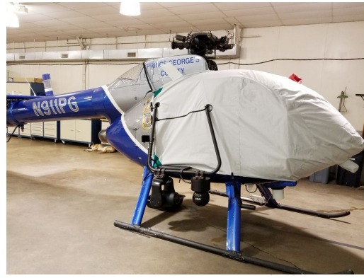
McDonnell Douglas MDD 520 Notar Bubble Cover, with special missions equipment.