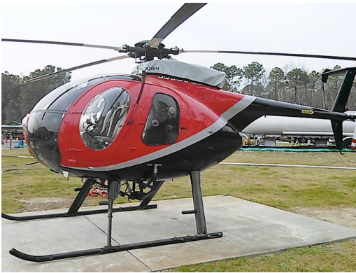
Customized Engine Cover

WINTER USE MATERIAL - Made with Solution-Dyed Polyester fabric, this option is intended for seasonal use to aid in deicing, rain mitigation, or for occasional travel. The material is lighter and more compact, but more susceptible to UV damage and may have a shorter useful life if used continuously outside than the all-year use material.