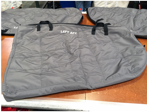
Protective Door Bags