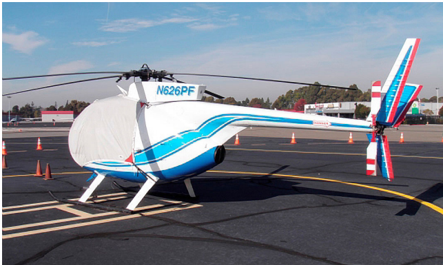
MD500C Bubble Cover with Wire Strike detail

Travel Covers are made with Silver Solution-Dyed Polyester fabric and fully lined over the entire cover. The material is lightweight and more compact for easy stowage in the aircraft. The polyester material is water resistant, but only intended for occasional use outside. We also have an ultra lightweight material available for fitted hangar dust covers. For daily outdoor use, the non-travel Sunbrella Cover is the best choice.