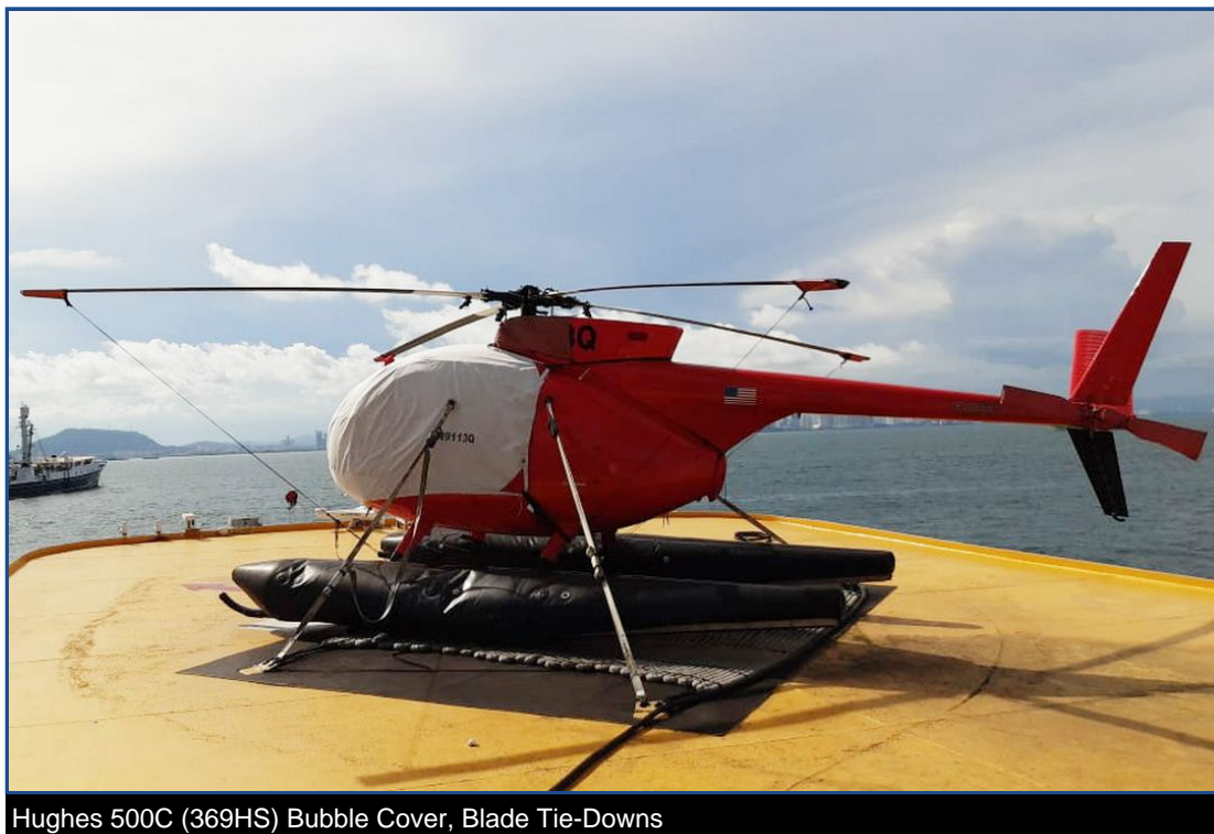
Hughes 500C (369HS) Bubble Cover, Blade Tie-Downs