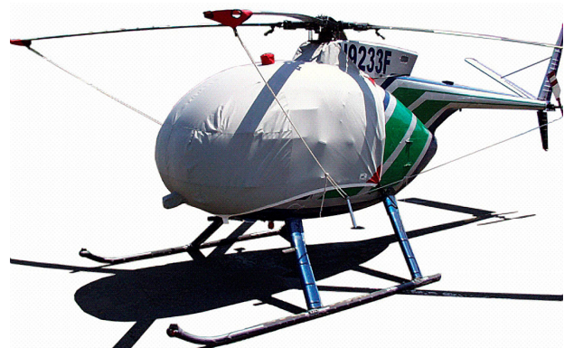
Hughes 500C Bubble Cover with Intake Add-on, Blade Tie-downs