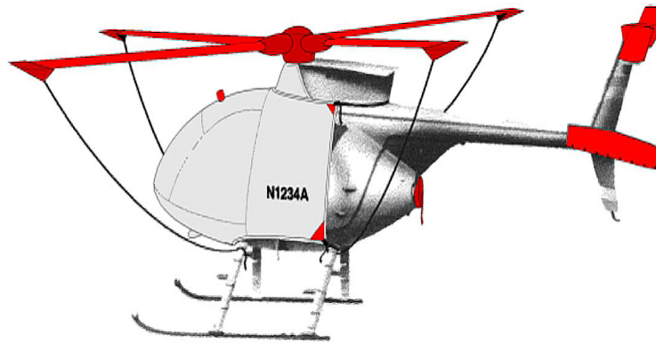
Full Cover Set

The Tailboom Cover details vary by model, but generally the helicopter tail boom cover encloses the tail boom from the "bottleneck" to the aft end. They usually also cover the horizontal stabilizers, and are custom made to allow for antennae, lights, and other protrusions. They attach with straps underneath the tail boom. Covers for the vertical and horizontal stabilizers are also available separately. Specific information for each model is available on request.