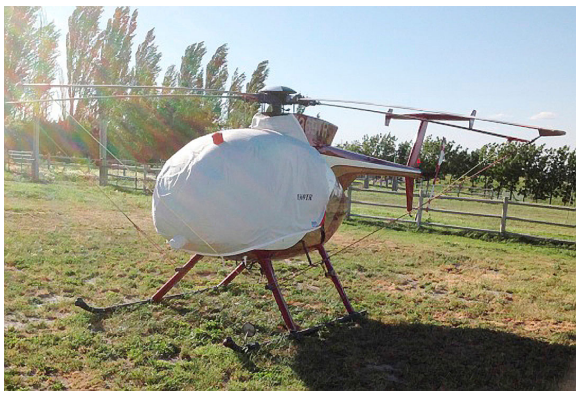
MD500D Bubble Cover with Intake Add-On