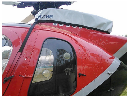
Customized Engine Cover