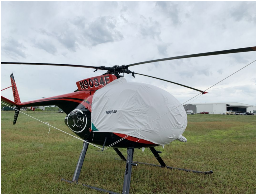
Hughes 500C Bubble Cover with Intake Add-On