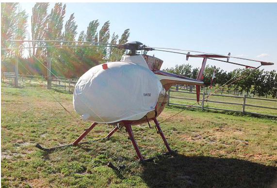
MD500D Bubble Cover with Intake Add-On

Travel Covers are made with Silver Solution-Dyed Polyester fabric and fully lined over the entire cover. The material is lightweight and more compact for easy storage in the aircraft. The polyester material is water resistant, but only intended for occasional use outside. We also have an ultra lightweight material available for fitted hangar dust covers. For daily outdoor use, the non-travel Sunbrella Cover is the best choice.