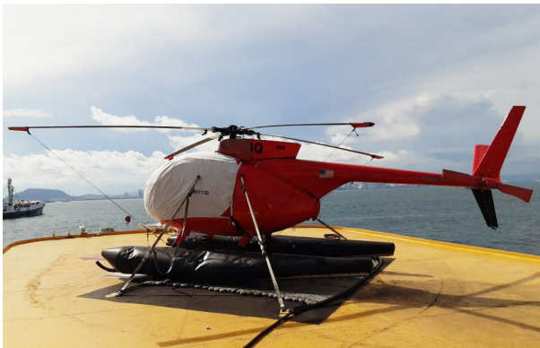
Hughes 500C (369HS) Bubble Cover, Blade Tie-Downs