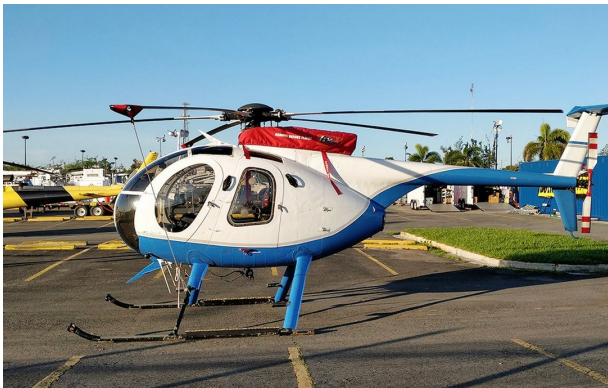
Hughes 500D Blade Tie-Downs, Doghouse Cover

WINTER USE MATERIAL - Made with Solution-Dyed Polyester fabric, this option is intended for seasonal use to aid in deicing, rain mitigation, or for occasional travel. The material is lighter and more compact, but more susceptible to UV damage and may have a shorter useful life if used continuously outside than the all-year use material.