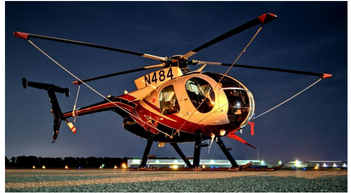
Hughes 500D Blade Tie-Downs