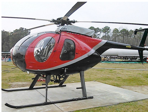
Customized Engine Cover

WINTER USE MATERIAL - Made with Solution-Dyed Polyester fabric, this option is intended for seasonal use to aid in deicing, rain mitigation, or for occasional travel. The material is lighter and more compact, but more susceptible to UV damage and may have a shorter useful life if used continuously outside than the all-year use material.