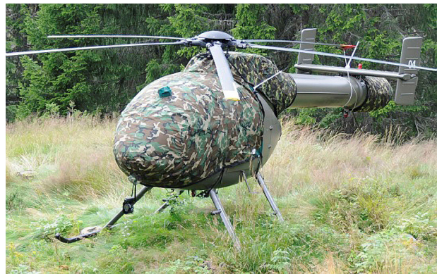
MD520 NOTAR Bubble, Engine, & NOTAR Covers & Blade Tie-downs