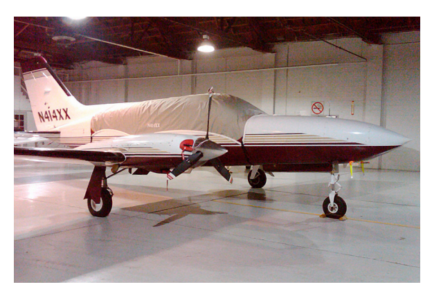
Cessna 414 Canopy Cover and Engine Inlet Plugs