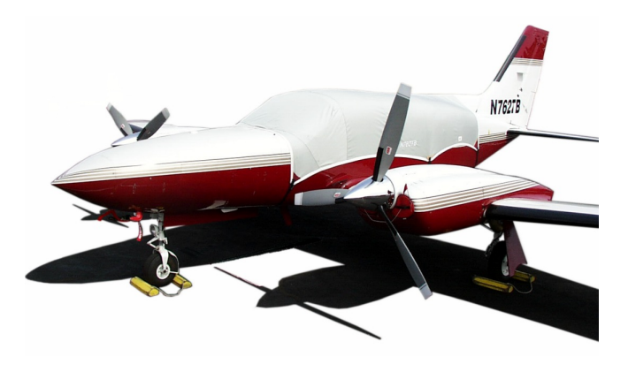
Cessna 421C Canopy Cover & Engine Plugs

Travel Covers are made with Silver Solution-Dyed Polyester fabric and only lined over the windshield to save weight. The material is lightweight and more compact for easy stowage in the aircraft. The polyester material is water resistant, but only intended for occasional use outside. We also have an ultra lightweight material available for fitted hangar dust covers. For daily outdoor use, the non-travel Sunbrella Cover is the best choice.