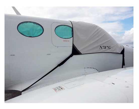
Cessna 340 Cockpit/Windshield Cover