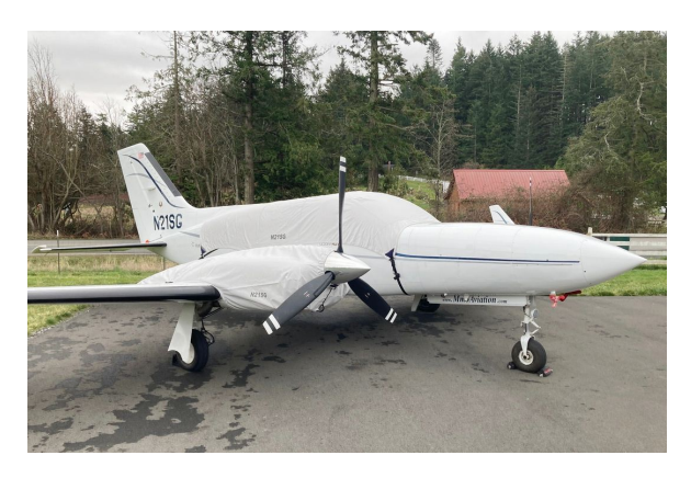
Cessna 421C Canopy & Engine Covers

Covers developed this material combination especially for aircraft protection. The outer material is medium weight and treated for water resistance, UV resistance and anti-static buildup. The inner lining is a very soft and smooth microfiber to prevent scratching. The material is very reflective, and tests show that the cabin interior temperature can be reduced to near-ambient temperature on the hottest of days. It is water, ice and snow repellent, yet breathable to allow moisture to escape from between the cover and the aircraft surface.