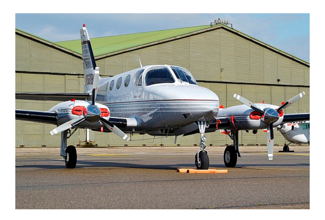
Cessna 340 Engine Plugs

Engine Inlet Plugs are custom fit for your Cessna 441, Conquest II intakes, made with heavy-duty vinyl material, and stuffed with a single block of sculpted urethane foam. Each plug has a zipper that allows the foam to be removed and dried if necessary. Engine plugs have warning flags that are visible from the cockpit or 'remove before flight' streamers sewn onto the face of the plugs. Most plugs are imprinted with the aircraft registration number in black for an extra charge. Storage bag NOT included. Engine plugs may be inserted after flight when the engine is still warm. Engine Inlet Plugs are commonly referred to as Cowl Plugs, Intake Plugs, Cowl Blocks, Engine Blocks, and Engine Bungs.