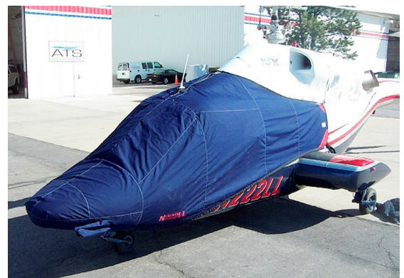
Bell 222 Bubble Cover