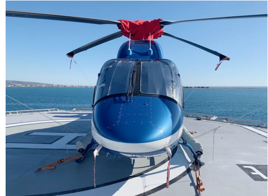
Bell 429 Windshield HeatShields, Rotor Mast Cover