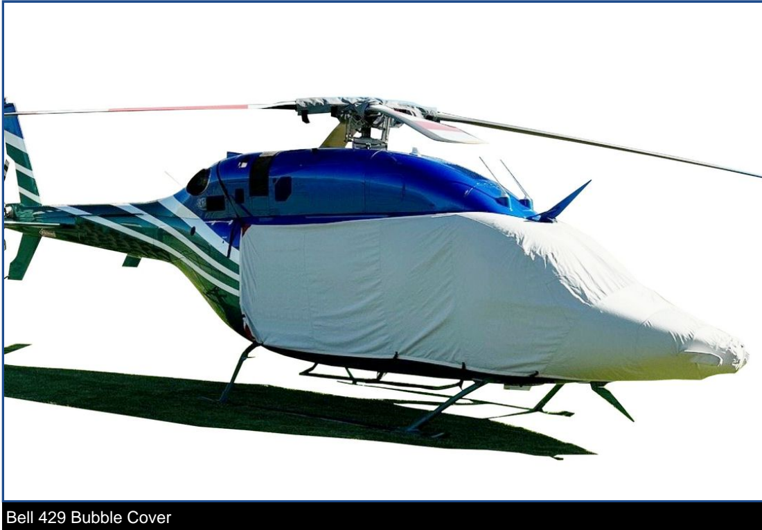
Bell 429 Bubble Cover