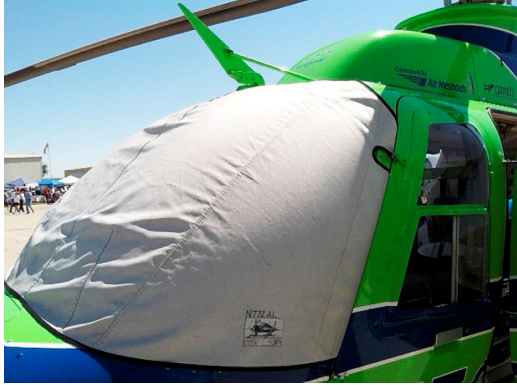
Bell 407 Windshield Cover

Travel Covers are made with Silver Solution-Dyed Polyester fabric and fully lined over the entire cover. The material is lightweight and more compact for easy stowage in the aircraft. The polyester material is water resistant, but only intended for occasional use outside. We also have an ultra lightweight material available for fitted hangar dust covers. For daily outdoor use, the non-travel Sunbrella Cover is the best choice.