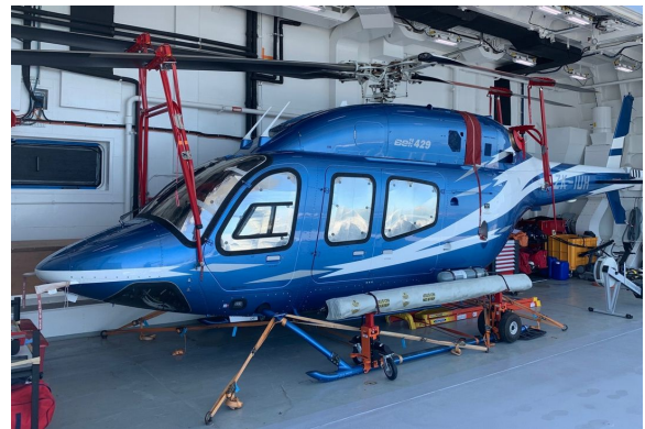
Bell 429 Cockpit & Cabin HeatShields