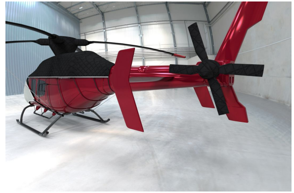
Bell 429 Tail Rotor, Engine, Rotor Hub Covers