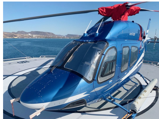
Bell 429 Cockpit & Cabin HeatShields, Rotor Mast/Drive Shafts Cover