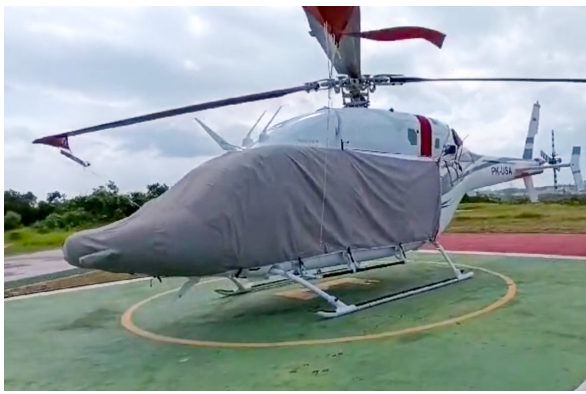
Bell 429 Bubble Cover