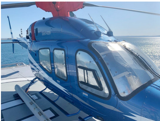
Bell 429 Cockpit & Cabin HeatShields

Cockpit Heatshields are interior sunshades for the aircraft's cockpit. The product is a unique composite of closed-cell foam with a silver mylar finish. The semi-rigid design is stiff enough to stand inside the window framing. Darts and folds are incorporated into the material so that it conforms to the complex shape of the helicopter windows. The set folds up flat and is easily stored in the included storage sleeve. Some designs may require velcro and suction cups. A Heatshield is an excellent short-term remedy for cockpit overheating, but an external fabric cover is more effective for long-term protection.