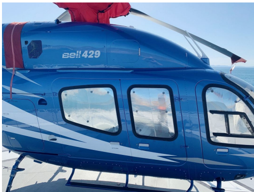
Bell 429 Cockpit & Cabin HeatShields

Cockpit Heatshields are interior sunshades for the aircraft's cockpit. The product is a unique composite of closed-cell foam with a silver mylar finish. The semi-rigid design is stiff enough to stand inside the window framing. Darts and folds are incorporated into the material so that it conforms to the complex shape of the helicopter windows. The set folds up flat and is easily stored in the included storage sleeve. Some designs may require velcro and suction cups. A Heatshield is an excellent short-term remedy for cockpit overheating, but an external fabric cover is more effective for long-term protection.