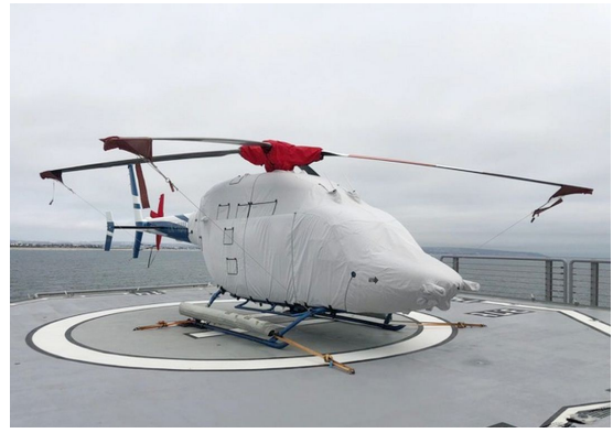
Bell 429 Main Body Cover, Rotor Hub & Tail Rotor Covers