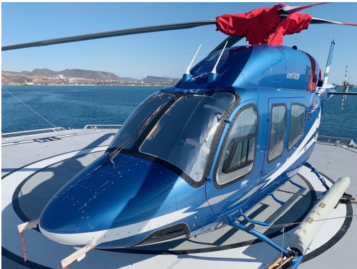
Bell 429 Main Body Cover, Rotor Hub & Tail Rotor Covers Bell 429 Cockpit & Cabin HeatShields, Rotor Mast/Drive Shafts Cover