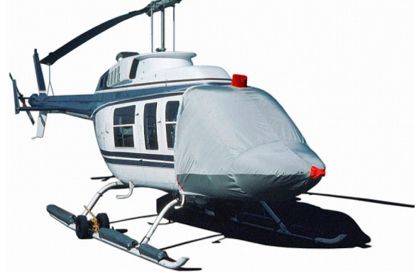
Cockpit Cover on Bell 206L