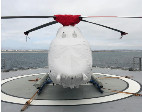
Bell 429 Main Body Cover, Rotor Hub & Tail Rotor Covers

WINTER USE MATERIAL - Made with Solution-Dyed Polyester fabric, this option is intended for seasonal use to aid in deicing, rain mitigation, or for occasional travel. The material is lighter and more compact, but more susceptible to UV damage and may have a shorter useful life if used continuously outside than the all-year use material.