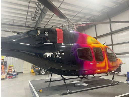
Bell 429 Inlet Barrier Filter Cover, Snap-On

WINTER USE MATERIAL - Made with Solution-Dyed Polyester fabric, this option is intended for seasonal use to aid in deicing, rain mitigation, or for occasional travel. The material is lighter and more compact, but more susceptible to UV damage and may have a shorter useful life if used continuously outside than the all-year use material.