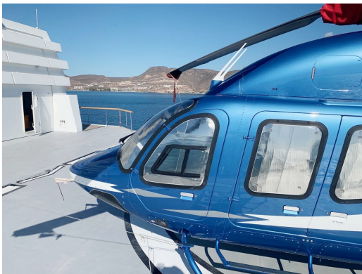
Bell 429 Cockpit & Cabin HeatShields

Cockpit Heatshields are interior sunshades for the aircraft's cockpit. The product is a unique composite of closed-cell foam with a silver mylar finish. The semi-rigid design is stiff enough to stand inside the window framing. Darts and folds are incorporated into the material so that it conforms to the complex shape of the helicopter windows. The set folds up flat and is easily stored in the included storage sleeve. Some designs may require velcro and suction cups. A Heatshield is an excellent short-term remedy for cockpit overheating, but an external fabric cover is more effective for long-term protection.