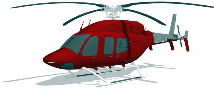
Bell 429 Insulated Tailboom Cover