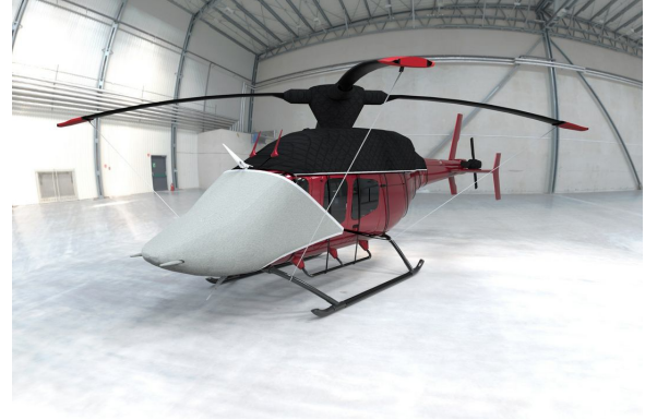
Bell 429 Cockpit/Nose Cover, Engine Cover, etc.