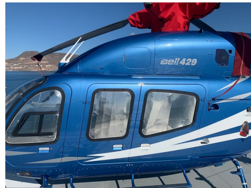
Bell 429 Cockpit & Cabin HeatShields, Rotor Mast/Drive Shafts Cover