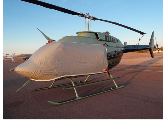
Bell 206L Longranger Bubble Cover