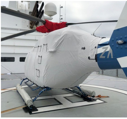
Bell 429 Main Body Cover, Rotor Hub & Tail Rotor Covers