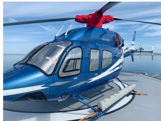
Bell 429 Rotor Hub Cover, Cockpit & Cabin HeatShields