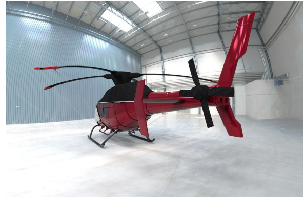
Bell 429 Tail Rotor, Engine, Rotor Hub Covers