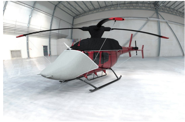
Bell 429 Cockpit/Nose Cover, Engine Cover, etc.