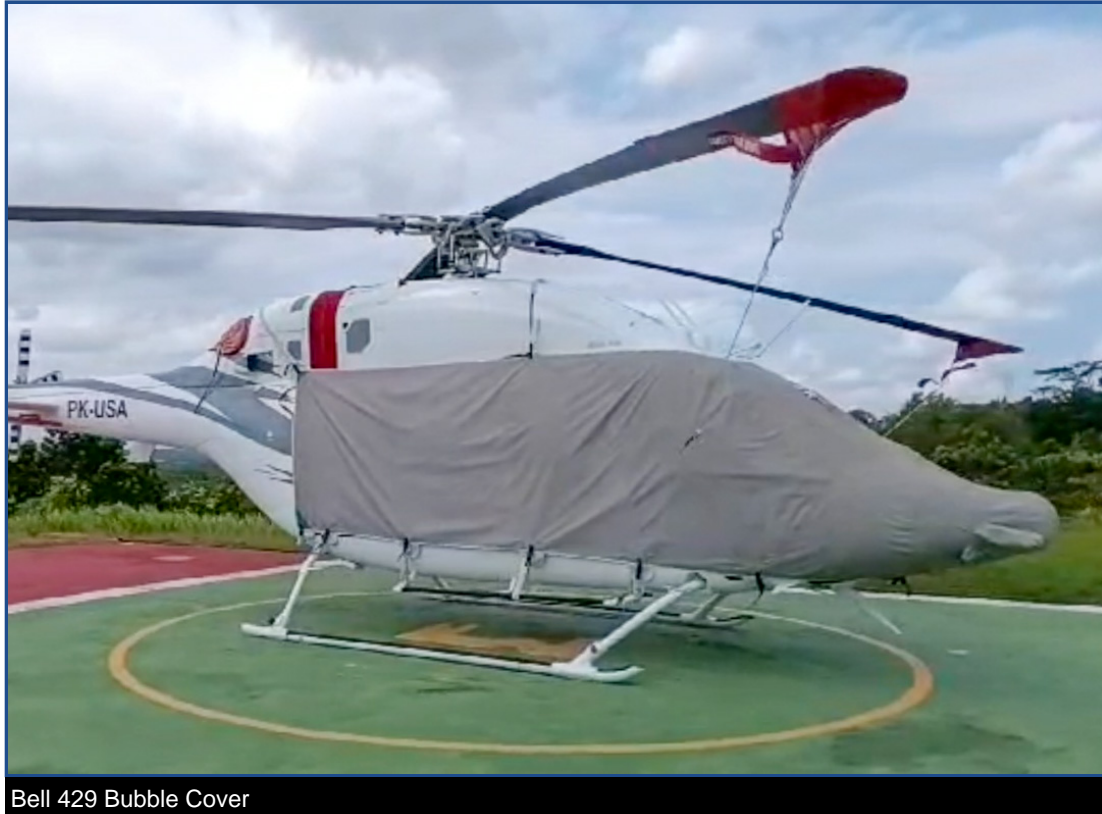
Bell 429 Bubble Cover