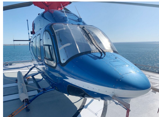
Bell 429 Cockpit HeatShields