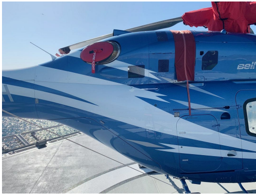
Bell 429 Exhaust Plug, Rotor Mast Cover

The Engine Exhaust Plugs are custom fit for your Bell 429 exhaust openings, made with heavy-duty vinyl material, and stuffed with a single block of sculpted urethane foam. Exhaust plugs have 'Remove Before Flight' streamers sewn onto the face of the plugs. Exhaust plugs may be inserted soon after flight when the engine is still warm. Engine Inlet Plugs are commonly referred to as Cowl Plugs, Intake Plugs, Cowl Blocks, Engine Blocks, and Engine Bungs.