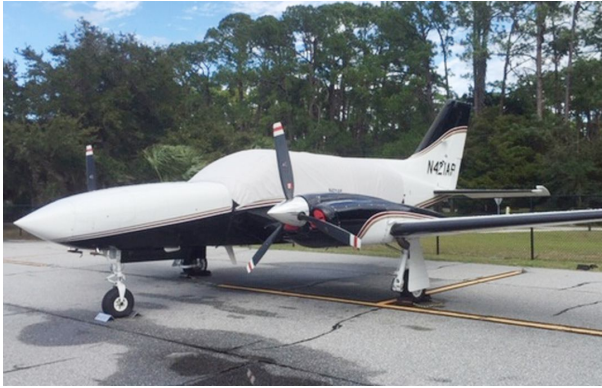
Cessna 421 Canopy Cover, Engine Plugs

Covers developed this material combination especially for aircraft protection. The outer material is medium weight and treated for water resistance, UV resistance and anti-static buildup. The inner lining is a very soft and smooth microfiber to prevent scratching. The material is very reflective, and tests show that the cabin interior temperature can be reduced to near-ambient temperature on the hottest of days. It is water, ice and snow repellent, yet breathable to allow moisture to escape from between the cover and the aircraft surface.