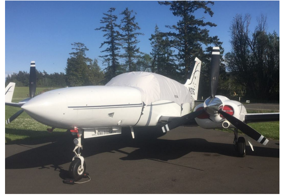
Cessna 421C Canopy Cover