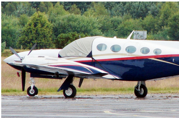
Cessna 421 Cockpit Cover

Covers developed this material combination especially for aircraft protection. The outer material is medium weight and treated for water resistance, UV resistance and anti-static buildup. The inner lining is a very soft and smooth microfiber to prevent scratching. The material is very reflective, and tests show that the cabin interior temperature can be reduced to near-ambient temperature on the hottest of days. It is water, ice and snow repellent, yet breathable to allow moisture to escape from between the cover and the aircraft surface.