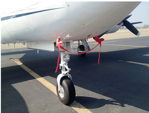
Cessna 421 Pitot Covers set

single block of sculpted urethane foam. Each plug has a zipper that allows the foam to be removed and dried if necessary. Engine plugs have warning flags that are visible from the cockpit or 'remove before flight' streamers sewn onto the face of the plugs. Most plugs are imprinted with the aircraft registration number in black for an extra charge. Storage bag NOT included. Engine plugs may be inserted after flight when the engine is still warm. Engine Inlet Plugs are commonly referred to as Cowl Plugs, Intake Plugs, Cowl Blocks, Engine Blocks, and Engine Bungs.