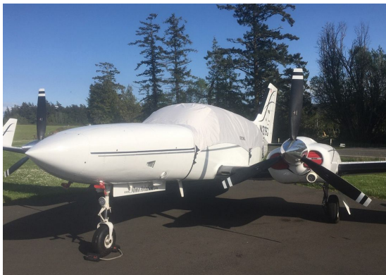
Cessna 421C Canopy Cover