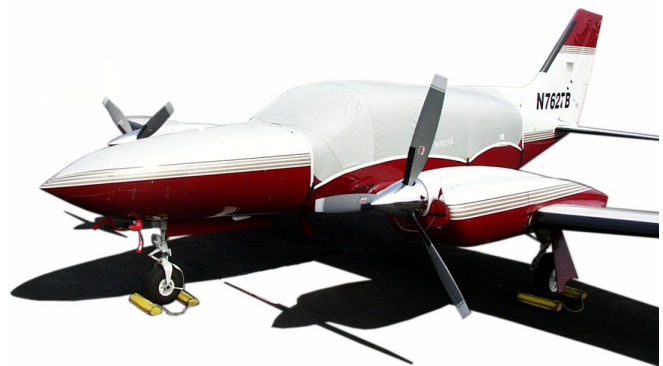
Cessna 421C Canopy Cover & Engine Plugs