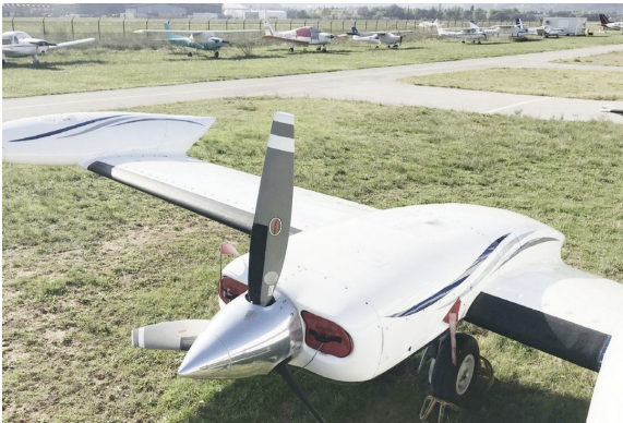
Cessna 340 Engine Inlet Plugs