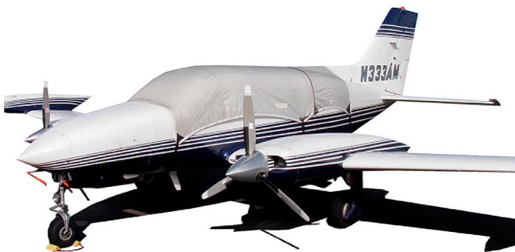
Cessna 414 Canopy Cover & Pitot Covers