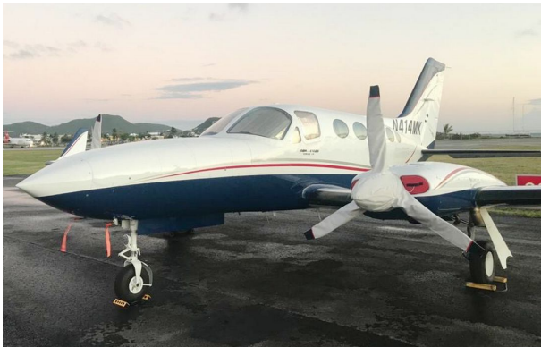
Cessna 414 Propellor/Spinner Covers, 3 Blade

Engine Inlet Plugs are custom fit for your Cessna 414, 414A intakes, made with heavy-duty vinyl material, and stuffed with a single block of sculpted urethane foam. Each plug has a zipper that allows the foam to be removed and dried if necessary. Engine plugs have warning flags that are visible from the cockpit or 'remove before flight' streamers sewn onto the face of the plugs. Most plugs are imprinted with the aircraft registration number in black for an extra charge. Storage bag NOT included. Engine plugs may be inserted after flight when the engine is still warm. Engine Inlet Plugs are commonly referred to as Cowl Plugs, Intake Plugs, Cowl Blocks, Engine Blocks, and Engine Bungs.