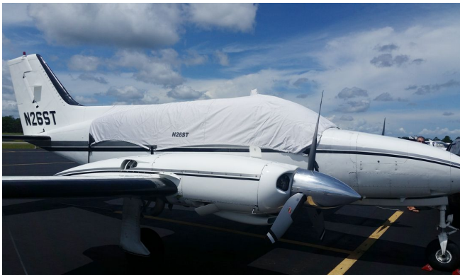
Cessna 414 Canopy Cover

This cover type is made from Silver Acrylic Sunbrella canvas and is 100% lined with a soft and smooth microfiber. Bruce's Custom Covers developed this material combination especially for aircraft protection. The outer material is medium weight and treated for water resistance, UV resistance and anti-static buildup. The inner lining is a very soft and smooth microfiber to prevent scratching. The material is very reflective, and tests show that the cabin interior temperature can be reduced to near-ambient temperature on the hottest of days. It is water, ice and snow repellent, yet breathable to allow moisture to escape from between the cover and the aircraft surface.