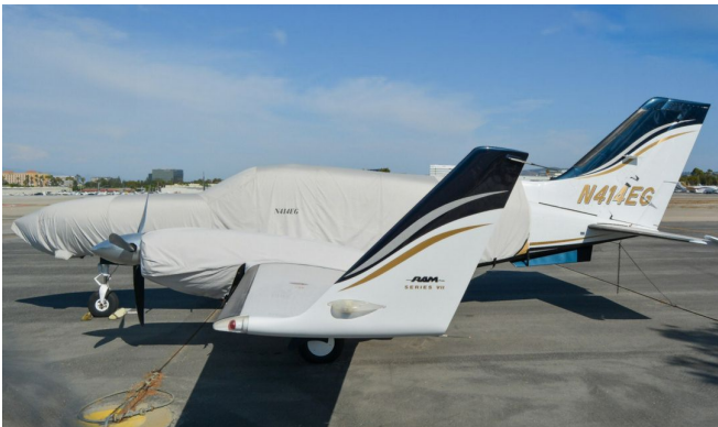
Cessna 414A Extended Canopy/Nose Cover & Engine Covers