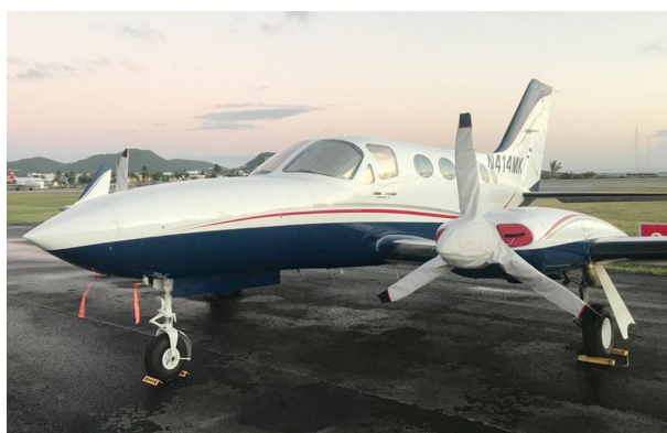
Cessna 414 Propellor/Spinner Covers, 3 Blade

Heatshields are interior sunshades for an aircraft's windows or canopy glass. The product is a unique composite of closed-cell foam with a silver mylar finish. The semi-rigid design is stiff enough to stand along the inside of the windshield using sun visors or window framing. It folds up flat and easily stores in the included storage sleeve. Some designs may require velcro and suction cups. A Heatshield is an excellent short-term remedy for cockpit overheating.