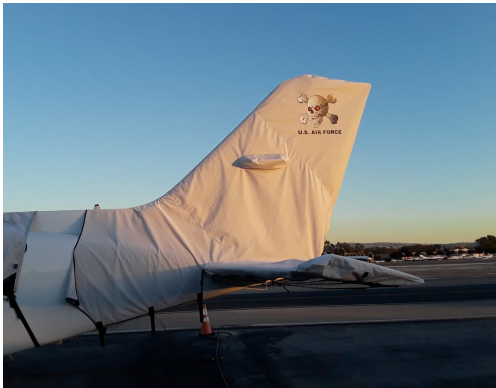
Cessna 421 Empennage Cover