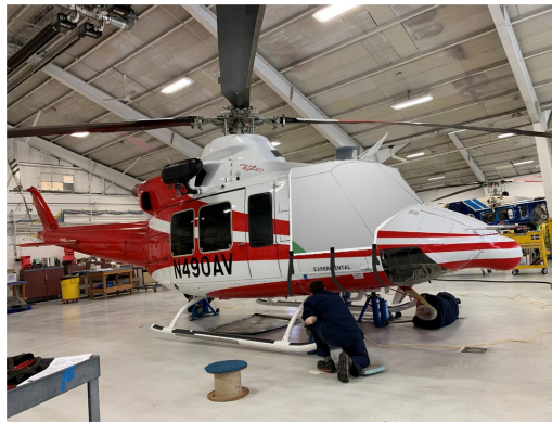
Bell 412 Cockpit/Canopy Cover, photo/illustration

Travel Covers are made with Silver Solution-Dyed Polyester fabric and fully lined over the entire cover. The material is lightweight and more compact for easy stowage in the aircraft. The polyester material is water resistant, but only intended for occasional use outside. We also have an ultra lightweight material available for fitted hangar dust covers. For daily outdoor use, the non-travel Sunbrella Cover is the best choice.