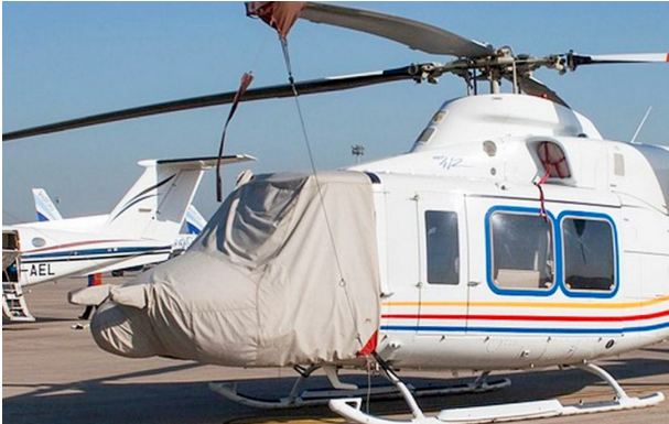
Bell 412 Cockpit/Canopy/Nose Cover, w/Radome