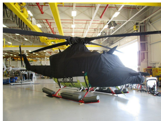
Bell 412 Cockpit/Canopy/Nose, Insulated Engine Area, Rotor Hub, Blade, Tailboom and Tail Rotor Covers