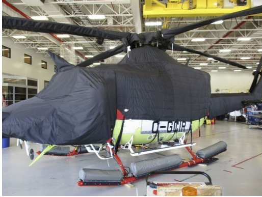
Bell 412 Cockpit/Canopy/Nose, Insulated Engine Area, Rotor Hub, Blade, Tailboom and Tail Rotor Covers

Canopy/Nose Covers enclose the entire canopy including the windshield, skylights, and chin bubble. Attachment buckles are made of nonmetal Delrin , designed for rugged outdoor use. Both the top and bottom hems of the cover have a special rope-hem feature with which they can be tightened to help prevent abrasive chafing of the windshield. Pockets are sewn into the cover for the temperature probe and pitot tubes. The bubble cover is reinforced with patches at hinge points, door handles, and for the windshield wipers. For ease of installation, the bubble cover is color-coded (red=left, green=right) with color swatches sewn into the corners. This cover type is made from Silver Acrylic Sunbrella canvas and is 100% lined with a soft and smooth microfiber. Bruce's Custom Covers developed this material combination especially for aircraft protection. The outer material is medium weight and treated for water resistance, UV resistance and anti-static buildup. The inner lining is a very soft and smooth microfiber to prevent scratching. The material is very reflective, and tests show that the cabin interior temperature can be reduced to near-ambient temperature on the hottest of days. It is water, ice and snow repellent, yet breathable to allow moisture to escape from between the cover and the aircraft surface.