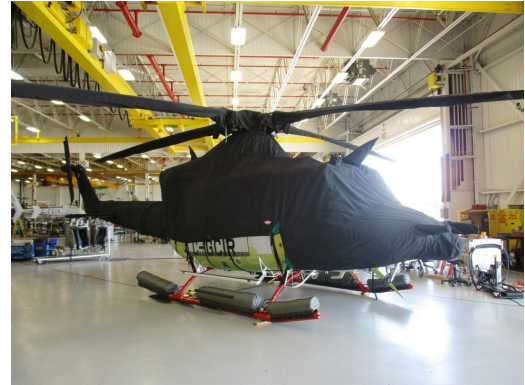
Bell 412 Cockpit/Canopy/Nose, Insulated Engine Area, Rotor Hub, Blade, Tailboom and Tail Rotor Covers