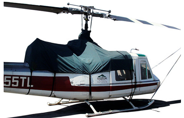
Bell 204/205 Engine/Mid-Cabin Cover