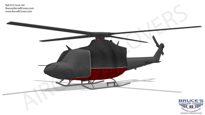
Bell 412 Forward Cabin/Nose, Insulated Engine, Tailboom, Rotor Hub & Blade Covers

The Tailboom Cover details vary by model, but generally the helicopter tail boom cover encloses the tail boom from the "bottleneck" to the aft end. They usually also cover the horizontal stabilizers, and are custom made to allow for antennae, lights, and other protrusions. They attach with straps underneath the tail boom. Covers for the vertical and horizontal stabilizers are also available separately. Specific information for each model is available on request.