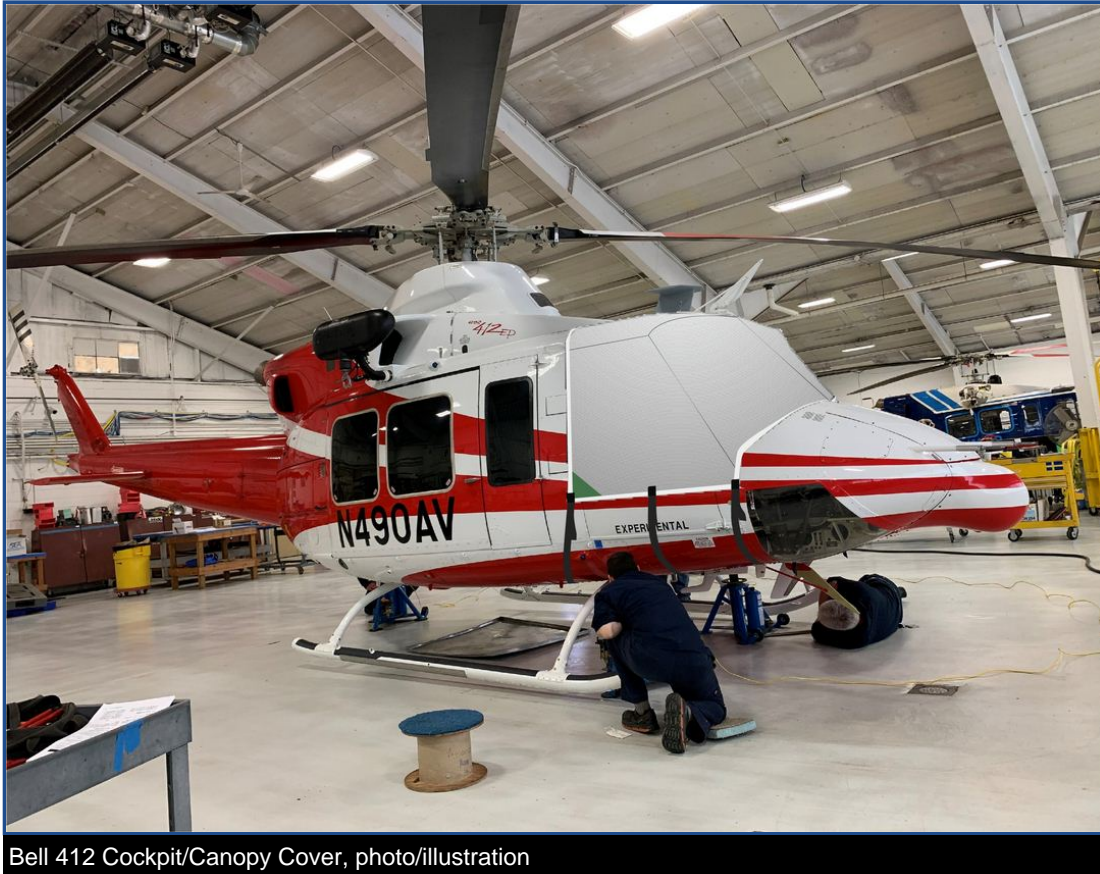
Bell 412 Cockpit/Canopy Cover, photo/illustration