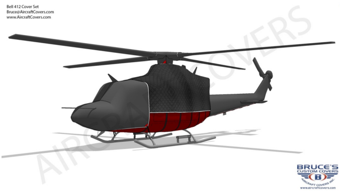
Bell 412 Forward Cabin/Nose, Insulated Engine, Tailboom, Rotor Hub & Blade Covers