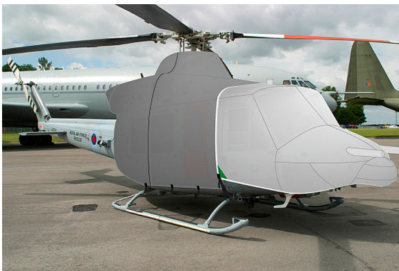
Forward Cabin Nose & Mid-Cabin/Engine Cover (extended to cross tubes)

WINTER USE MATERIAL - Made with Solution-Dyed Polyester fabric, this option is intended for seasonal use to aid in deicing, rain mitigation, or for occasional travel. The material is lighter and more compact, but more susceptible to UV damage and may have a shorter useful life if used continuously outside than the all-year use material.