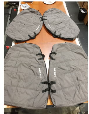
MD 500D Padded Door Bags