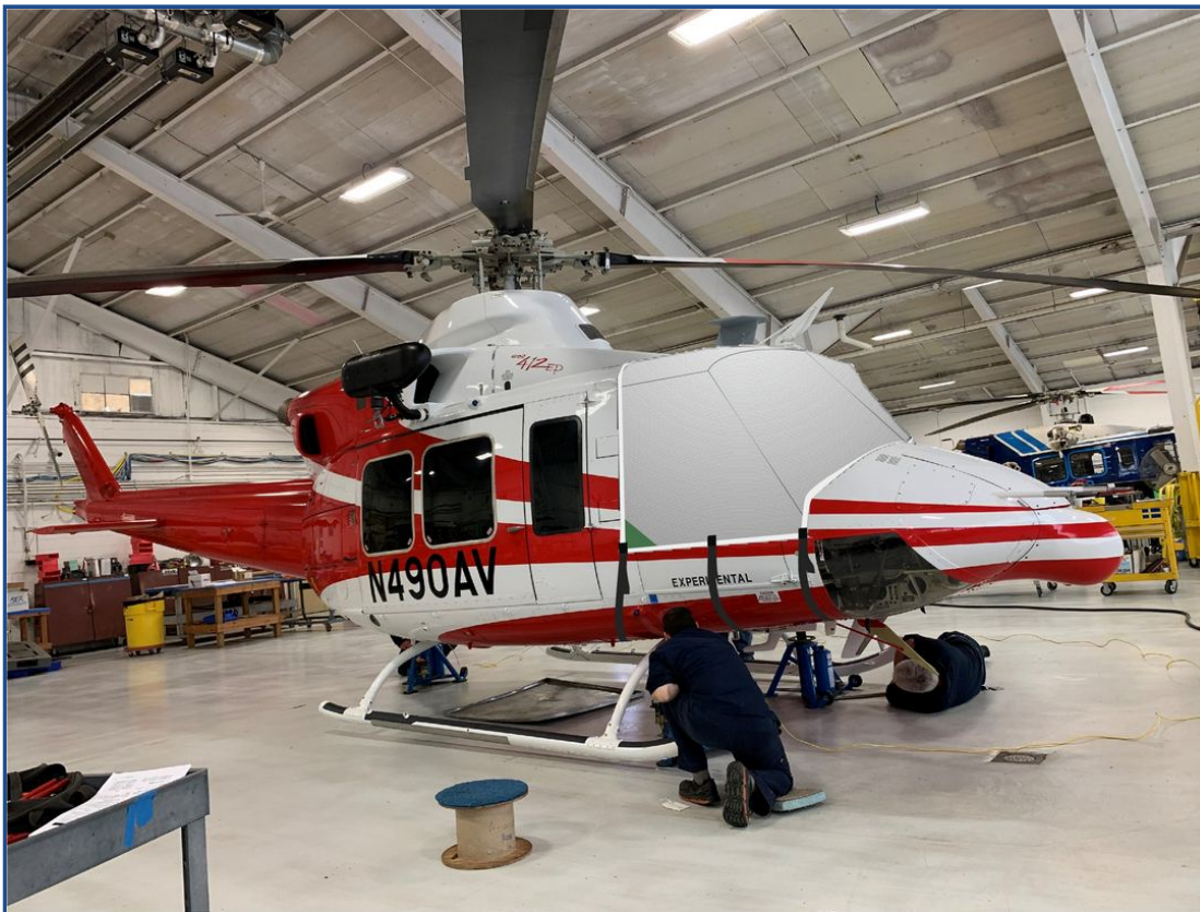
Bell 412 Cockpit/Canopy Cover, photo/illustration