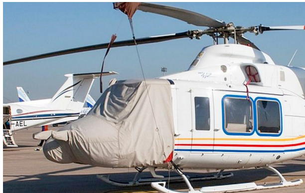
Bell 412 Cockpit/Canopy/Nose Cover, w/Radome

Canopy/Nose Covers enclose the entire canopy including the windshield, skylights, and chin bubble. Attachment buckles are made of nonmetal Delrin , designed for rugged outdoor use. Both the top and bottom hems of the cover have a special rope-hem feature with which they can be tightened to help prevent abrasive chafing of the windshield. Pockets are sewn into the cover for the temperature probe and pitot tubes. The bubble cover is reinforced with patches at hinge points, door handles, and for the windshield wipers. For ease of installation, the bubble cover is color-coded (red=left, green=right) with color swatches sewn into the corners. This cover type is made from Silver Acrylic Sunbrella canvas and is 100% lined with a soft and smooth microfiber. Bruce's Custom Covers developed this material combination especially for aircraft protection. The outer material is medium weight and treated for water resistance, UV resistance and anti-static buildup. The inner lining is a very soft and smooth microfiber to prevent scratching. The material is very reflective, and tests show that the cabin interior temperature can be reduced to near-ambient temperature on the hottest of days. It is water, ice and snow repellent, yet breathable to allow moisture to escape from between the cover and the aircraft surface.