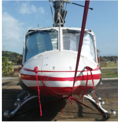
Bell 212 Windshield HeatShields