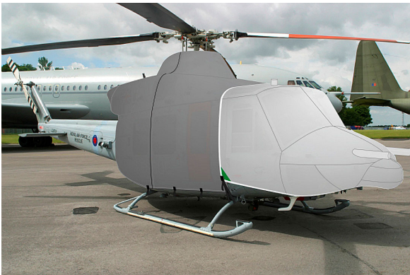
Forward Cabin Nose & Mid-Cabin/Engine Cover (extended to cross tubes)

WINTER USE MATERIAL - Made with Solution-Dyed Polyester fabric, this option is intended for seasonal use to aid in deicing, rain mitigation, or for occasional travel. The material is lighter and more compact, but more susceptible to UV damage and may have a shorter useful life if used continuously outside than the all-year use material.