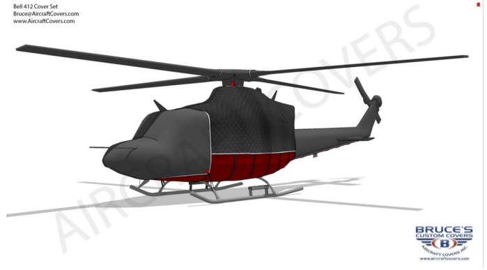
Bell 412 Forward Cabin/Nose, Insulated Engine, Tailboom, Rotor Hub & Blade Covers