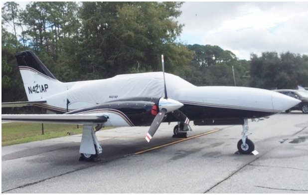
Cessna 421 Canopy Cover, Engine Plugs