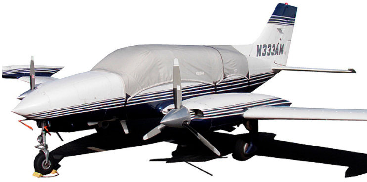
Cessna 414 Canopy Cover & Pitot Covers