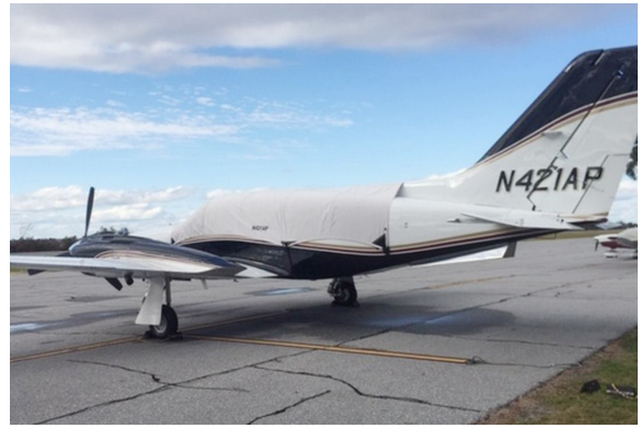
Cessna 421 Canopy Cover