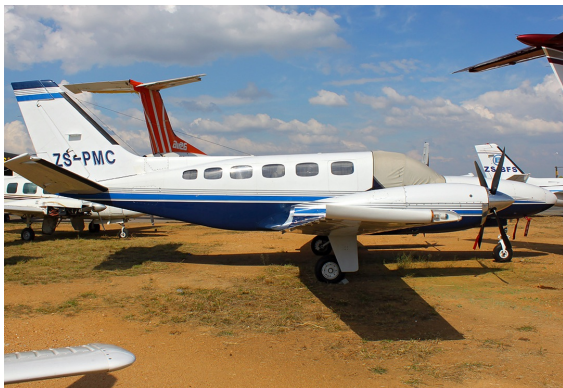
Cessna 441 Conquest II Cockpit Cover

This cover type is made from Silver Acrylic Sunbrella canvas and is 100% lined with a soft and smooth microfiber. Bruce's Custom Covers developed this material combination especially for aircraft protection. The outer material is medium weight and treated for water resistance, UV resistance and anti-static buildup. The inner lining is a very soft and smooth microfiber to prevent scratching. The material is very reflective, and tests show that the cabin interior temperature can be reduced to near-ambient temperature on the hottest of days. It is water, ice and snow repellent, yet breathable to allow moisture to escape from between the cover and the aircraft surface.