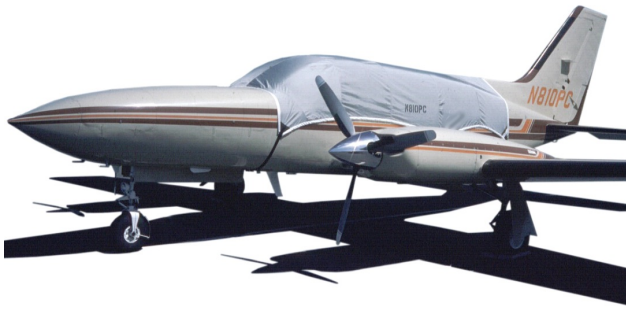
Cessna 421 Cockpit/Windshield Cover

non-travel Sunbrella Cover is the best choice.