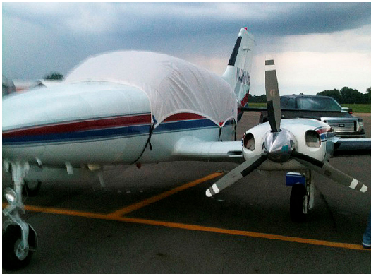
Cessna 401B Canopy Cover

non-travel Sunbrella Cover is the best choice.