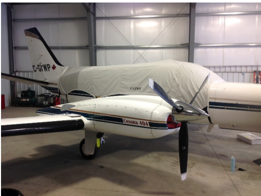
Cessna 404 Canopy Cover, Engine Plugs

This cover type is made from Silver Acrylic Sunbrella canvas and is 100% lined with a soft and smooth microfiber. Bruce's Custom Covers developed this material combination especially for aircraft protection. The outer material is medium weight and treated for water resistance, UV resistance and anti-static buildup. The inner lining is a very soft and smooth microfiber to prevent scratching. The material is very reflective, and tests show that the cabin interior temperature can be reduced to near-ambient temperature on the hottest of days. It is water, ice and snow repellent, yet breathable to allow moisture to escape from between the cover and the aircraft surface.