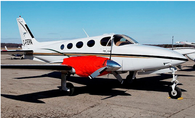
Cessna 340 Insulated Engine Covers

This cover type is made from Silver Acrylic Sunbrella canvas and is 100% lined with a soft and smooth microfiber. Bruce's Custom Covers developed this material combination especially for aircraft protection. The outer material is medium weight and treated for water resistance, UV resistance and anti-static buildup. The inner lining is a very soft and smooth microfiber to prevent scratching. The material is very reflective, and tests show that the cabin interior temperature can be reduced to near-ambient temperature on the hottest of days. It is water, ice and snow repellent, yet breathable to allow moisture to escape from between the cover and the aircraft surface.