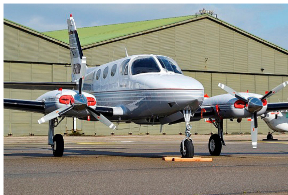
Cessna 340 Engine Plugs