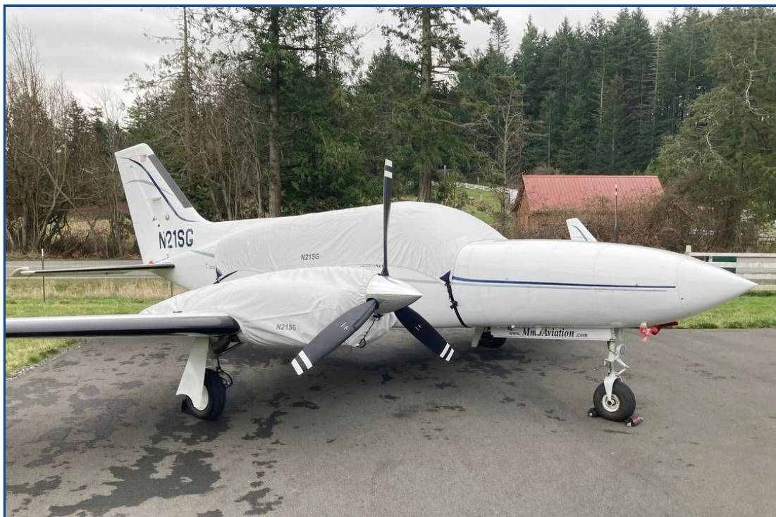
Cessna 421C Canopy &amp; Engine Covers