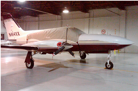
Cessna 414 Canopy Cover and Engine Inlet Plugs