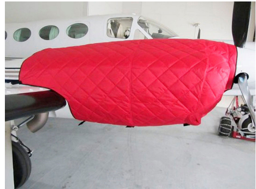
Cessna 421 Insulated Engine Covers