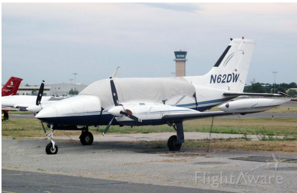
Cessna 421 Canopy Cover