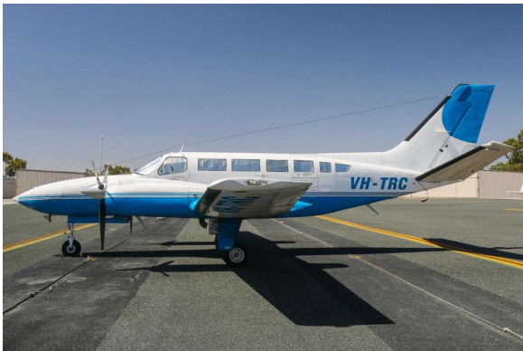
Cessna 404 & F406 HeatShields

window framing. It folds up flat and easily stores in the included storage sleeve. Some designs may require velcro and suction cups. A Heatshield is an excellent short-term remedy for cockpit overheating.