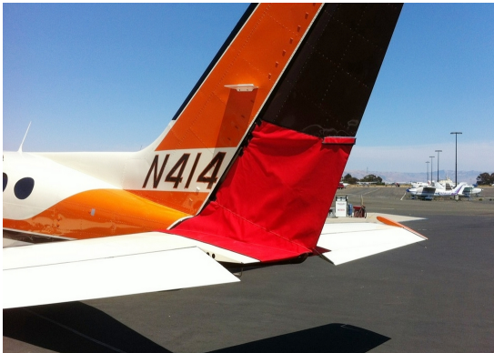
Cessna 414 Rudder Openings Cover (bird barrier)

WINTER USE MATERIAL - Made with Solution-Dyed Polyester fabric, this option is intended for seasonal use to aid in deicing, rain mitigation, or for occasional travel. The material is lighter and more compact, but more susceptible to UV damage and may have a shorter useful life if used continuously outside than the all-year use material.