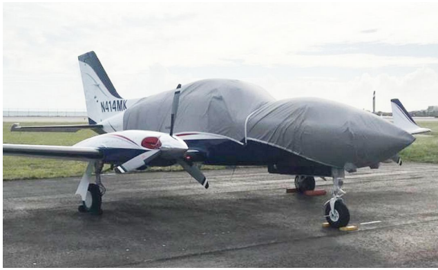
Cessna 414 Travel Cover, Light Weight Canopy Cover