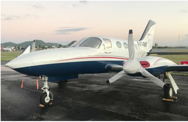
Cessna 414 Propellor/Spinner Covers, 3 Blade

window framing. It folds up flat and easily stores in the included storage sleeve. Some designs may require velcro and suction cups. A Heatshield is an excellent short-term remedy for cockpit overheating.