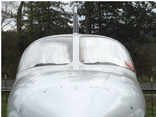
Cessna 421 Windshield HeatShields