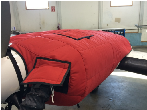
Cessna 402 Insulated Engine Cover with Heater