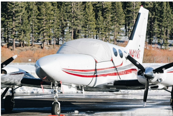
Cessna 414 Cockpit Cover

This cover type is made from Silver Acrylic Sunbrella canvas and is 100% lined with a soft and smooth microfiber. Bruce's Custom Covers developed this material combination especially for aircraft protection. The outer material is medium weight and treated for water resistance, UV resistance and anti-static buildup. The inner lining is a very soft and smooth microfiber to prevent scratching. The material is very reflective, and tests show that the cabin interior temperature can be reduced to near-ambient temperature on the hottest of days. It is water, ice and snow repellent, yet breathable to allow moisture to escape from between the cover and the aircraft surface.