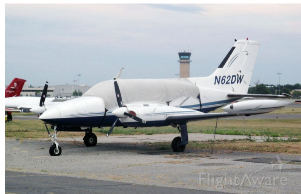
Cessna 421 Canopy Cover