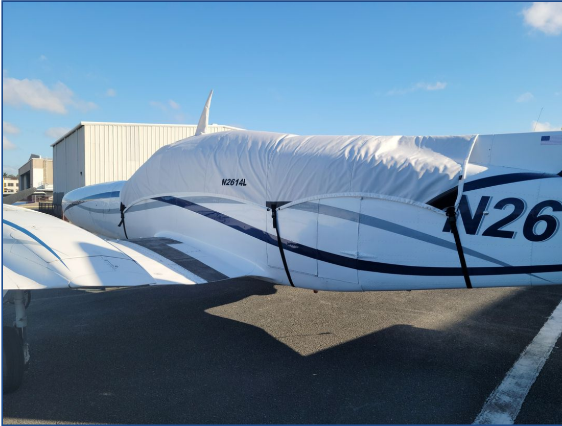
Cessna 402C Canopy Cover