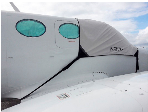
Cessna 340 Cockpit/Windshield Cover

The Cessna 402 Nose Cover is designed to cover the section of the fuselage forward of the windshield to the tip of the nose. It is secured with belly straps. This cover type is made from Silver Acrylic Sunbrella canvas and is 100% lined with a soft and smooth microfiber. Bruce's Custom Covers developed this material combination especially for aircraft protection. The outer material is medium weight and treated for water resistance, UV resistance and anti-static buildup. The inner lining is a very soft and smooth microfiber to prevent scratching. The material is very reflective, and tests show that the cabin interior temperature can be reduced to near-ambient temperature on the hottest of days. It is water, ice and snow repellent, yet breathable to allow moisture to escape from between the cover and the aircraft surface.