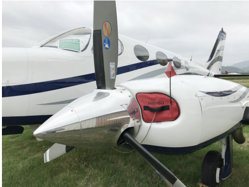
Cessna 340 Engine Inlet Plugs

Engine Inlet Plugs are custom fit for your Cessna 402 intakes, made with heavy-duty vinyl material, and stuffed with a single block of sculpted urethane foam. Each plug has a zipper that allows the foam to be removed and dried if necessary. Engine plugs have warning flags that are visible from the cockpit or 'remove before flight' streamers sewn onto the face of the plugs. Most plugs are imprinted with the aircraft registration number in black for an extra charge. Storage bag NOT included. Engine plugs may be inserted after flight when the engine is still warm. Engine Inlet Plugs are commonly referred to as Cowl Plugs, Intake Plugs, Cowl Blocks, Engine Blocks, and Engine Bungs.