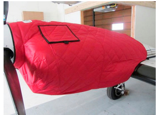
Cessna 421 Insulated Engine Covers