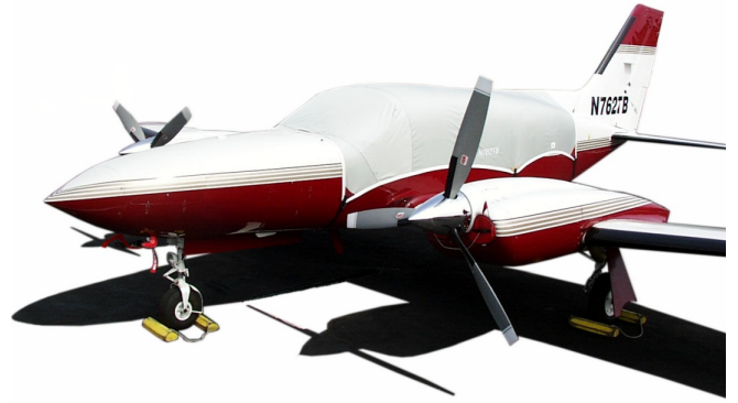
Cessna 421C Canopy Cover & Engine Plugs