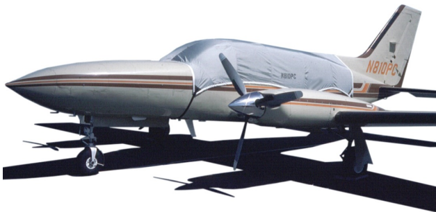
Cessna 421 Cockpit/Windshield Cover