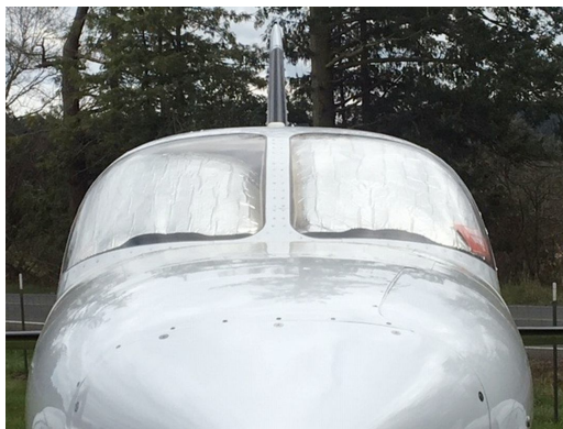
Cessna 421 Windshield HeatShields