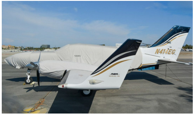
Cessna 414A Extended Canopy/Nose Cover & Engine Covers