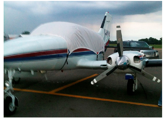
Cessna 401B Canopy Cover