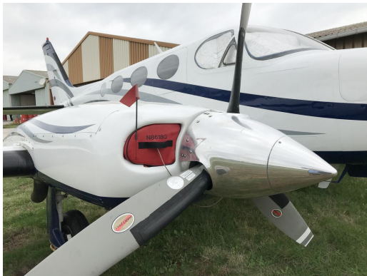
Cessna 340 Engine Inlet Plugs

Engine Inlet Plugs are custom fit for your Cessna 401 intakes, made with heavy-duty vinyl material, and stuffed with a single block of sculpted urethane foam. Each plug has a zipper that allows the foam to be removed and dried if necessary. Engine plugs have warning flags that are visible from the cockpit or 'remove before flight' streamers sewn onto the face of the plugs. Most plugs are imprinted with the aircraft registration number in black for an extra charge. Engine plugs may be inserted after flight when the engine is still warm. Engine Inlet Plugs are commonly referred to as Cowl Plugs, Intake Plugs, Cowl Blocks, Engine Blocks, and Engine Bungs.