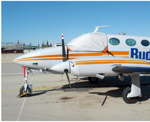
Cessna 340 Cockpit/Windshield Cover