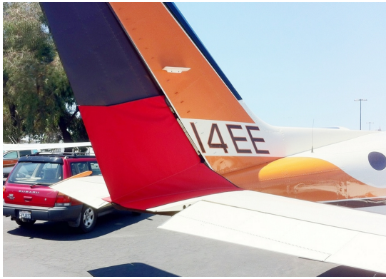
Cessna 414 Rudder Openings Cover (bird barrier)