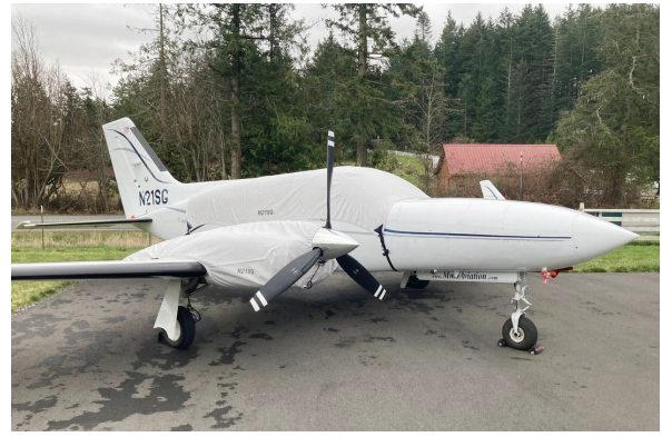
Cessna 421C Canopy & Engine Covers