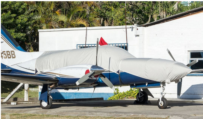
Cessna 421 Canopy Cover & Nose Cover

Travel Covers are made with Silver Solution-Dyed Polyester fabric and only lined over the windshield to save weight. The material is lightweight and more compact for easy stowage in the aircraft. The polyester material is water resistant, but only intended for occasional use outside. We also have an ultra lightweight material available for fitted hangar dust covers. For daily outdoor use, the non-travel Sunbrella Cover is the best choice.