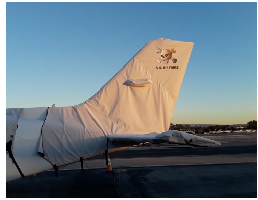
Cessna 421 Empennage Cover