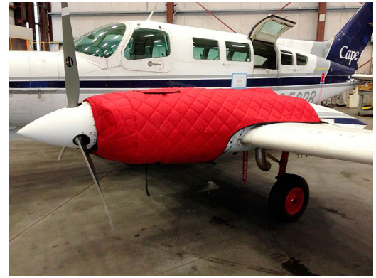
Cessna 402 Insulated Engine Cover