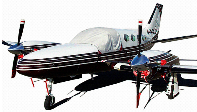
Cessna 425 Cockpit Cover

Travel Covers are made with Silver Solution-Dyed Polyester fabric and only lined over the windshield to save weight. The material is lightweight and more compact for easy stowage in the aircraft. The polyester material is water resistant, but only intended for occasional use outside. We also have an ultra lightweight material available for fitted hangar dust covers. For daily outdoor use, the non-travel Sunbrella Cover is the best choice.