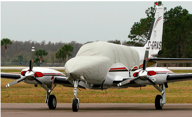
Cessna 340 Canopy/Nose Cover & Engine Inlet Plugs

Travel Covers are made with Silver Solution-Dyed Polyester fabric and only lined over the windshield to save weight. The material is lightweight and more compact for easy stowage in the aircraft. The polyester material is water resistant, but only intended for occasional use outside. We also have an ultra lightweight material available for fitted hangar dust covers. For daily outdoor use, the non-travel Sunbrella Cover is the best choice.