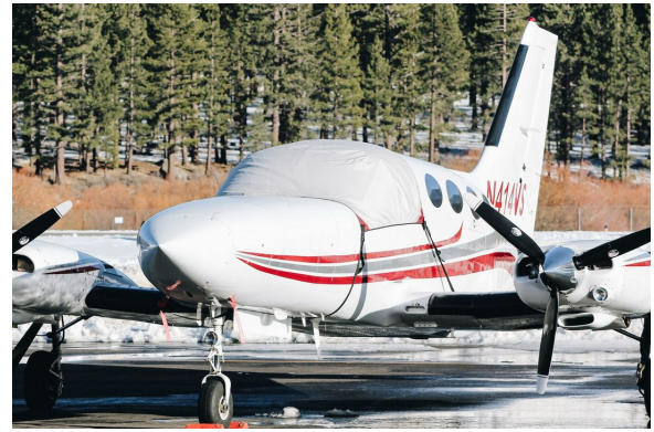
Cessna 414 Cockpit Cover