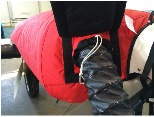
Cessna 402 Insulated Engine Cover with Heater