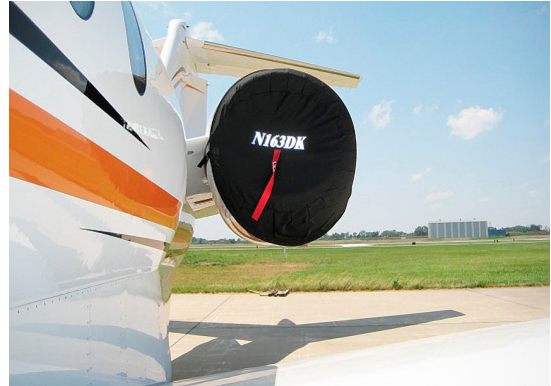
Hawker 4000 Intake Cover