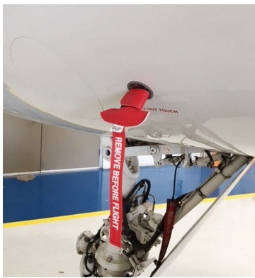
Grumman Gulfstream G-V Rosemont/TAT Cover