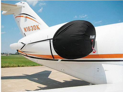
Hawker 4000 Intake Cover

The Hawker Beechcraft 4000 Horizon Intake Covers are designed to install easily yet be completely storable. A spring steel hoop is sewn into the hem of each cover, allowing them to be installed without climbing onto the wing or using a stepladder. To store the covers the spring steel hoop folds like a band-saw blade into three nesting rings. Each cover folds into a compact circular bundle which is stored in the included duffle bag, yet they unfold quickly for use. The Tri-Fold Ring cover is made of medium weight nylon which is available in a variety of colors to match the paint trim. Each cover set comes complete with installation and folding instructions. The aircraft's registration number can be silkscreened onto the cover for an extra charge.