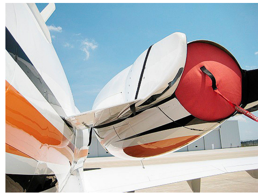
Hawker 4000 Exhaust Plug