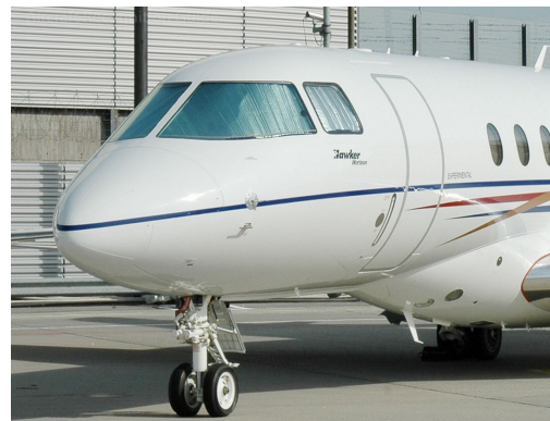
Hawker Beechcraft 4000 Horizon Cockpit Heatshields