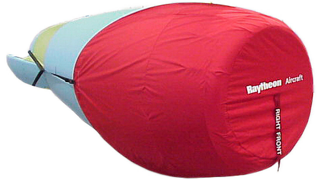
Hawker 4000 Intake Cover