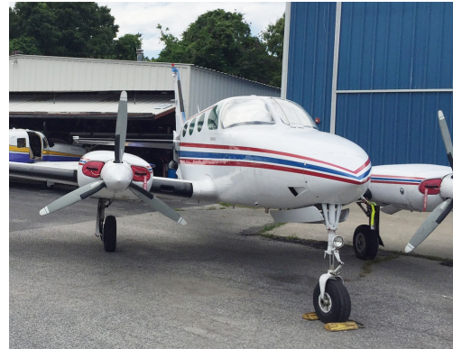
Cessna 340 Engine Inlet Plugs