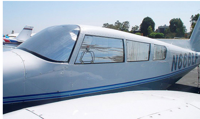
Piper PA-30 Twin Comanche Cockpit HeatShields