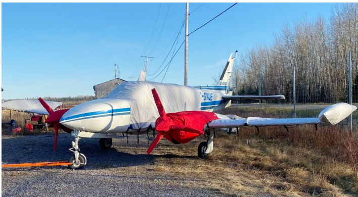
Cessna 340A Extended Canopy, Wing, Insulated Engine & Prop Covers

WINTER USE MATERIAL - Made with Solution-Dyed Polyester fabric, this option is intended for seasonal use to aid in deicing, rain mitigation, or for occasional travel. The material is lighter and more compact, but more susceptible to UV damage and may have a shorter useful life if used continuously outside than the all-year use material.