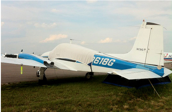
Cessna 320 Canopy Cover

Travel Covers are made with Silver Solution-Dyed Polyester fabric and only lined over the windshield to save weight. The material is lightweight and more compact for easy stowage in the aircraft. The polyester material is water resistant, but only intended for occasional use outside. We also have an ultra lightweight material available for fitted hangar dust covers. For daily outdoor use, the non-travel Sunbrella Cover is the best choice.