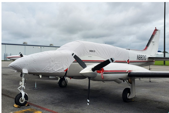
Cessna 340A Canopy/Nose Cover

This cover type is made from Silver Acrylic Sunbrella canvas and is 100% lined with a soft and smooth microfiber. Bruce's Custom Covers developed this material combination especially for aircraft protection. The outer material is medium weight and treated for water resistance, UV resistance and anti-static buildup. The inner lining is a very soft and smooth microfiber to prevent scratching. The material is very reflective, and tests show that the cabin interior temperature can be reduced to near-ambient temperature on the hottest of days. It is water, ice and snow repellent, yet breathable to allow moisture to escape from between the cover and the aircraft surface.