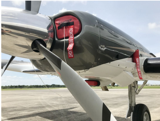
Cessna 340A Engine Plugs

Engine Inlet Plugs are custom fit for your Cessna 335, 340 intakes, made with heavy-duty vinyl material, and stuffed with a single block of sculpted urethane foam. Each plug has a zipper that allows the foam to be removed and dried if necessary. Engine plugs have warning flags that are visible from the cockpit or 'remove before flight' streamers sewn onto the face of the plugs. Most plugs are imprinted with the aircraft registration number in black for an extra charge. Storage bag NOT included. Engine plugs may be inserted after flight when the engine is still warm. Engine Inlet Plugs are commonly referred to as Cowl Plugs, Intake Plugs, Cowl Blocks, Engine Blocks, and Engine Bungs.