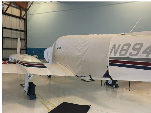
Cessna 340 Extended Canopy/Nose Cover