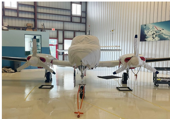
Cessna 340 Extended Canopy/Nose Cover

This cover type is made from Silver Acrylic Sunbrella canvas and is 100% lined with a soft and smooth microfiber. Bruce's Custom Covers developed this material combination especially for aircraft protection. The outer material is medium weight and treated for water resistance, UV resistance and anti-static buildup. The inner lining is a very soft and smooth microfiber to prevent scratching. The material is very reflective, and tests show that the cabin interior temperature can be reduced to near-ambient temperature on the hottest of days. It is water, ice and snow repellent, yet breathable to allow moisture to escape from between the cover and the aircraft surface.