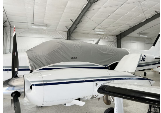
Cessna 340A Travel Weight Canopy Cover