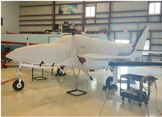
Cessna 340 Extended Canopy/Nose Cover

This cover type is made from Silver Acrylic Sunbrella canvas and is 100% lined with a soft and smooth microfiber. Bruce's Custom Covers developed this material combination especially for aircraft protection. The outer material is medium weight and treated for water resistance, UV resistance and anti-static buildup. The inner lining is a very soft and smooth microfiber to prevent scratching. The material is very reflective, and tests show that the cabin interior temperature can be reduced to near-ambient temperature on the hottest of days. It is water, ice and snow repellent, yet breathable to allow moisture to escape from between the cover and the aircraft surface.