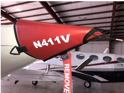
Cessna 335, 340 Wingtip Pads

Designed to prevent damage to the aircraft extremities in crowded hangars, these products are made of bright red Naugahyde and thickly padded with a sandwich of closed cell foam.