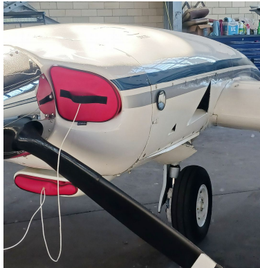
Cessna 340 Engine Inlet Plugs

Engine Inlet Plugs are custom fit for your Cessna 335, 340 intakes, made with heavy-duty vinyl material, and stuffed with a single block of sculpted urethane foam. Each plug has a zipper that allows the foam to be removed and dried if necessary. Engine plugs have warning flags that are visible from the cockpit or 'remove before flight' streamers sewn onto the face of the plugs. Most plugs are imprinted with the aircraft registration number in black for an extra charge. Storage bag NOT included. Engine plugs may be inserted after flight when the engine is still warm. Engine Inlet Plugs are commonly referred to as Cowl Plugs, Intake Plugs, Cowl Blocks, Engine Blocks, and Engine Bungs.