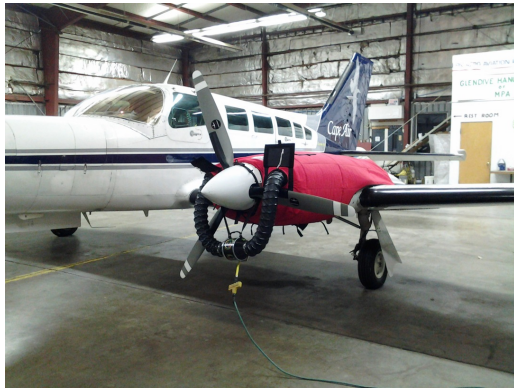
Cessna 402 Insulated Engine Cover with Heater

This cover type is made from Silver Acrylic Sunbrella canvas and is 100% lined with a soft and smooth microfiber. Bruce's Custom Covers developed this material combination especially for aircraft protection. The outer material is medium weight and treated for water resistance, UV resistance and anti-static buildup. The inner lining is a very soft and smooth microfiber to prevent scratching. The material is very reflective, and tests show that the cabin interior temperature can be reduced to near-ambient temperature on the hottest of days. It is water, ice and snow repellent, yet breathable to allow moisture to escape from between the cover and the aircraft surface.