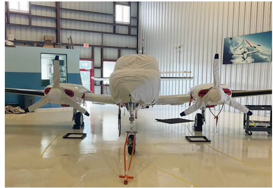
Cessna 340 Extended Canopy/Nose Cover