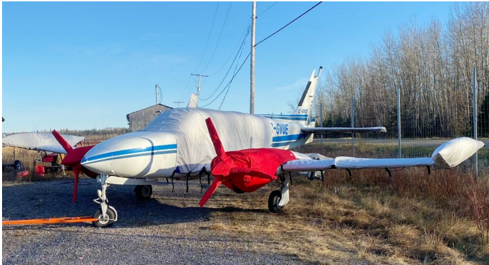
Cessna 340A Extended Canopy, Wing, Insulated Engine & Prop Covers

WINTER USE MATERIAL - Made with Solution-Dyed Polyester fabric, this option is intended for seasonal use to aid in deicing, rain mitigation, or for occasional travel. The material is lighter and more compact, but more susceptible to UV damage and may have a shorter useful life if used continuously outside than the all-year use material.