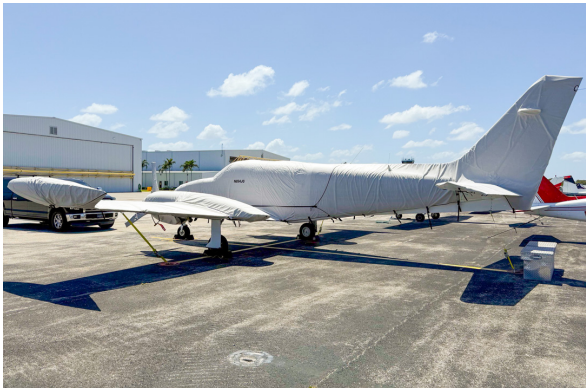
Cessna 340 Complete Cover Set