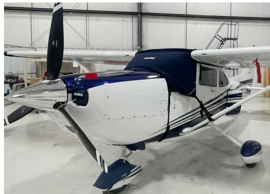
Cessna 182 Windshield Cover, Engine Plugs