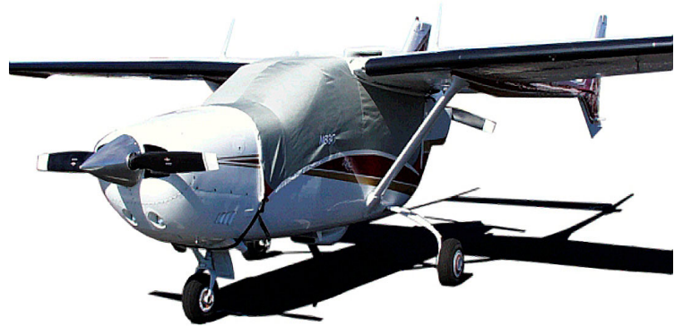
Cessna Skymaster Canopy Cover w/ 14" bib ext.