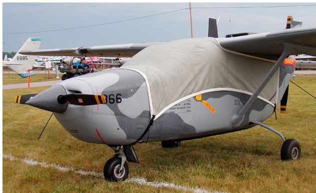
Cessna 337 Skymaster Canopy Cover w/ 14" bib ext.

This cover type is made from Silver Acrylic Sunbrella canvas and is 100% lined with a soft and smooth microfiber. Bruce's Custom Covers developed this material combination especially for aircraft protection. The outer material is medium weight and treated for water resistance, UV resistance and anti-static buildup. The inner lining is a very soft and smooth microfiber to prevent scratching. The material is very reflective, and tests show that the cabin interior temperature can be reduced to near-ambient temperature on the hottest of days. It is water, ice and snow repellent, yet breathable to allow moisture to escape from between the cover and the aircraft surface.