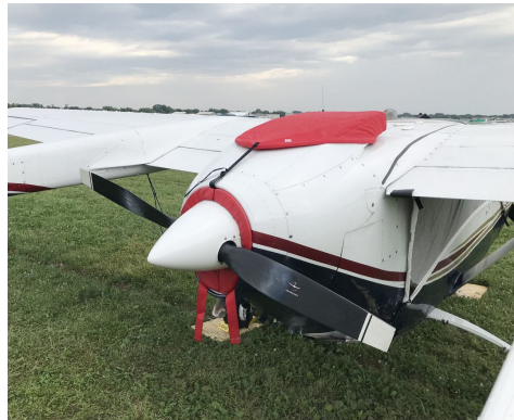
Cessna 337 Skymaster Aft Engine Inlet Cover, Rear Engine Plugs (SOLD SEPARATELY)