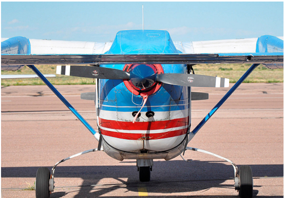
Cessna 337 Skymaster Aft Engine Inlet Plugs

Engine Inlet Plugs are custom fit for your Cessna 336 (Fixed Gear Skymaster) intakes, made with heavy-duty vinyl material, and stuffed with a single block of sculpted urethane foam. Each plug has a zipper that allows the foam to be removed and dried if necessary. Engine plugs have warning flags that are visible from the cockpit or 'remove before flight' streamers sewn onto the face of the plugs. Most plugs are imprinted with the aircraft registration number in black for an extra charge. Storage bag NOT included. Engine plugs may be inserted after flight when the engine is still warm. Engine Inlet Plugs are commonly referred to as Cowl Plugs, Intake Plugs, Cowl Blocks, Engine Blocks, and Engine Bungs.