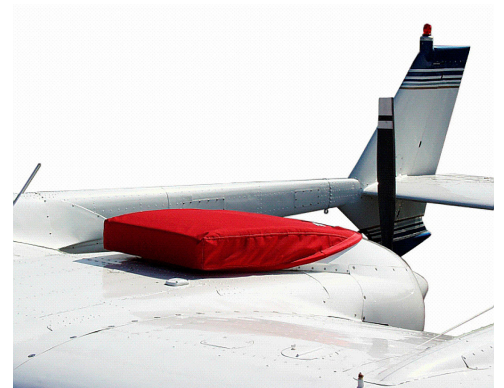
Cessna 337 Skymaster Aft Engine Cover