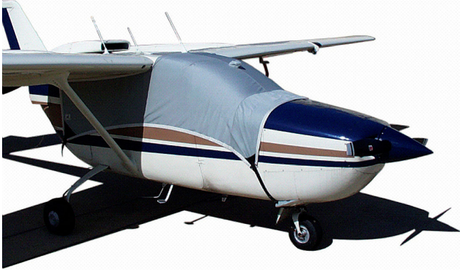
Cessna Skymaster Canopy Cover with Forward Extension

This cover type is made from Silver Acrylic Sunbrella canvas and is 100% lined with a soft and smooth microfiber. Bruce's Custom Covers developed this material combination especially for aircraft protection. The outer material is medium weight and treated for water resistance, UV resistance and anti-static buildup. The inner lining is a very soft and smooth microfiber to prevent scratching. The material is very reflective, and tests show that the cabin interior temperature can be reduced to near-ambient temperature on the hottest of days. It is water, ice and snow repellent, yet breathable to allow moisture to escape from between the cover and the aircraft surface.