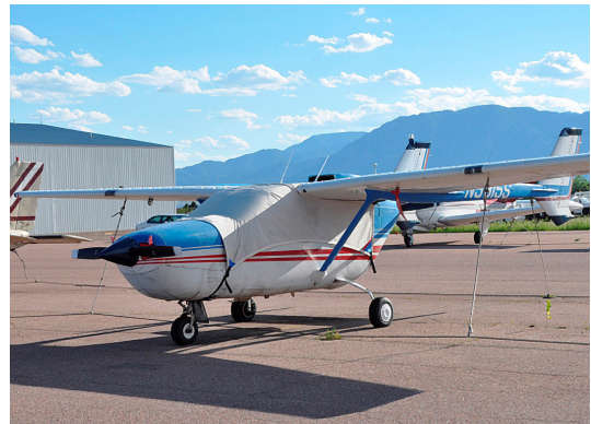
Cessna 337 Skymaster Canopy Cover, Forward Engine Plugs and Pitot Cover