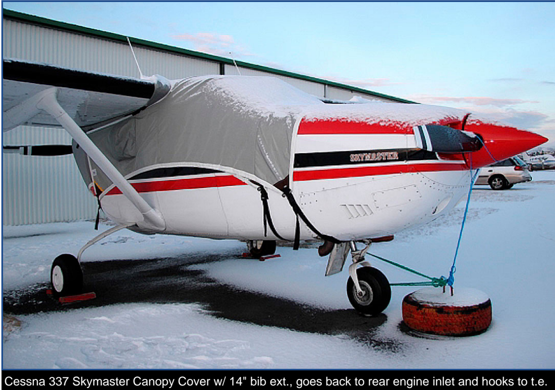
Cessna 337 Skymaster Canopy Cover w/ 14" bib ext., goes back to rear engine inlet and hooks to t.e.