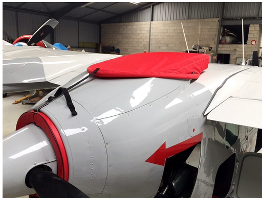
Cessna 337 Skymaster Aft Engine Inlet Cover, hoop type, & outlet plugs (SOLD SEPARATELY)

Engine Inlet Plugs are custom fit for your Cessna 336 (Fixed Gear Skymaster) intakes, made with heavy-duty vinyl material, and stuffed with a single block of sculpted urethane foam. Each plug has a zipper that allows the foam to be removed and dried if necessary. Engine plugs have warning flags that are visible from the cockpit or 'remove before flight' streamers sewn onto the face of the plugs. Most plugs are imprinted with the aircraft registration number in black for an extra charge. Storage bag NOT included. Engine plugs may be inserted after flight when the engine is still warm. Engine Inlet Plugs are commonly referred to as Cowl Plugs, Intake Plugs, Cowl Blocks, Engine Blocks, and Engine Bung.