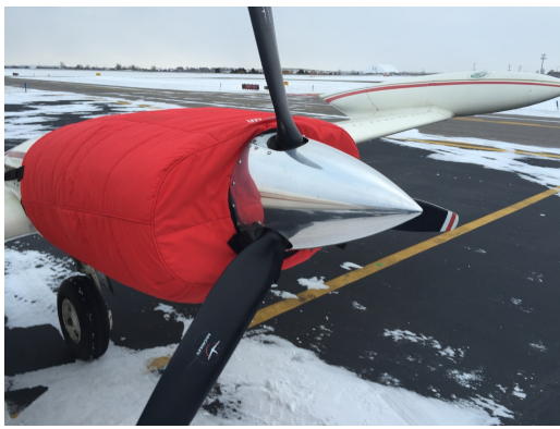
Cessna 310 Insulated Engine Cover