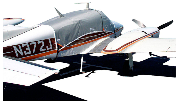
Cessna 320 Canopy Cover