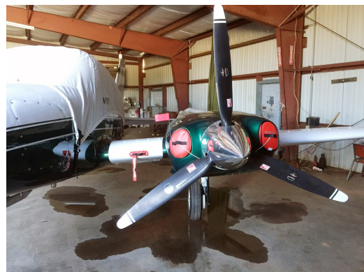
Cessna 310 Engine and Center Section Plugs