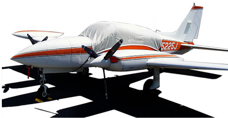
Cessna 310Q Canopy Cover