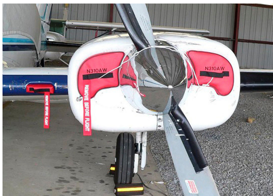
Cessna 310P Engine Inlet and Center Section Inlet Plugs

Engine Inlet Plugs are custom fit for your Cessna 320 intakes, made with heavy-duty vinyl material, and stuffed with a single block of sculpted urethane foam. Each plug has a zipper that allows the foam to be removed and dried if necessary. Engine plugs have warning flags that are visible from the cockpit or 'remove before flight' streamers sewn onto the face of the plugs. Most plugs are imprinted with the aircraft registration number in black for an extra charge. Storage bag NOT included. Engine plugs may be inserted after flight when the engine is still warm. Engine Inlet Plugs are commonly referred to as Cowl Plugs, Intake Plugs, Cowl Blocks, Engine Blocks, and Engine Bungs.