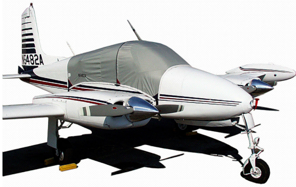
Cessna 310A Canopy Cover