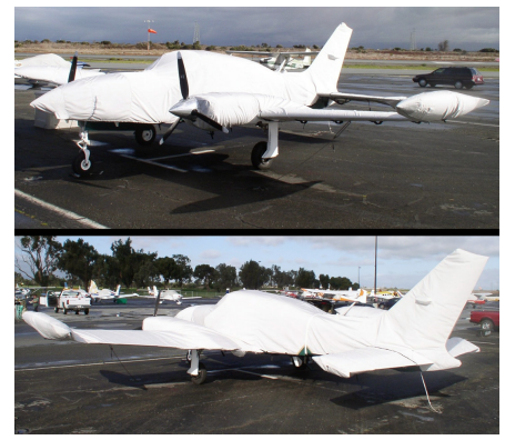
Cessna 310 Complete Cover Set