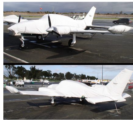
Cessna 310 Complete Cover Set