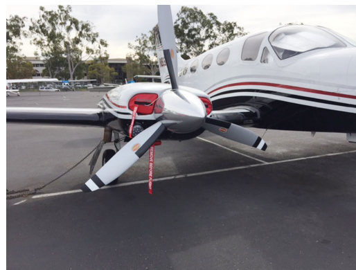
Cessna 414 Engine Inlet Plugs