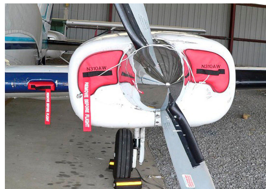
Cessna 310P Engine Inlet and Center Section Inlet Plugs