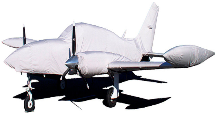
Cessna 310 Complete Cover Set