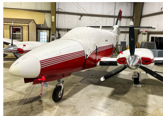
Cessna T303 Canopy Cover, Engine Plugs