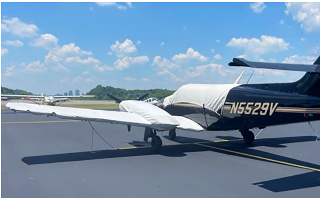
Cessna T303 Crusader Canopy Cover

This cover type is made from Silver Acrylic Sunbrella canvas and is 100% lined with a soft and smooth microfiber. Bruce's Custom Covers developed this material combination especially for aircraft protection. The outer material is medium weight and treated for water resistance, UV resistance and anti-static buildup. The inner lining is a very soft and smooth microfiber to prevent scratching. The material is very reflective, and tests show that the cabin interior temperature can be reduced to near-ambient temperature on the hottest of days. It is water, ice and snow repellent, yet breathable to allow moisture to escape from between the cover and the aircraft surface.