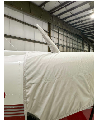
Cessna T303 Canopy Cover