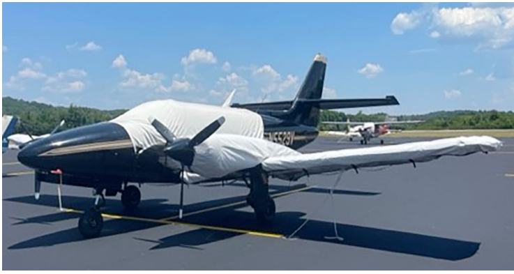
Cessna T303 Crusader Canopy Cover