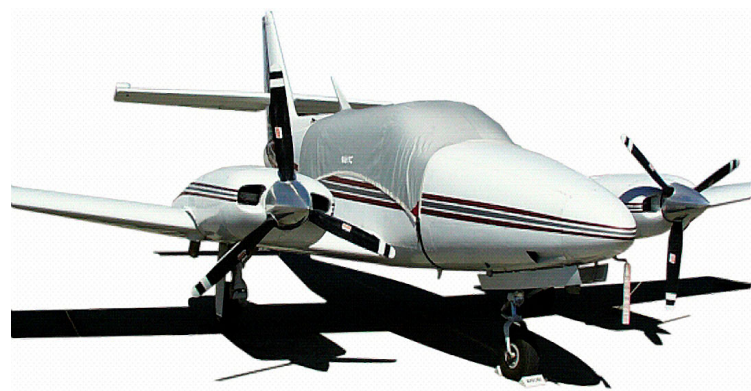
Cessna Crusader Standard Canopy Cover

Travel Covers are made with Silver Solution-Dyed Polyester fabric and only lined over the windshield to save weight. The material is lightweight and more compact for easy stowage in the aircraft. The polyester material is water resistant, but only intended for occasional use outside. We also have an ultra lightweight material available for fitted hangar dust covers. For daily outdoor use, the non-travel Sunbrella Cover is the best choice.