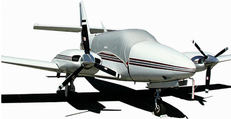
Cessna Crusader Standard Canopy Cover

Travel Covers are made with Silver Solution-Dyed Polyester fabric and only lined over the windshield to save weight. The material is lightweight and more compact for easy stowage in the aircraft. The polyester material is water resistant, but only intended for occasional use outside. We also have an ultra lightweight material available for fitted hangar dust covers. For daily outdoor use, the non-travel Sunbrella Cover is the best choice.