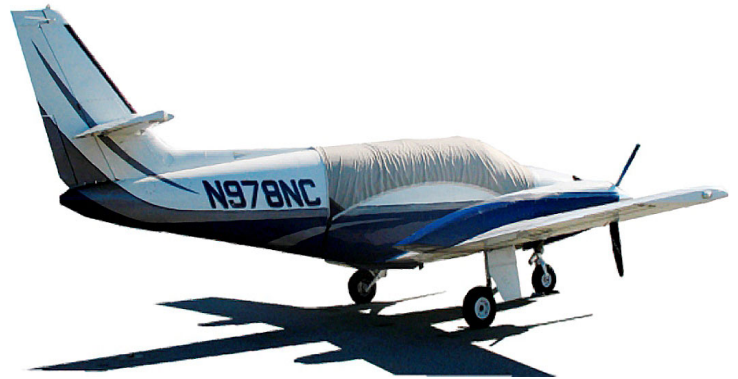
Cessna 303 Crusader Canopy Cover