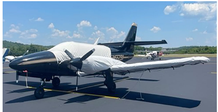
Cessna T303 Crusader Canopy Cover