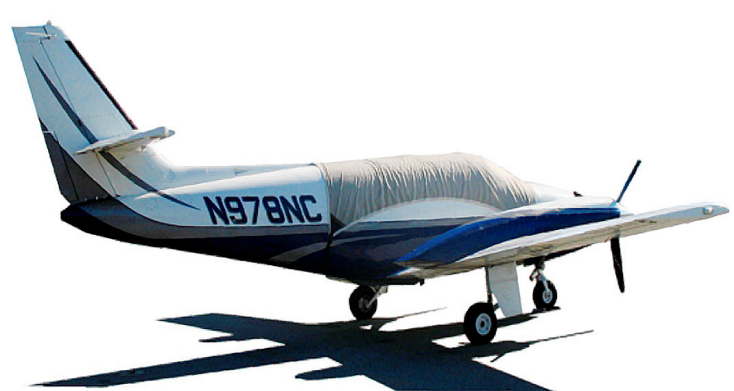
Cessna 303 Crusader Canopy Cover