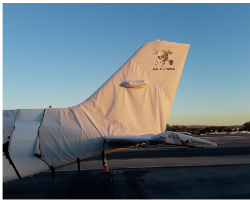
Cessna 421 Empennage Cover