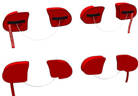
Cessna 414A Engine Plugs

Engine Inlet Plugs are custom fit for your Cessna T303 Crusader intakes, made with heavy-duty vinyl material, and stuffed with a single block of sculpted urethane foam. Each plug has a zipper that allows the foam to be removed and dried if necessary. Engine plugs have warning flags that are visible from the cockpit or 'remove before flight' streamers sewn onto the face of the plugs. Most plugs are imprinted with the aircraft registration number in black for an extra charge. Storage bag NOT included. Engine plugs may be inserted after flight when the engine is still warm. Engine Inlet Plugs are commonly referred to as Cowl Plugs, Intake Plugs, Cowl Blocks, Engine Blocks, and Engine Bungs.