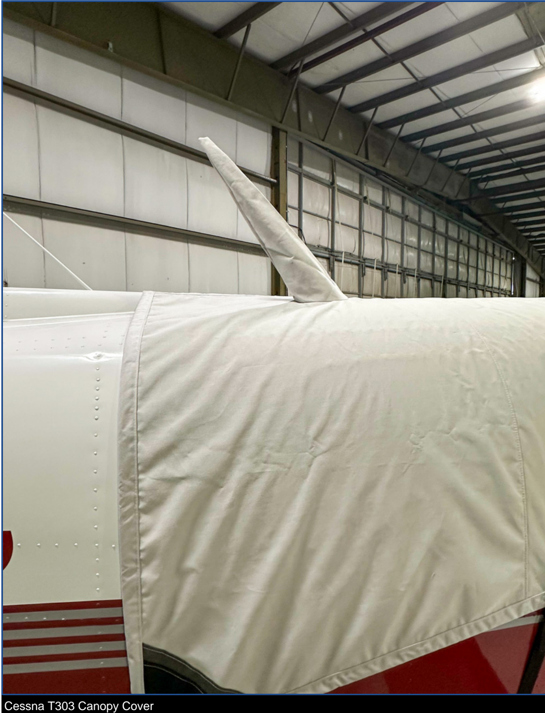
Cessna T303 Canopy Cover