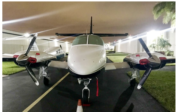
Cessna T303 Crusader Engine Inlet Plugs