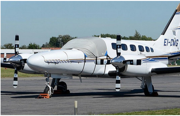
Cessna 441 Cockpit Cover