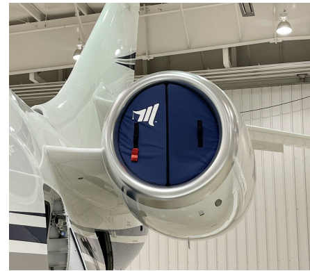
Falcon Jet Engine Inlet Plugs Folding Type