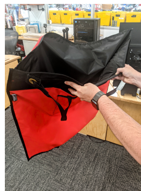
Semi-rigid for easy installation.