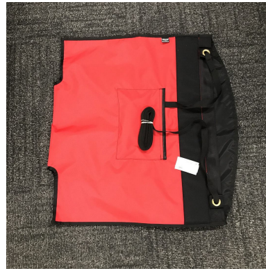
Bell 230 Blade Tie-Downs, (Semi-Rigid) W/Telescoping Attachment Handle