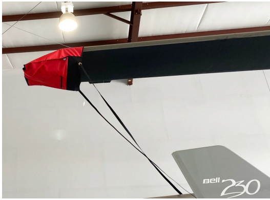
Bell 230 Blade Tie-Downs, (Semi-Rigid) W/Telescoping Attachment Handle