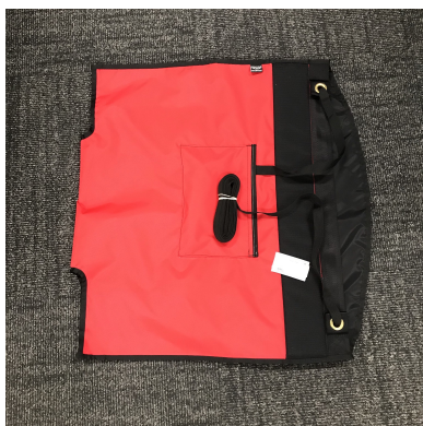
Full size blade cover.