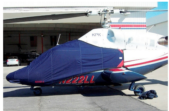
Bell 222 Bubble Cover