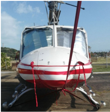
Bell 212 Windshield HeatShields

Cockpit Heatshields are interior sunshades for the aircraft's cockpit. The product is a unique composite of closed-cell foam with a silver mylar finish. The semi-rigid design is stiff enough to stand inside the window framing. Darts and folds are incorporated into the material so that it conforms to the complex shape of the helicopter windows. The set folds up flat and is easily stored in the included storage sleeve. Some designs may require velcro and suction cups. A Heatshield is an excellent short-term remedy for cockpit overheating, but an external fabric cover is more effective for long-term protection.