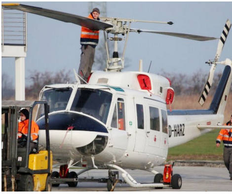
Bell 212 Main and Oil Cooler Intake Plugs