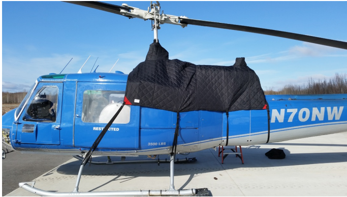
Bell 204 Insulated Engine Area Cover

WINTER USE MATERIAL - Made with Solution-Dyed Polyester fabric, this option is intended for seasonal use to aid in deicing, rain mitigation, or for occasional travel. The material is lighter and more compact, but more susceptible to UV damage and may have a shorter useful life if used continuously outside than the all-year use material.