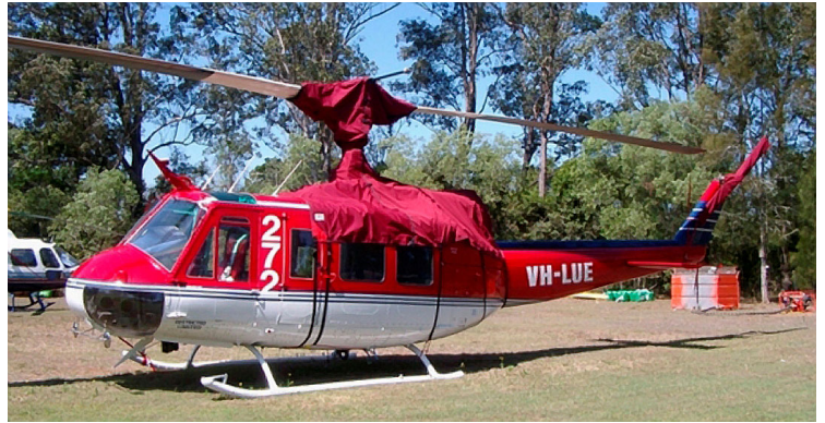
Bell 204/205 Engine/Mid-Cabin Cover, Main & Tail Rotor Covers