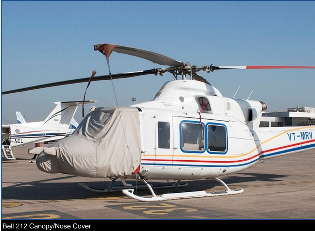
Bell 212 Canopy/Nose Cover