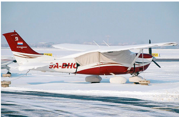
Cessna 206 Wrap-Around Canopy Cover

This cover type is made from Silver Acrylic Sunbrella canvas and is 100% lined with a soft and smooth microfiber. Bruce's Custom Covers developed this material combination especially for aircraft protection. The outer material is medium weight and treated for water resistance, UV resistance and anti-static buildup. The inner lining is a very soft and smooth microfiber to prevent scratching. The material is very reflective, and tests show that the cabin interior temperature can be reduced to near-ambient temperature on the hottest of days. It is water, ice and snow repellent, yet breathable to allow moisture to escape from between the cover and the aircraft surface.