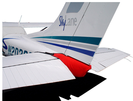
Cessna 182 Tailcone Cover