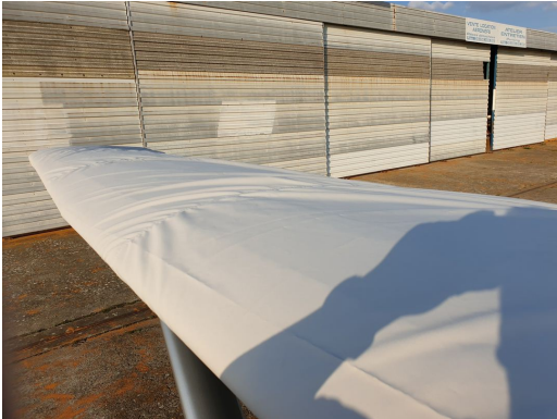
Cessna 207 Wing Covers

WINTER USE MATERIAL - Made with Solution-Dyed Polyester fabric, this option is intended for seasonal use to aid in deicing, rain mitigation, or for occasional travel. The material is lighter and more compact, but more susceptible to UV damage and may have a shorter useful life if used continuously outside than the all-year use material.