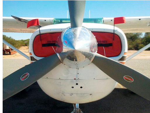
Cessna 207 Engine Inlet Plugs