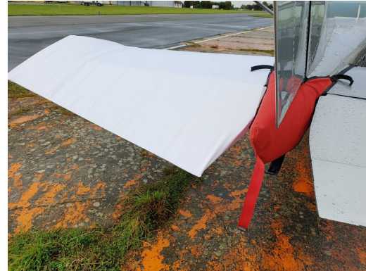
Cessna 207 Tailcone Cover, Horizontal Stab. Cover (test fit)