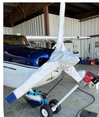
Cessna 182 Skylane 3-Blade Prop Cover