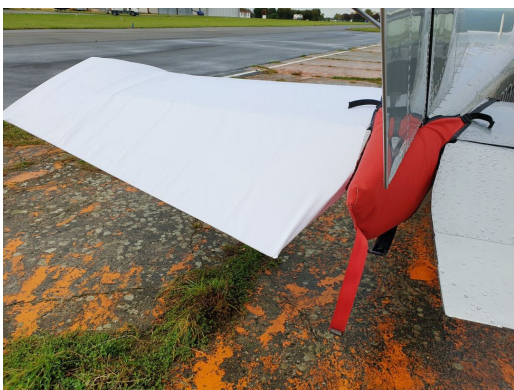
Cessna 207 Tailcone Cover, Horizontal Stab. Cover (test fit)

WINTER USE MATERIAL - Made with Solution-Dyed Polyester fabric, this option is intended for seasonal use to aid in deicing, rain mitigation, or for occasional travel. The material is lighter and more compact, but more susceptible to UV damage and may have a shorter useful life if used continuously outside than the all-year use material.