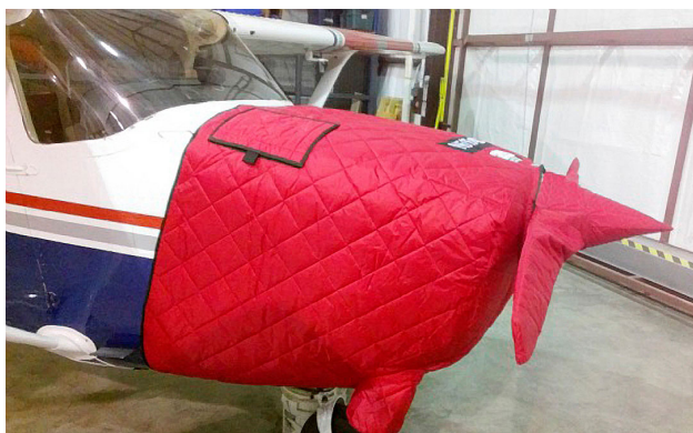
Cessna 172 Insulated Engine Cover w/ Oil Filler Door flap and Insulated Prop/Spinner Cover

This cover type is made from Silver Acrylic Sunbrella canvas and is 100% lined with a soft and smooth microfiber. Bruce's Custom Covers developed this material combination especially for aircraft protection. The outer material is medium weight and treated for water resistance, UV resistance and anti-static buildup. The inner lining is a very soft and smooth microfiber to prevent scratching. The material is very reflective, and tests show that the cabin interior temperature can be reduced to near-ambient temperature on the hottest of days. It is water, ice and snow repellent, yet breathable to allow moisture to escape from between the cover and the aircraft surface.