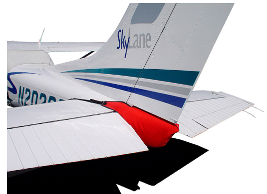
Cessna 182 Tailcone Cover