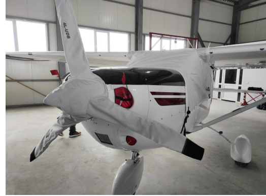
Cessna 206 3-Blade Prop Cover, Engine Plugs