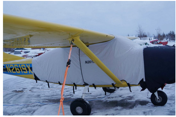
Cessna 206 Extended Canopy Cover, Over-Top Style