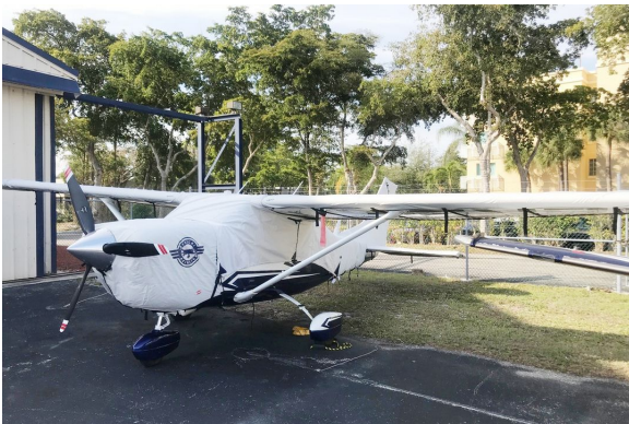
Cessna T206H Canopy, Engine, Wing & Empennage Covers

WINTER USE MATERIAL - Made with Solution-Dyed Polyester fabric, this option is intended for seasonal use to aid in deicing, rain mitigation, or for occasional travel. The material is lighter and more compact, but more susceptible to UV damage and may have a shorter useful life if used continuously outside than the all-year use material.