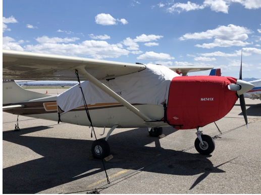
Cessna 206 Insulated Engine Cover, Canopy Cover

This cover type is made from Silver Acrylic Sunbrella canvas and is 100% lined with a soft and smooth microfiber. Bruce's Custom Covers developed this material combination especially for aircraft protection. The outer material is medium weight and treated for water resistance, UV resistance and anti-static buildup. The inner lining is a very soft and smooth microfiber to prevent scratching. The material is very reflective, and tests show that the cabin interior temperature can be reduced to near-ambient temperature on the hottest of days. It is water, ice and snow repellent, yet breathable to allow moisture to escape from between the cover and the aircraft surface.