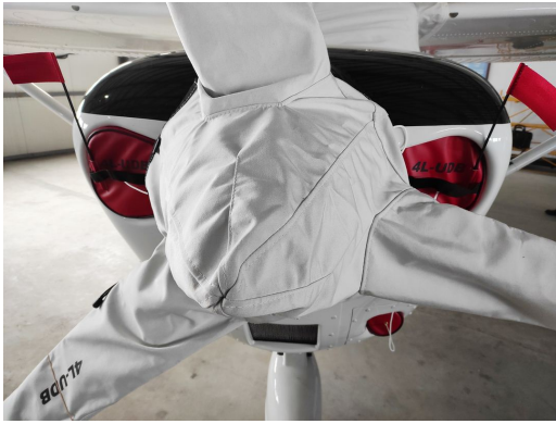
Cessna 206 3-Blade Prop Cover, Engine Plugs

be inserted after flight when the engine is still warm. Engine Inlet Plugs are commonly referred to as Cowl Plugs, Intake Plugs, Cowl Blocks, Engine Blocks, and Engine Bungs.