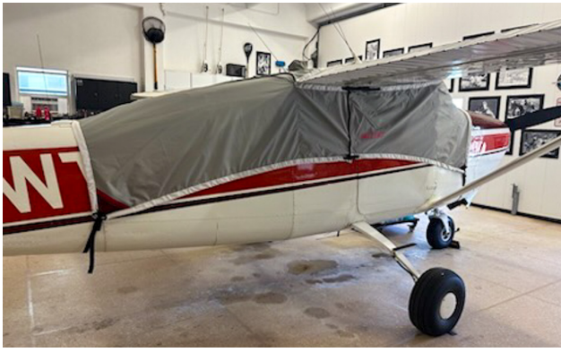
Cessna 205 Stationair Canopy Cover, Over Top Type