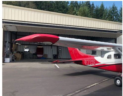
Cessna 206 Wingtip Pads