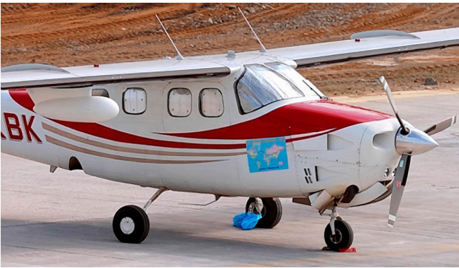
Cessna P210 HeatShield Set

Windshield Heatshields are interior sunshades for an aircraft's front windshield. The product is a unique composite of closed-cell foam with a silver mylar finish. The semi-rigid design is stiff enough to stand along the inside of the windshield using sun visors or window framing. It folds up flat and easily stores in the included storage sleeve. Some designs may require velcro and suction cups or split right and left sides. A Heatshield is an excellent short-term remedy for cockpit overheating. An external fabric cover is far more effective and practical for long-term protection.