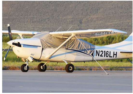
Cessna 206 Travel Cover