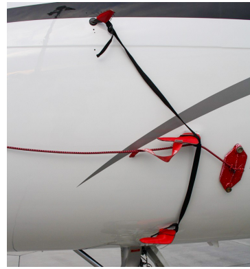
Grumman Gulfstream G-V Rosemont/TAT Cover Falcon Jet 2000 Pitot Covers, Aoa's, Tat Cover Set, Heat Resistant Type