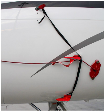
Falcon Jet 2000 Pitot Covers, Aoa's, Tat Cover Set, Heat Resistant Type