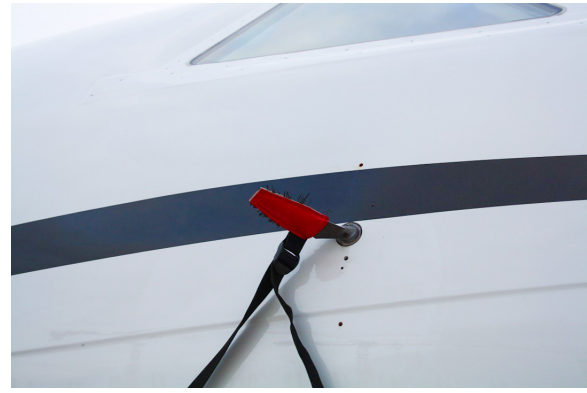
Falcon Jet 2000 Pitot Covers, Aoa's, Tat Cover Set, Heat Resistant Type