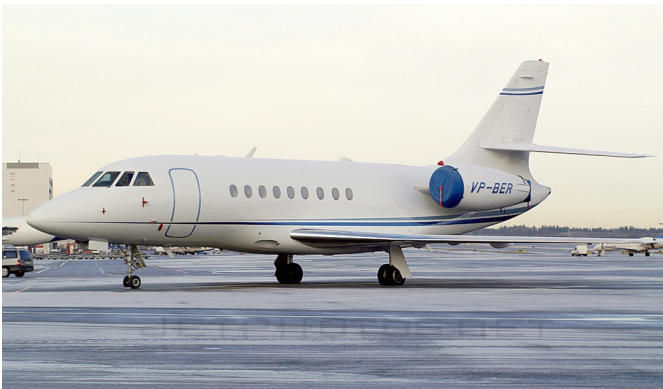
Falcon 2000 Engine Cover Set