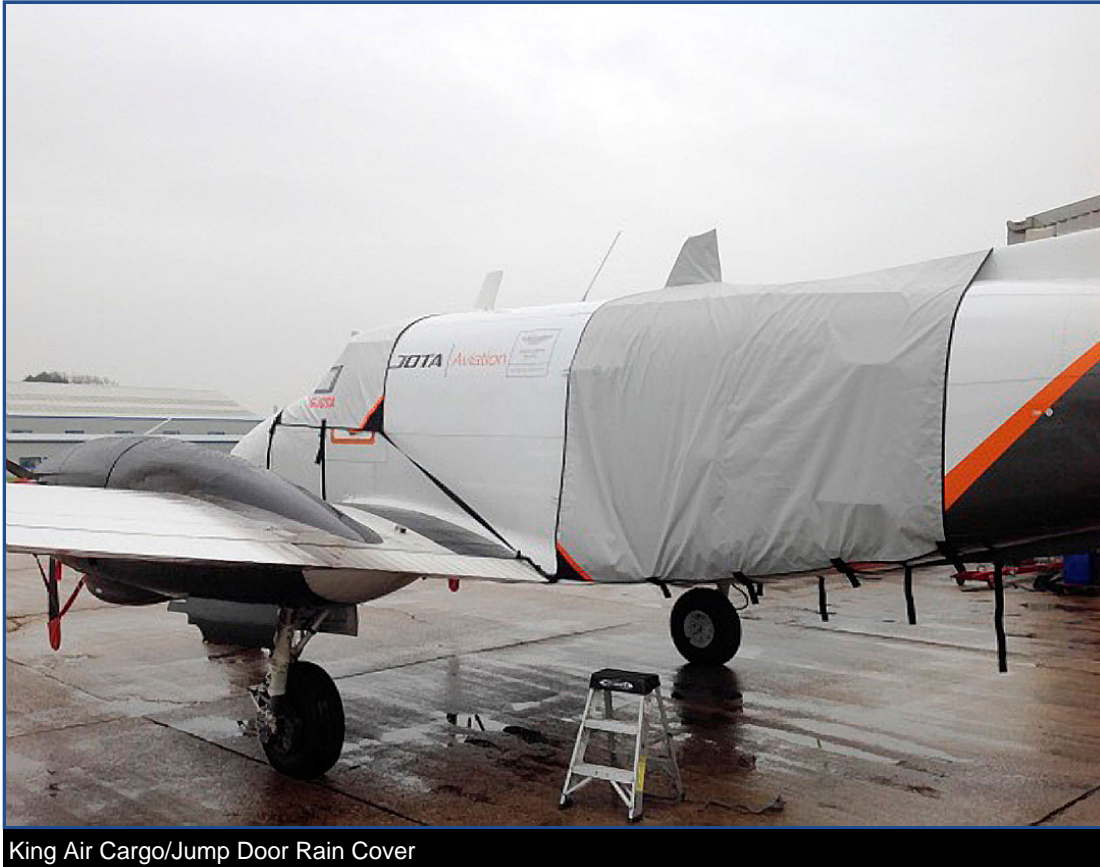
King Air Cargo/Jump Door Rain Cover