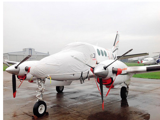
King Air Cockpit/Nose Cover, Plugs, Prop Tie/Exhaust Covers