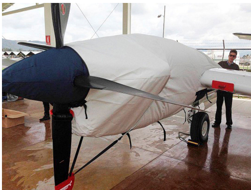
King Air C90 Engine Cover

This cover type is made from Silver Acrylic Sunbrella canvas and is 100% lined with a soft and smooth microfiber. Bruce's Custom Covers developed this material combination especially for aircraft protection. The outer material is medium weight and treated for water resistance, UV resistance and anti-static buildup. The inner lining is a very soft and smooth microfiber to prevent scratching. The material is very reflective, and tests show that the cabin interior temperature can be reduced to near-ambient temperature on the hottest of days. It is water, ice and snow repellent, yet breathable to allow moisture to escape from between the cover and the aircraft surface.