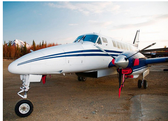
Beech 99 Engine Plugs & Prop Ties