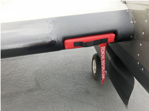
Beech King Air Heat Exchanger Inlet Plug

Engine Inlet Plugs are custom fit for your Beech 1900D intakes, made with heavy-duty vinyl material, and stuffed with a single block of sculpted urethane foam. Each plug has a zipper that allows the foam to be removed and dried if necessary. Engine plugs have warning flags that are visible from the cockpit or 'remove before flight' streamers sewn onto the face of the plugs. Most plugs are imprinted with the aircraft registration number in black for an extra charge. Storage bag NOT included. Engine plugs may be inserted after flight when the engine is still warm. Engine Inlet Plugs are commonly referred to as Cowl Plugs, Intake Plugs, Cowl Blocks, Engine Blocks, and Engine Bungs.