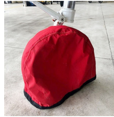
Beech King Air 300 Tire Covers (nose gear)