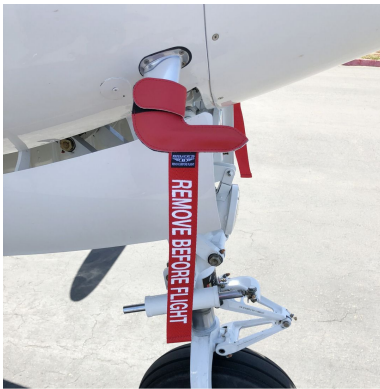
Beech King Air Pitot Covers

Engine Inlet Plugs are custom fit for your Beech 1900D intakes, made with heavy-duty vinyl material, and stuffed with a single block of sculpted urethane foam. Each plug has a zipper that allows the foam to be removed and dried if necessary. Engine plugs have warning flags that are visible from the cockpit or 'remove before flight' streamers sewn onto the face of the plugs. Most plugs are imprinted with the aircraft registration number in black for an extra charge. Storage bag NOT included. Engine plugs may be inserted after flight when the engine is still warm. Engine Inlet Plugs are commonly referred to as Cowl Plugs, Intake Plugs, Cowl Blocks, Engine Blocks, and Engine Bungs.