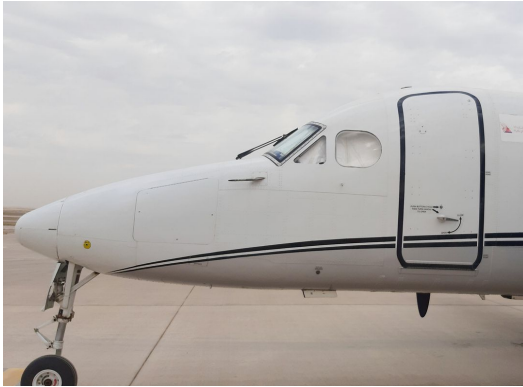
Raytheon 1900D Cockpit HeatShields

Cockpit Heatshields are interior sunshades for the aircraft's cockpit. The product is a unique composite of closed-cell foam with a silver mylar finish. The semi-rigid design is stiff enough to stand inside the window framing. The set folds up flat and is easily stored in the included storage sleeve. Some designs may require velcro and suction cups. A Heatshield is an excellent short-term remedy for cockpit overheating, but an external fabric cover is more effective for long-term protection.