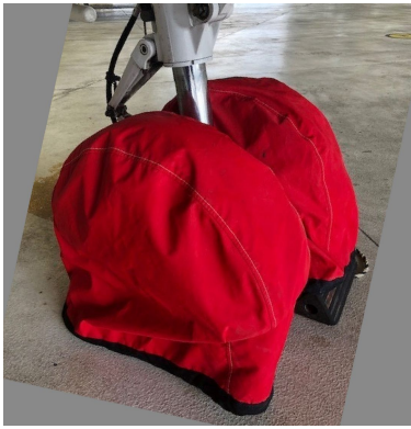
Beech King Air 300 Tire Covers (main gear)