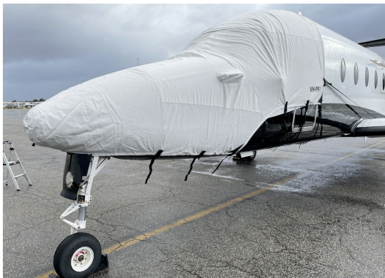
Raytheon/Beech 1900D Cockpit/Nose Cover

The Beech 1900D Nose Cover is designed to cover the section of the fuselage forward of the windshield to the tip of the nose. It is secured with belly straps. This cover type is made from Silver Acrylic Sunbrella canvas and is 100% lined with a soft and smooth microfiber. Bruce's Custom Covers developed this material combination especially for aircraft protection. The outer material is medium weight and treated for water resistance, UV resistance and anti-static buildup. The inner lining is a very soft and smooth microfiber to prevent scratching. The material is very reflective, and tests show that the cabin interior temperature can be reduced to near-ambient temperature on the hottest of days. It is water, ice and snow repellent, yet breathable to allow moisture to escape from between the cover and the aircraft surface.