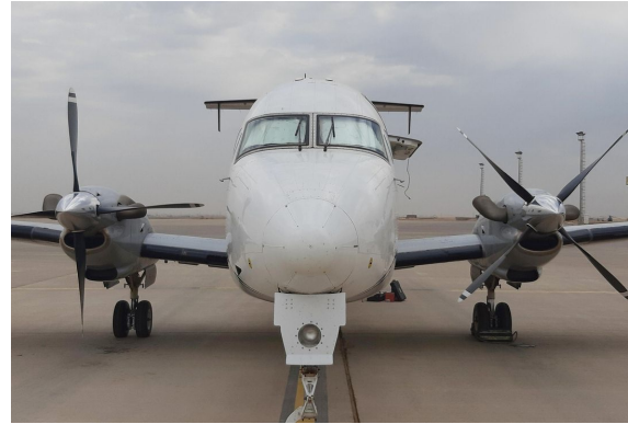
Raytheon 1900D Cockpit HeatShields