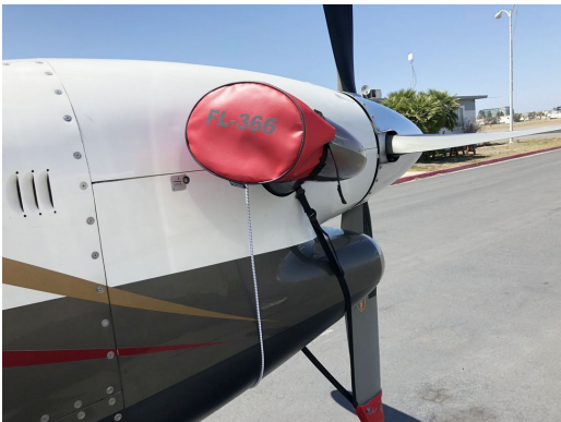
Beech King Air 350 Prop Tie-Downs/Exhaust Covers Combination