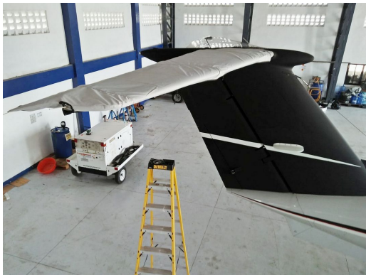
Beech King Air B350 Horizontal Stabilizer Covers

WINTER USE MATERIAL - Made with Solution-Dyed Polyester fabric, this option is intended for seasonal use to aid in deicing, rain mitigation, or for occasional travel. The material is lighter and more compact, but more susceptible to UV damage and may have a shorter useful life if used continuously outside than the all-year use material.