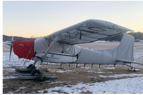
Cessna A185E Winter Cover Set