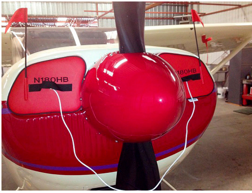
Cessna 180 Engine Plugs, Pitot Cover