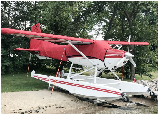
Cessna 185 Canopy, Wings & Empennage Covers, and Engine Plugs

WINTER USE MATERIAL - Made with Solution-Dyed Polyester fabric, this option is intended for seasonal use to aid in deicing, rain mitigation, or for occasional travel. The material is lighter and more compact, but more susceptible to UV damage and may have a shorter useful life if used continuously outside than the all-year use material.