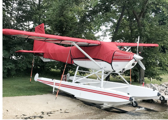
Cessna 185 Canopy, Wings & Empennage Covers, and Engine Plugs