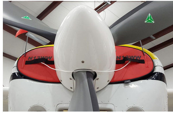
Cessna 180/185 Skywagon Engine Inlet Plugs