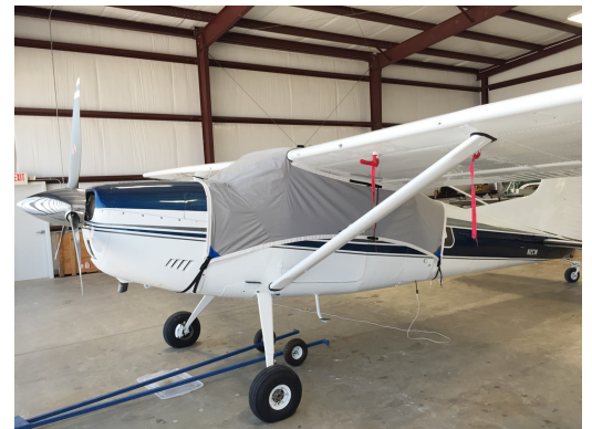
Cessna 180 Light Weight Travel Cover