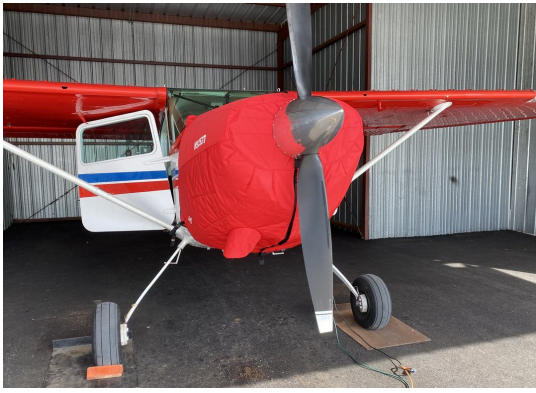
Cessna 180C Insulated Engine Cover