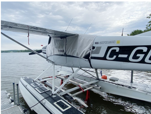
Cessna A185F Canopy Cover Over Top Type w/Bubble Windows

This cover type is made from Silver Acrylic Sunbrella canvas and is 100% lined with a soft and smooth microfiber. Bruce's Custom Covers developed this material combination especially for aircraft protection. The outer material is medium weight and treated for water resistance, UV resistance and anti-static buildup. The inner lining is a very soft and smooth microfiber to prevent scratching. The material is very reflective, and tests show that the cabin interior temperature can be reduced to near-ambient temperature on the hottest of days. It is water, ice and snow repellent, yet breathable to allow moisture to escape from between the cover and the aircraft surface.