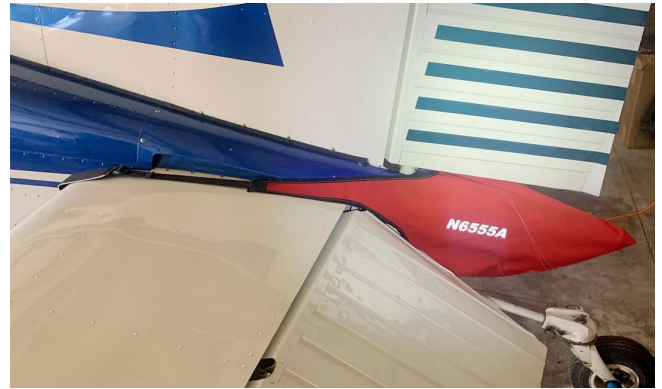
Cessna 180 Skywagon Tailcone Cover