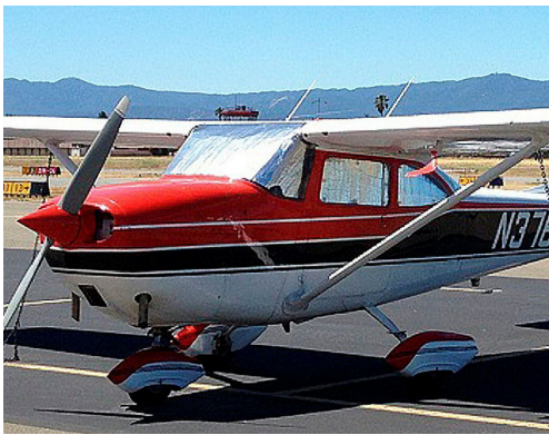
Cessna 172 Cabin HeatShields

Windshield Heatshields are interior sunshades for an aircraft's front windshield. The product is a unique composite of closed-cell foam with a silver mylar finish. The semi-rigid design is stiff enough to stand along the inside of the windshield using sun visors or window framing. It folds up flat and easily stores in the included storage sleeve. Some designs may require velcro and suction cups or split right and left sides. A Heatshield is an excellent short-term remedy for cockpit overheating. An external fabric cover is far more effective and practical for long-term protection.