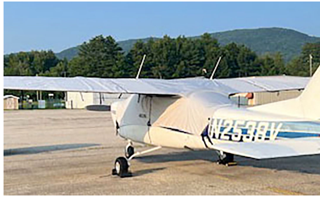
Cessna 177 Cardinal Over-Top Canopy Cover, extends to cover gas caps, & Wing Covers