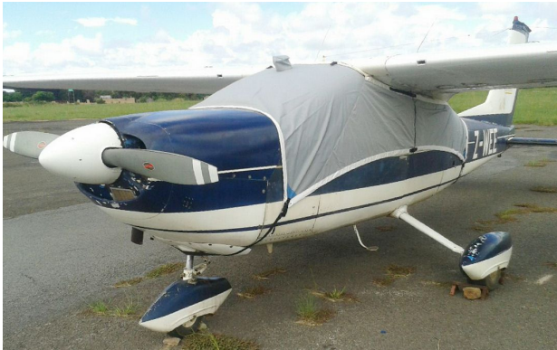
Cessna 177 Cardinal Travel Canopy Cover

Travel Covers are made with Silver Solution-Dyed Polyester fabric and only lined over the windshield to save weight. The material is lightweight and more compact for easy stowage in the aircraft. The polyester material is water resistant, but only intended for occasional use outside. We also have an ultra lightweight material available for fitted hangar dust covers. For daily outdoor use, the non-travel Sunbrella Cover is the best choice.