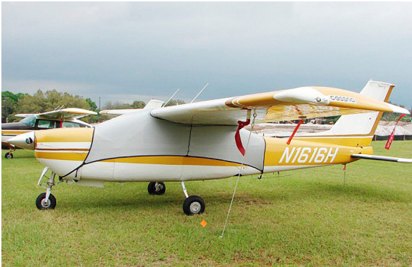
Cessna Cardinal Spandex FlyAway Cover