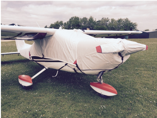
Cessna Cardinal Prop Cover, Full Cover Set

This cover type is made from Silver Acrylic Sunbrella canvas and is 100% lined with a soft and smooth microfiber. Bruce's Custom Covers developed this material combination especially for aircraft protection. The outer material is medium weight and treated for water resistance, UV resistance and anti-static buildup. The inner lining is a very soft and smooth microfiber to prevent scratching. The material is very reflective, and tests show that the cabin interior temperature can be reduced to near-ambient temperature on the hottest of days. It is water, ice and snow repellent, yet breathable to allow moisture to escape from between the cover and the aircraft surface.