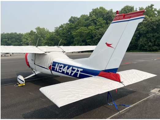
Cessna 177 Cardinal Cover Set