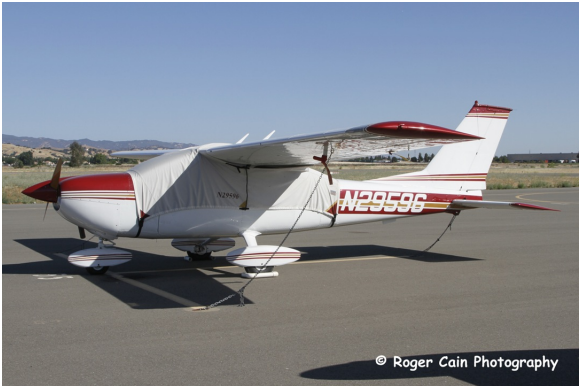
Cessna Cardinal Standard Canopy Cover