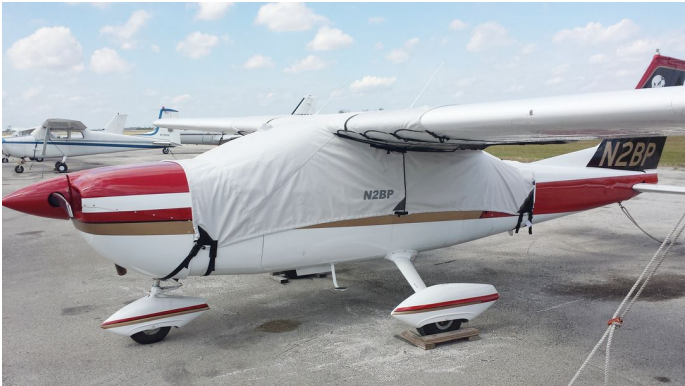
Cessna 177 Cardinal Over-Top Canopy Cover, extends to cover gas caps.

This cover type is made from Silver Acrylic Sunbrella canvas and is 100% lined with a soft and smooth microfiber. Bruce's Custom Covers developed this material combination especially for aircraft protection. The outer material is medium weight and treated for water resistance, UV resistance and anti-static buildup. The inner lining is a very soft and smooth microfiber to prevent scratching. The material is very reflective, and tests show that the cabin interior temperature can be reduced to near-ambient temperature on the hottest of days. It is water, ice and snow repellent, yet breathable to allow moisture to escape from between the cover and the aircraft surface.