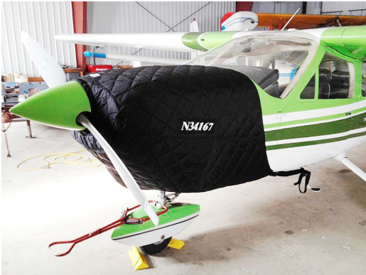
Cessna Cardinal Insulated Engine Cover (incl. Powerflow Exhaust)