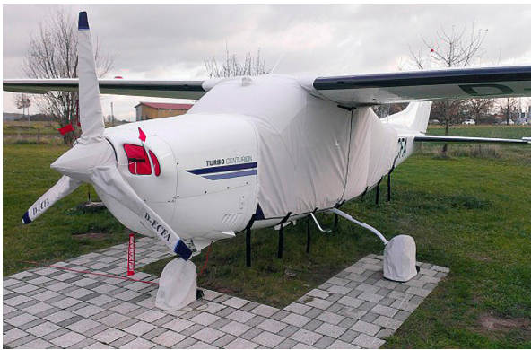
Cessna 210 Extended Canopy Cover, Engine Plugs, Prop and Tire Covers

Engine Inlet Plugs are custom fit for your Cessna 177 Cardinal intakes, made with heavy-duty vinyl material, and stuffed with a single block of sculpted urethane foam. Each plug has a zipper that allows the foam to be removed and dried if necessary. Engine plugs have warning flags that are visible from the cockpit or 'remove before flight' streamers sewn onto the face of the plugs. Most plugs are imprinted with the aircraft registration number in black for an extra charge. Storage bag NOT included. Engine plugs may be inserted after flight when the engine is still warm. Engine Inlet Plugs are commonly referred to as Cowl Plugs, Intake Plugs, Cowl Blocks, Engine Blocks, and Engine Bungs.