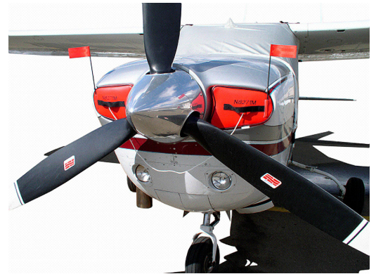
Cessna 210 Engine Plugs