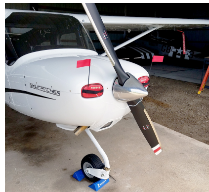
Cessna Skycatcher 162 Engine Inlet Plugs