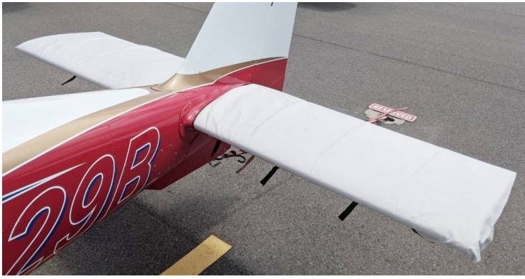
Cessna 162 Skycatcher Horizontal Stabilizer Covers