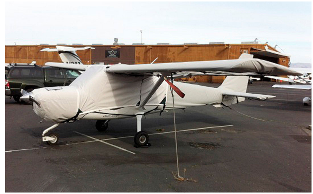
Cessna Skycatcher Full Cover Set