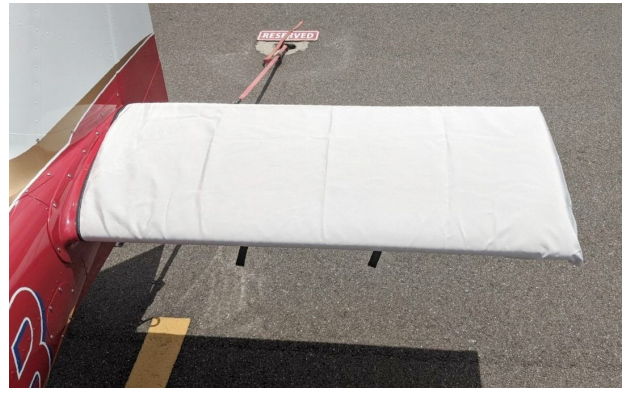
Cessna 162 Skycatcher Horizontal Stabilizer Covers