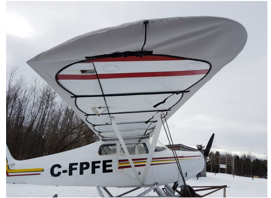
Christavia Mk 1 Wing Covers