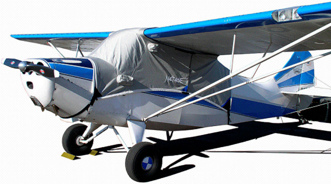
Aeronca Champ Canopy Cover

This cover type is made from Silver Acrylic Sunbrella canvas and is 100% lined with a soft and smooth microfiber. Bruce's Custom Covers developed this material combination especially for aircraft protection. The outer material is medium weight and treated for water resistance, UV resistance and anti-static buildup. The inner lining is a very soft and smooth microfiber to prevent scratching. The material is very reflective, and tests show that the cabin interior temperature can be reduced to near-ambient temperature on the hottest of days. It is water, ice and snow repellent, yet breathable to allow moisture to escape from between the cover and the aircraft surface.