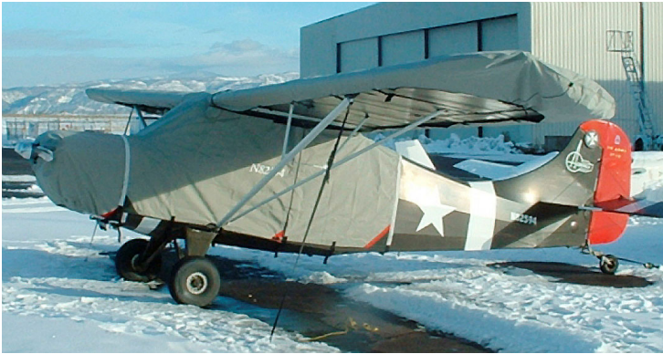
Extended Canopy Cover, Engine & Wing Covers

WINTER USE MATERIAL - Made with Solution-Dyed Polyester fabric, this option is intended for seasonal use to aid in deicing, rain mitigation, or for occasional travel. The material is lighter and more compact, but more susceptible to UV damage and may have a shorter useful life if used continuously outside than the all-year use material.