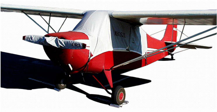
Aeronca Champ Canopy & Prop Covers