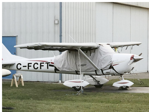
Cessna 150 Extended Canopy Cover, Wing Covers, Engine Plugs

Engine Inlet Plugs are custom fit for your Cessna 150 & 152 intakes, made with heavy-duty vinyl material, and stuffed with a single block of sculpted urethane foam. Each plug has a zipper that allows the foam to be removed and dried if necessary. Engine plugs have warning flags that are visible from the cockpit or 'remove before flight' streamers sewn onto the face of the plugs. Most plugs are imprinted with the aircraft registration number in black for an extra charge. Storage bag NOT included. Engine plugs may be inserted after flight when the engine is still warm. Engine Inlet Plugs are commonly referred to as Cowl Plugs, Intake Plugs, Cowl Blocks, Engine Blocks, and Engine Bungs.