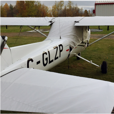
Cessna 150M Empennage Cover All Year Use with Hail Protection Cessna 150 & 152 Horizontal Stabilizer Covers, Winter Use