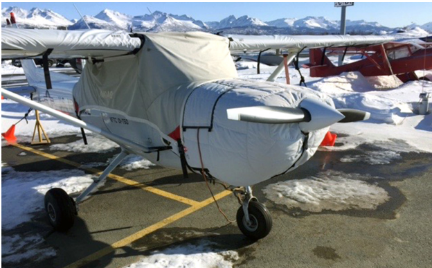
Cessna 150 Insulated Engine Cover