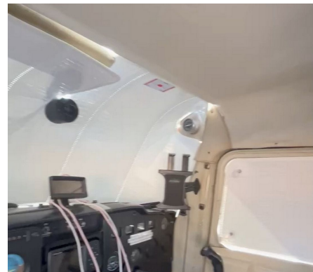
Cessna 150 Cabin HeatShields