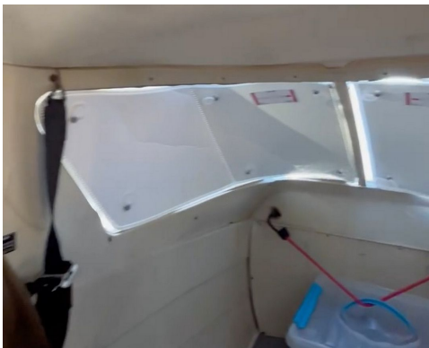
Cessna 150 Cabin HeatShields

Windshield Heatshields are interior sunshades for an aircraft's front windshield. The product is a unique composite of closed-cell foam with a silver mylar finish. The semi-rigid design is stiff enough to stand along the inside of the windshield using sun visors or window framing. It folds up flat and easily stores in the included storage sleeve. Some designs may require velcro and suction cups or split right and left sides. A Heatshield is an excellent short-term remedy for cockpit overheating. An external fabric cover is far more effective and practical for long-term protection.