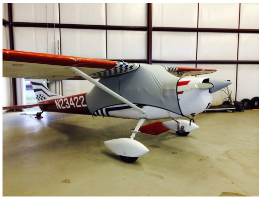
Cessna 150 Spandex FlyAway Travel Cover