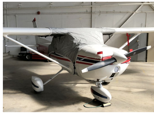
Cessna 150L Travel Cover, Over-Top Style