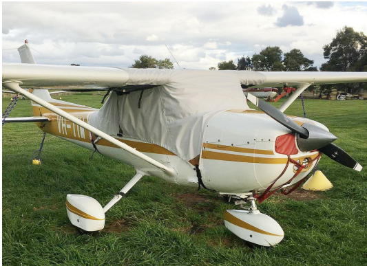
Cessna 150 & 152 Canopy Cover (Over-The-Top Style)

This cover type is made from Silver Acrylic Sunbrella canvas and is 100% lined with a soft and smooth microfiber. Bruce's Custom Covers developed this material combination especially for aircraft protection. The outer material is medium weight and treated for water resistance, UV resistance and anti-static buildup. The inner lining is a very soft and smooth microfiber to prevent scratching. The material is very reflective, and tests show that the cabin interior temperature can be reduced to near-ambient temperature on the hottest of days. It is water, ice and snow repellent, yet breathable to allow moisture to escape from between the cover and the aircraft surface.