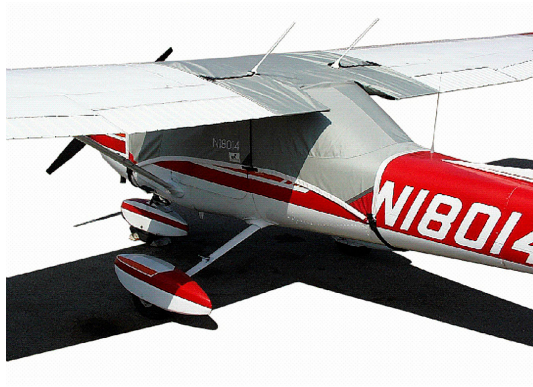
Cessna 150 Over-the-Top Canopy Cover