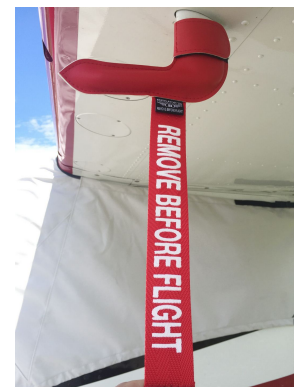
Cessna A185F Pitot Cover