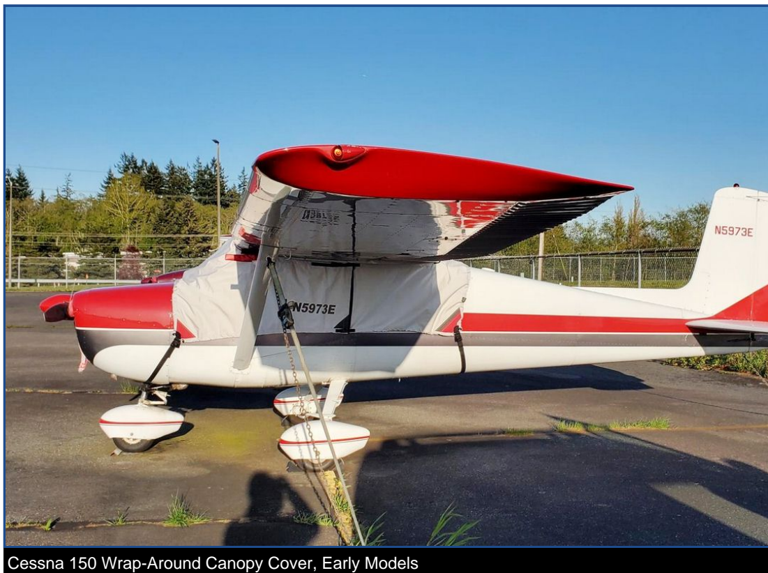
Cessna 150 Wrap-Around Canopy Cover, Early Models