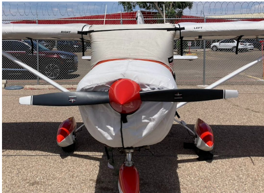
Cessna 150 & 152 Engine Cover, Hail Protection

This cover type is made from Silver Acrylic Sunbrella canvas and is 100% lined with a soft and smooth microfiber. Bruce's Custom Covers developed this material combination especially for aircraft protection. The outer material is medium weight and treated for water resistance, UV resistance and anti-static buildup. The inner lining is a very soft and smooth microfiber to prevent scratching. The material is very reflective, and tests show that the cabin interior temperature can be reduced to near-ambient temperature on the hottest of days. It is water, ice and snow repellent, yet breathable to allow moisture to escape from between the cover and the aircraft surface.