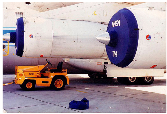
Intake Covers for Lockheed C-141