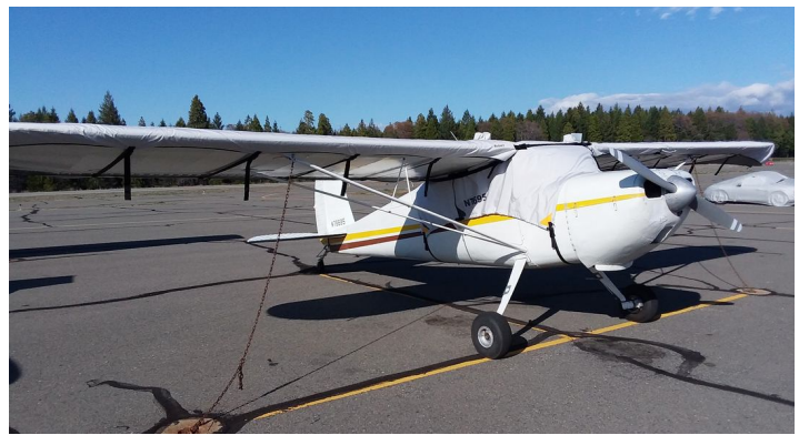
Cessna 140 Canopy and Wing Covers