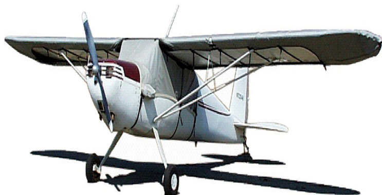
Cessna 120 Canopy Cover & Wing Covers

This cover type is made from Silver Acrylic Sunbrella canvas and is 100% lined with a soft and smooth microfiber. Bruce's Custom Covers developed this material combination especially for aircraft protection. The outer material is medium weight and treated for water resistance, UV resistance and anti-static buildup. The inner lining is a very soft and smooth microfiber to prevent scratching. The material is very reflective, and tests show that the cabin interior temperature can be reduced to near-ambient temperature on the hottest of days. It is water, ice and snow repellent, yet breathable to allow moisture to escape from between the cover and the aircraft surface.