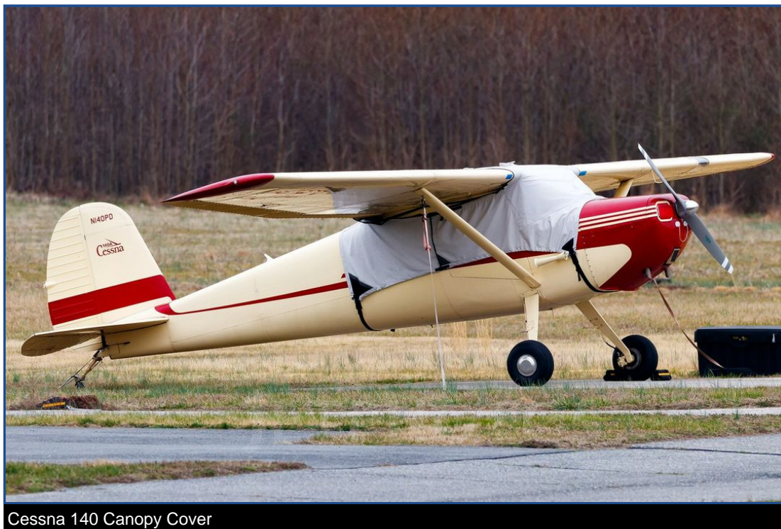
Cessna 140 Canopy Cover