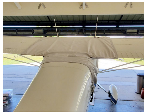
Cessna 140 Canopy Cover, Over Top Type, extends to cover gas caps