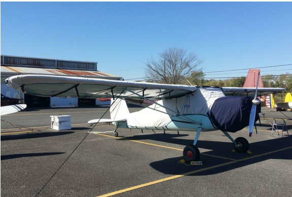
FOR INTERIOR USE. Cub Crafters CC-11 Insulated Hangar Blanket, Cessna 140 Insulated Engine, Canopy, Empennage & Wing Covers available in Red or Silver