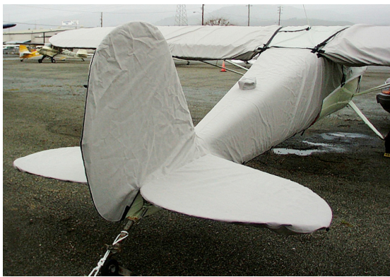
Cessna 120 Empennage Cover