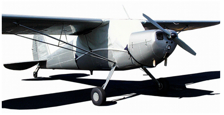
Cessna 120 Over-Top Canopy Cover