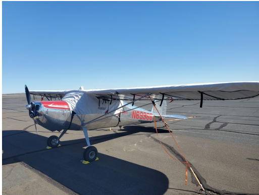
Cessna 140 Over The Top Style Canopy Cover, Wing Covers

WINTER USE MATERIAL - Made with Solution-Dyed Polyester fabric, this option is intended for seasonal use to aid in deicing, rain mitigation, or for occasional travel. The material is lighter and more compact, but more susceptible to UV damage and may have a shorter useful life if used continuously outside than the all-year use material.