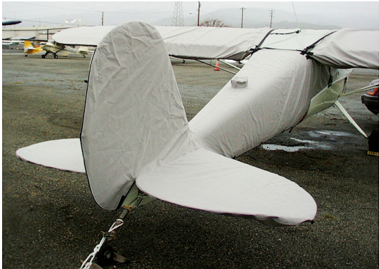
Cessna 120 Empennage & Wing Covers

WINTER USE MATERIAL - Made with Solution-Dyed Polyester fabric, this option is intended for seasonal use to aid in deicing, rain mitigation, or for occasional travel. The material is lighter and more compact, but more susceptible to UV damage and may have a shorter useful life if used continuously outside than the all-year use material.