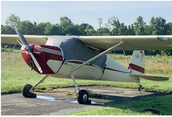
Cessna 140 Travel Weight Canopy Cover