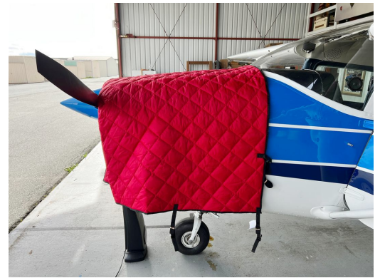
Insulated Hangar Blanket on Cessna 182