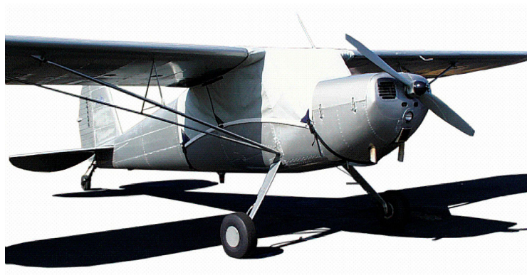
Cessna 120 Over-Top Canopy Cover