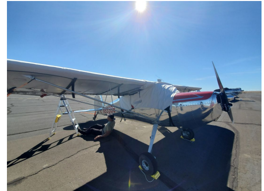
Cessna 140 Over The Top Style Canopy Cover