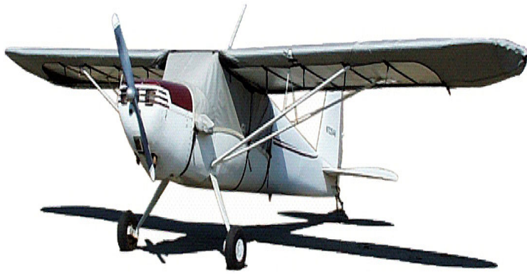
Cessna 120 Canopy Cover & Wing Covers