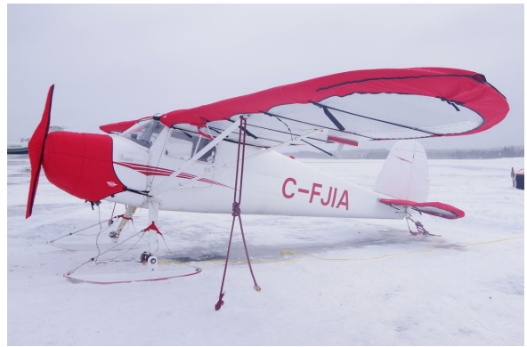
Cessna 120 Insulated Engine & Prop Covers, Wing & Tail Covers