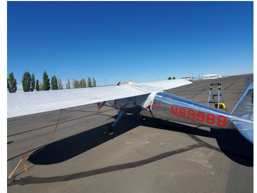
Cessna 140 Wing Covers