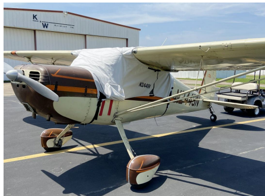
Cessna 140 Over-Top Canopy Cover

This cover type is made from Silver Acrylic Sunbrella canvas and is 100% lined with a soft and smooth microfiber. Bruce's Custom Covers developed this material combination especially for aircraft protection. The outer material is medium weight and treated for water resistance, UV resistance and anti-static buildup. The inner lining is a very soft and smooth microfiber to prevent scratching. The material is very reflective, and tests show that the cabin interior temperature can be reduced to near-ambient temperature on the hottest of days. It is water, ice and snow repellent, yet breathable to allow moisture to escape from between the cover and the aircraft surface.