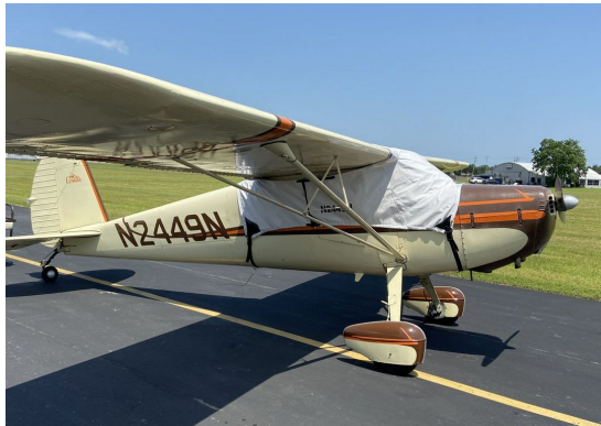
Cessna 140 Over-Top Canopy Cover

This cover type is made from Silver Acrylic Sunbrella canvas and is 100% lined with a soft and smooth microfiber. Bruce's Custom Covers developed this material combination especially for aircraft protection. The outer material is medium weight and treated for water resistance, UV resistance and anti-static buildup. The inner lining is a very soft and smooth microfiber to prevent scratching. The material is very reflective, and tests show that the cabin interior temperature can be reduced to near-ambient temperature on the hottest of days. It is water, ice and snow repellent, yet breathable to allow moisture to escape from between the cover and the aircraft surface.