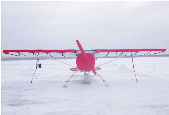
Cessna 120 Insulated Engine & Prop Covers, Wing & Tail Covers

WINTER USE MATERIAL - Made with Solution-Dyed Polyester fabric, this option is intended for seasonal use to aid in deicing, rain mitigation, or for occasional travel. The material is lighter and more compact, but more susceptible to UV damage and may have a shorter useful life if used continuously outside than the all-year use material.