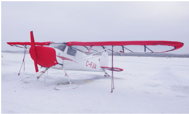
Cessna 120 Insulated Engine & Prop Covers, Wing & Tail Covers

This cover type is made from Silver Acrylic Sunbrella canvas and is 100% lined with a soft and smooth microfiber. Bruce's Custom Covers developed this material combination especially for aircraft protection. The outer material is medium weight and treated for water resistance, UV resistance and anti-static buildup. The inner lining is a very soft and smooth microfiber to prevent scratching. The material is very reflective, and tests show that the cabin interior temperature can be reduced to near-ambient temperature on the hottest of days. It is water, ice and snow repellent, yet breathable to allow moisture to escape from between the cover and the aircraft surface.