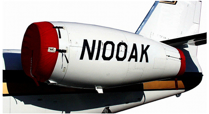
IAI Astra Engine Cover Set