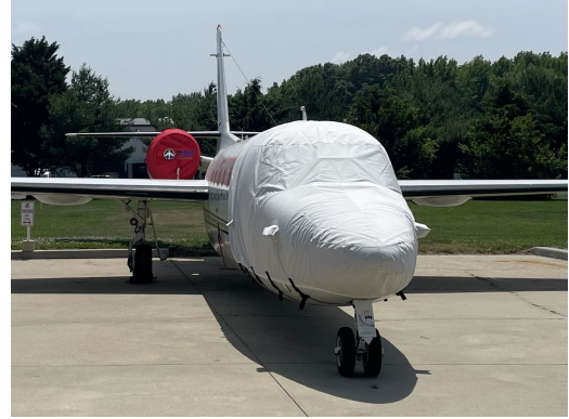
IAI 1124 Cockpit/Nose Cover Extended Aft Over Entry Door