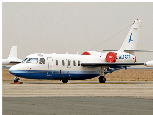
Engine Covers & Cockpit HeatShields

Cockpit Heatshields are interior sunshades for the aircraft's cockpit. The product is a unique composite of closed-cell foam with a silver mylar finish. The semi-rigid design is stiff enough to stand inside the window framing. The set folds up flat and is easily stored in the included storage sleeve. Some designs may require velcro and suction cups. Our Heatshields for jets are offered white side out because some aircraft manufacturers have issued advisories against reflective window inserts due to potential heat damage. A Heatshield is an excellent short-term remedy for cockpit overheating, but an external fabric cover is more effective for long-term protection.