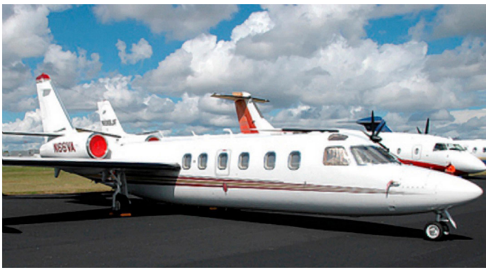
Westwind Engine Intake Plugs