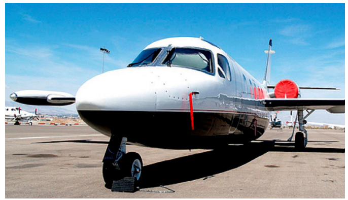
Westwind Engine Cover Set, Pitot Cover