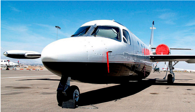
Westwind Engine Cover Set, Pitot Cover

The Engine Inlet Plugs are custom fit for your Israel Aircraft Industries Jet Commander 1121 intakes, made with heavy-duty vinyl material, and stuffed with a single block of sculpted urethane foam. Each plug has a zipper that allows the foam to be removed and dried if necessary. Engine plugs have 'remove before flight' streamers sewn onto the face of the plugs. Most plugs are imprinted with the aircraft registration number in black for an extra charge. Storage bag NOT included. Engine plugs may be inserted after flight when the engine is still warm. Engine Inlet Plugs are commonly referred to as Cowl Plugs, Intake Plugs, Cowl Blocks, Engine Blocks, and Engine Bungs.