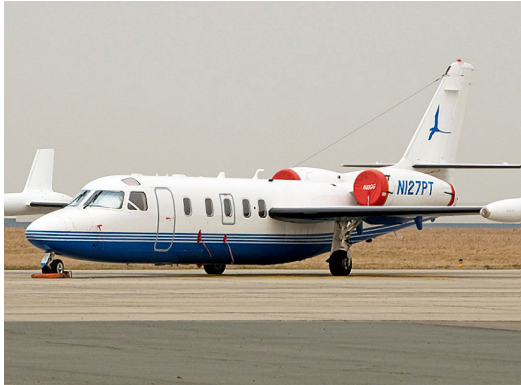
Engine Covers & Cockpit HeatShields