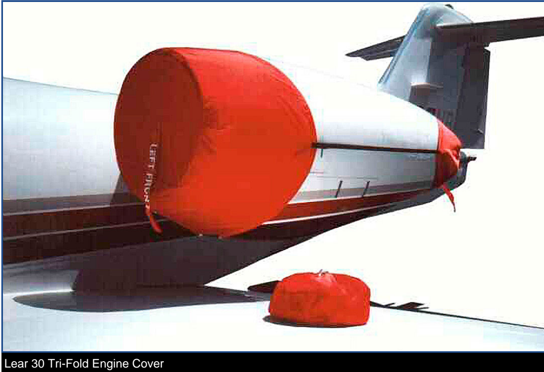
Lear 30 Tri-Fold Engine Cover