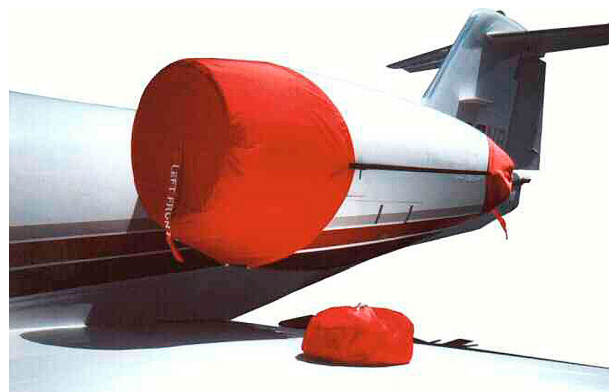
Lear 30 Tri-Fold Engine Cover