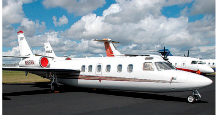
Westwind Engine Intake Plugs