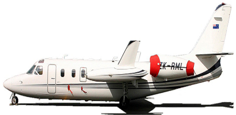
Jet Commander Engine Covers